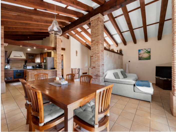
Open-plan living and dining area