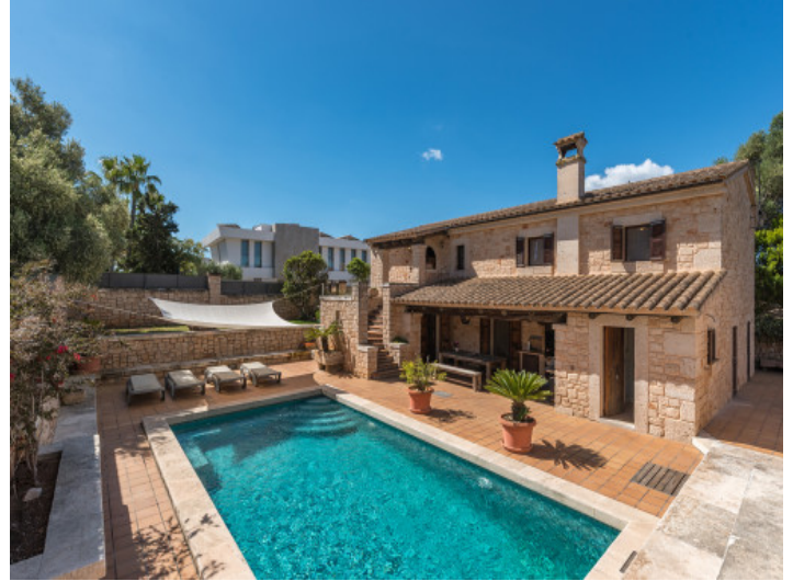
The terrace and pool are situated on a slightly lower level