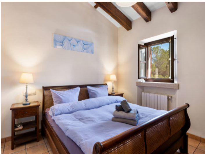
First guest bedroom on the upper floor