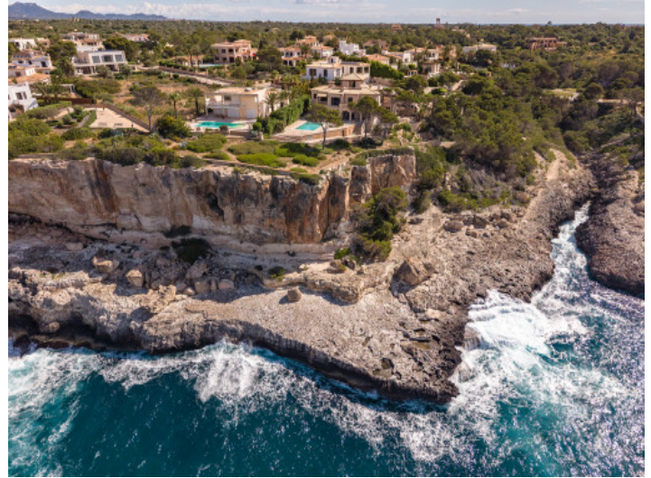
Coastline of Cala Santanyi