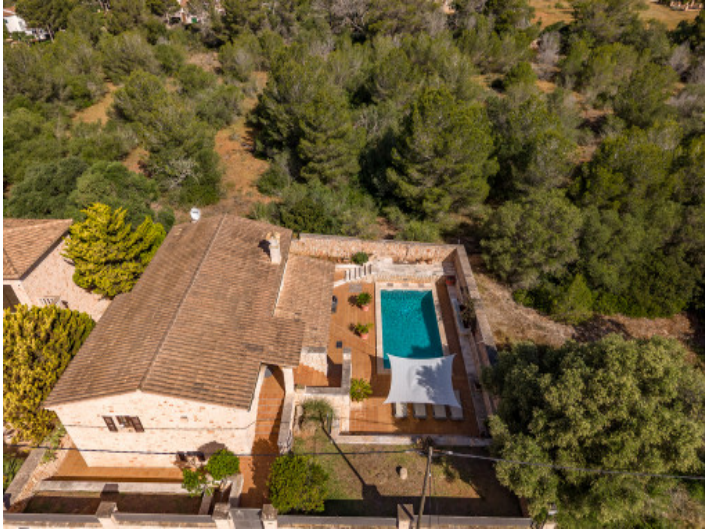
Directly adjacent to a non-buildable forest plot