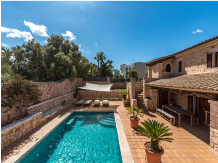
The terrace and pool are situated on a slightly lower level