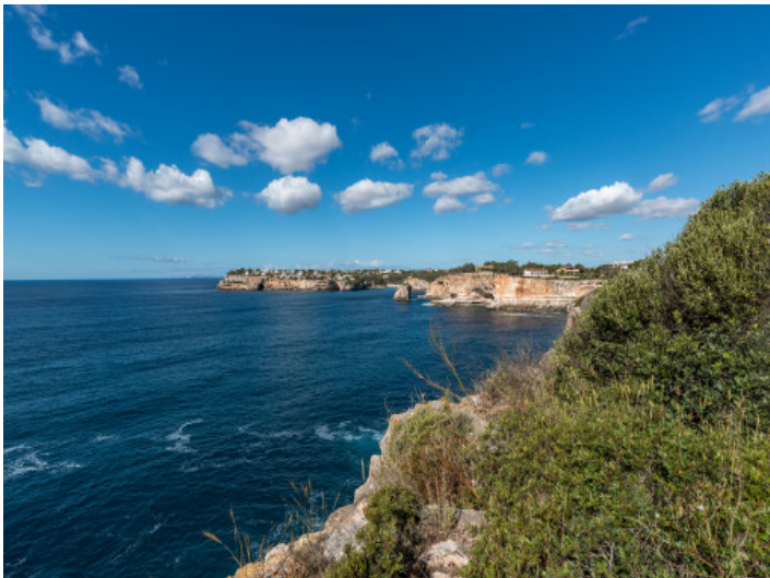
View towards Es Pontàs