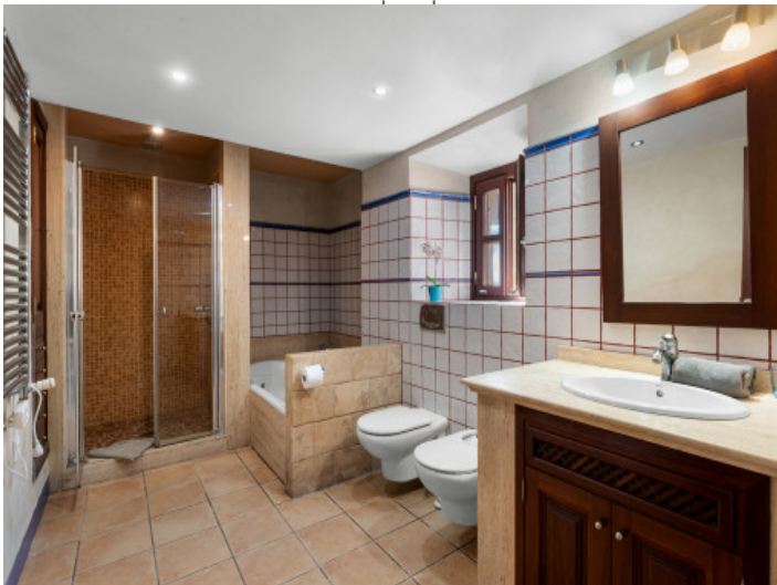
Master bedroom bathroom