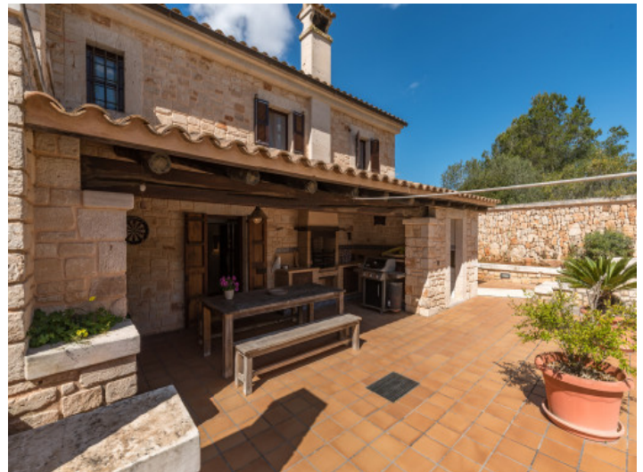
Covered terrace directly adjacent to the house with access to the ground floor

All information is correct to the best of our knowledge. Errors and prior sale excepted. This prospectus is purely for information purposes. Only the notarial deed of sale is legally binding.