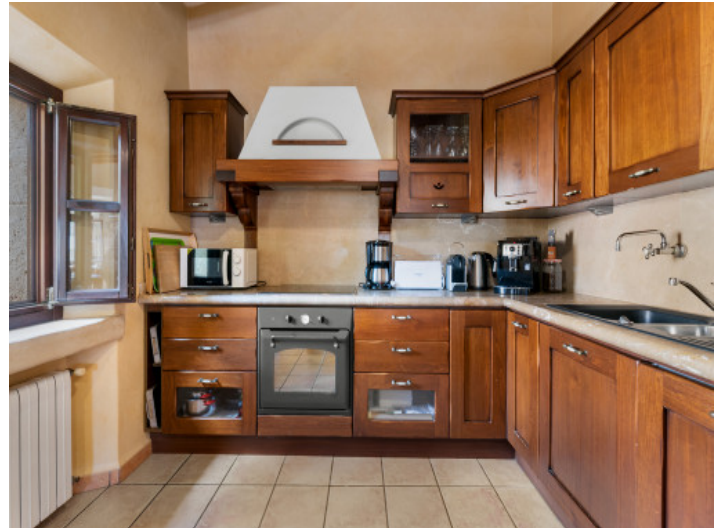
Fully equipped fitted kitchen