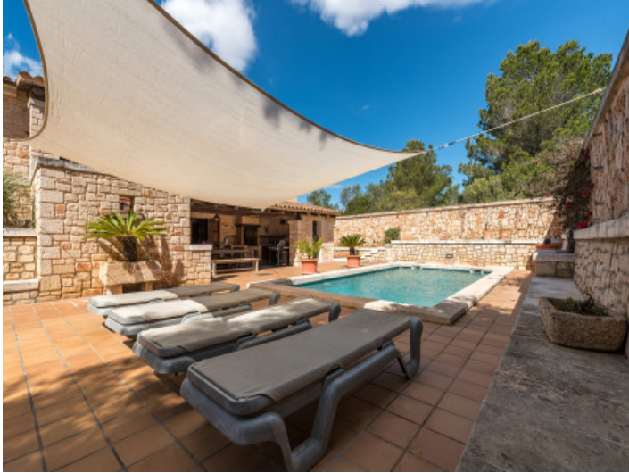
Sun terrace by the pool