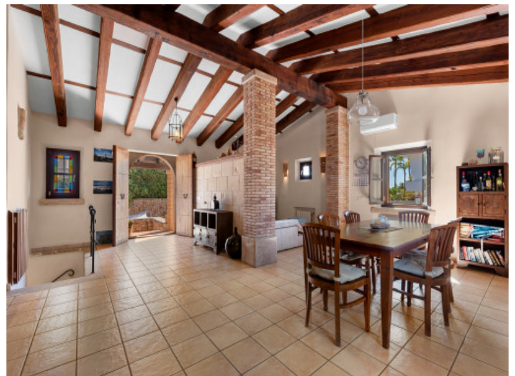
Entrance area flowing seamlessly into the open-plan living area

All information is correct to the best of our knowledge. Errors and prior sale excepted. This prospectus is purely for information purposes. Only the notarized deed of sale is legally binding.