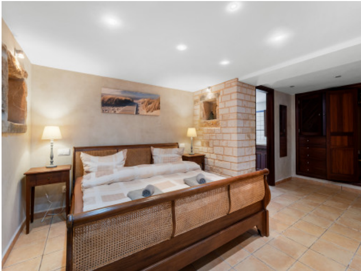
Master bedroom on the ground floor with direct level access to the terrace