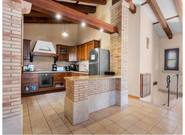
Kitchen adjoining the living area