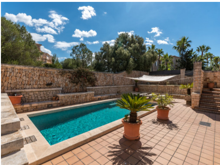
Pool with integrated built-in seating area