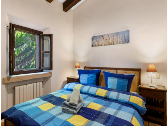
Second guest bedroom on the upper floor