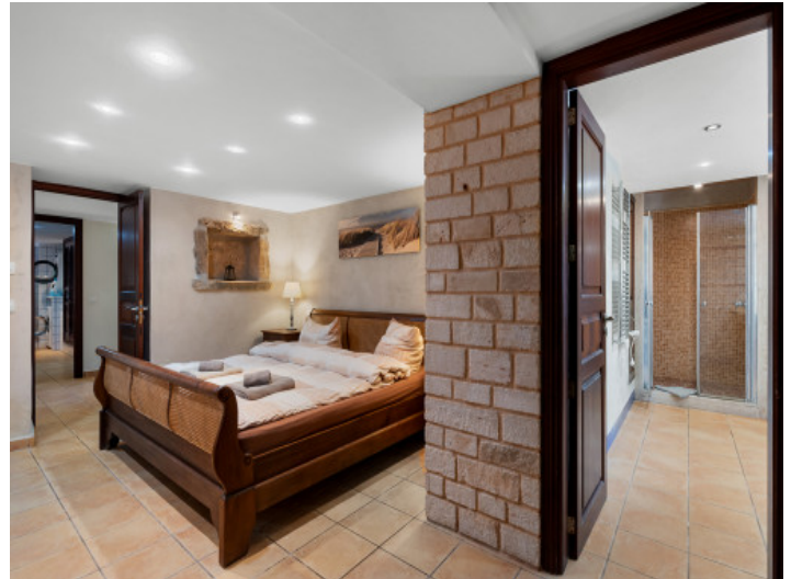
Master bedroom with en-suite bathroom