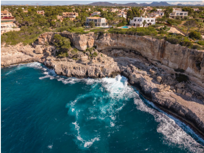
Coastline of Cala Santanyi