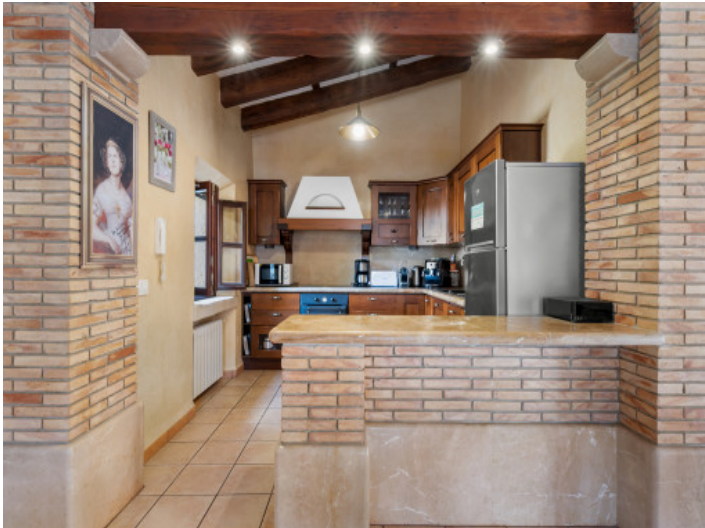
Kitchen adjoining the living area