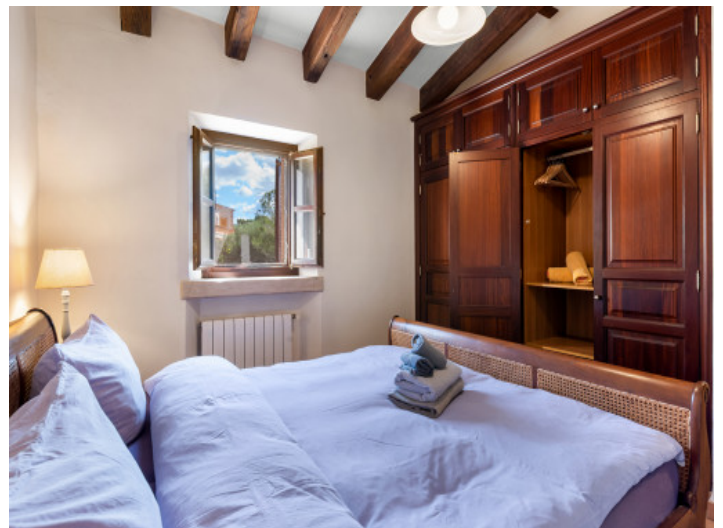
First guest bedroom on the upper floor

All information is correct to the best of our knowledge. Errors and prior sale excepted. This prospectus is purely for information purposes. Only the notarized deed of sale is legally binding.