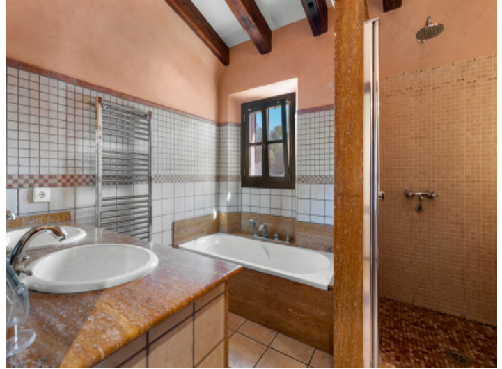
Bathroom on the upper floor