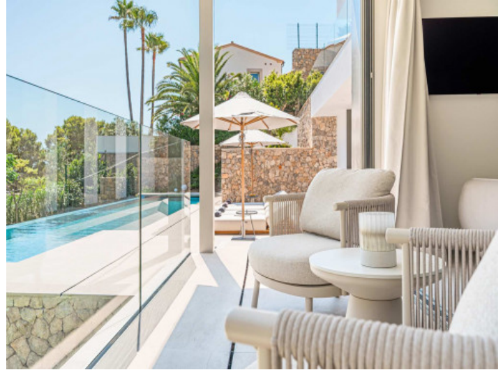
Time to enjoy