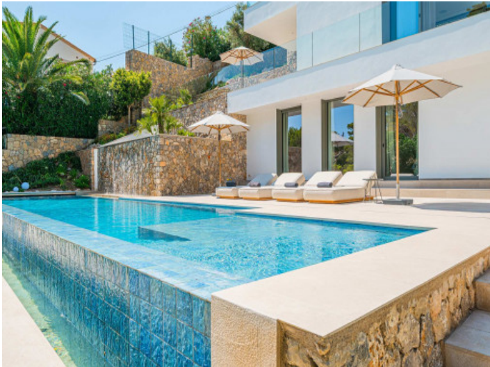
Heated infinity pool