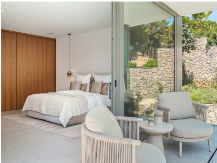
One of the four sleeping areas with direct access to the terrace