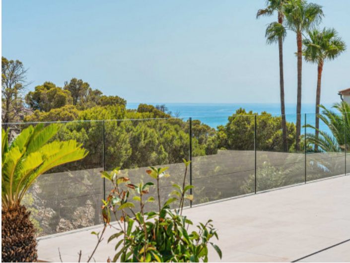
Idyllic atmosphere with partial sea view