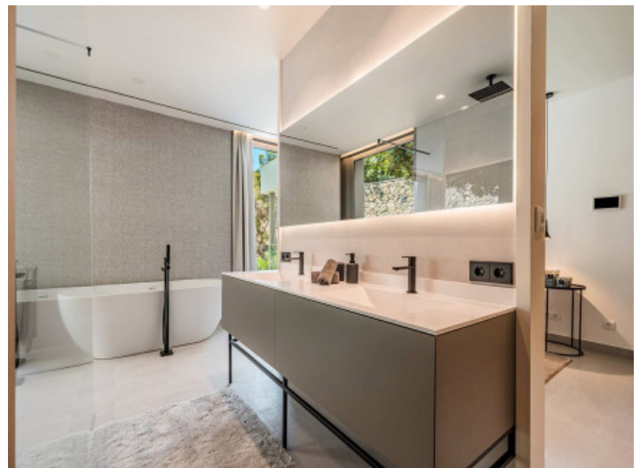
One of the five bathrooms

All information is correct to the best of our knowledge. Errors and prior sale excepted. This prospectus is purely for information purposes. Only the notarized deed of sale is legally binding.