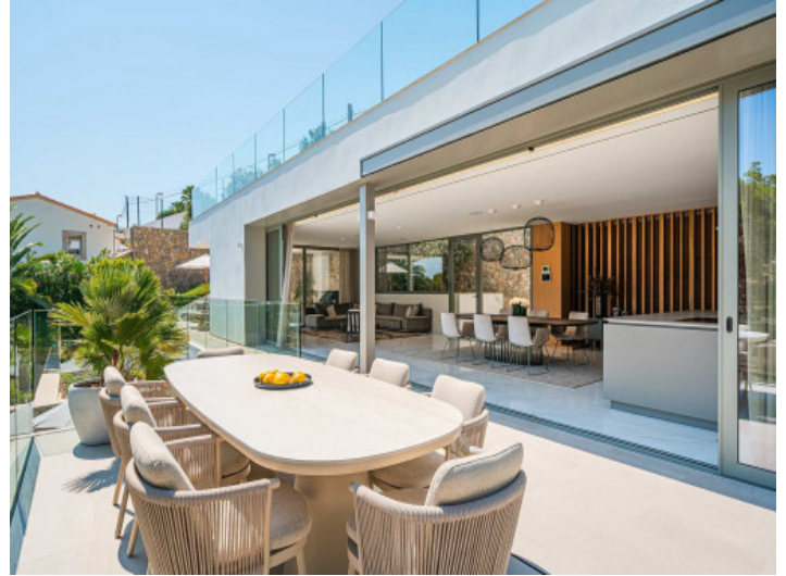
Living and dining area with direct access to the spacious terrace