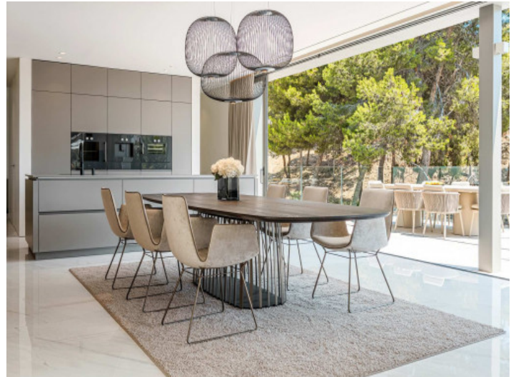
Light-filled dining area with access to the terrace