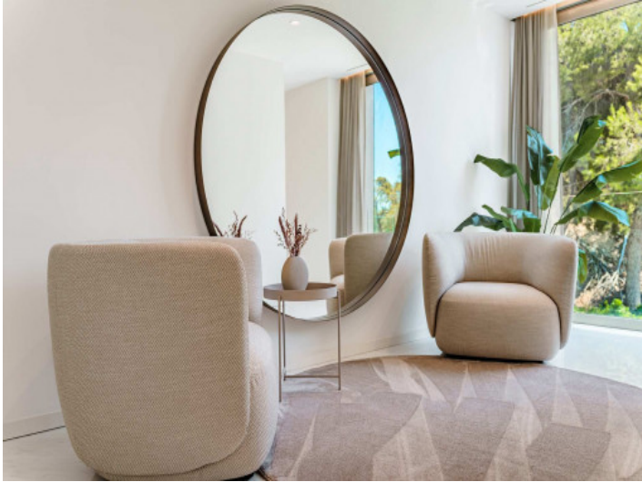
Cozy relaxation corner