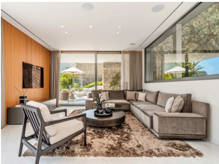
Modern living area with large window front