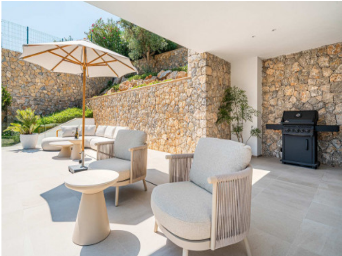
Partially covered terrace