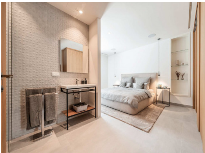
One of the four bedrooms