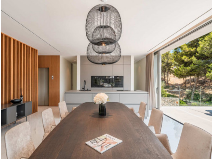
Stylish kitchen and dining area