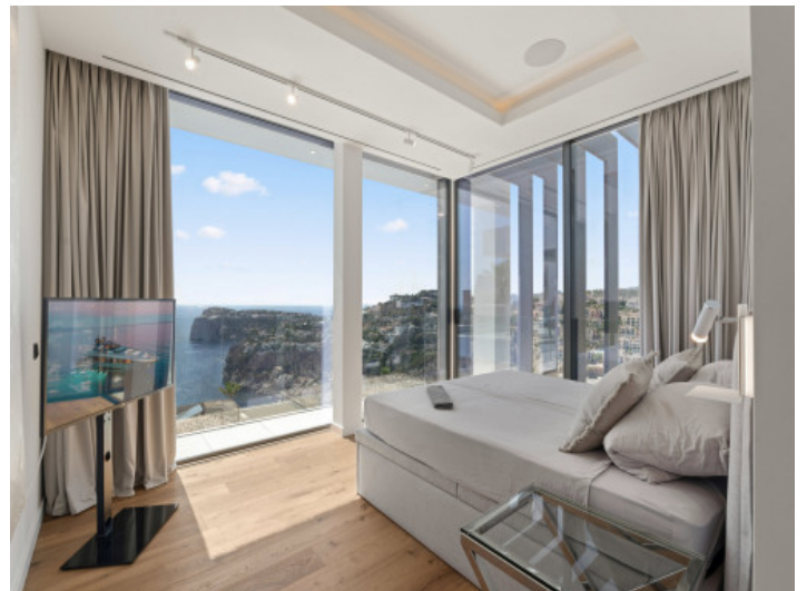
Bedroom with floor-to-ceiling windows