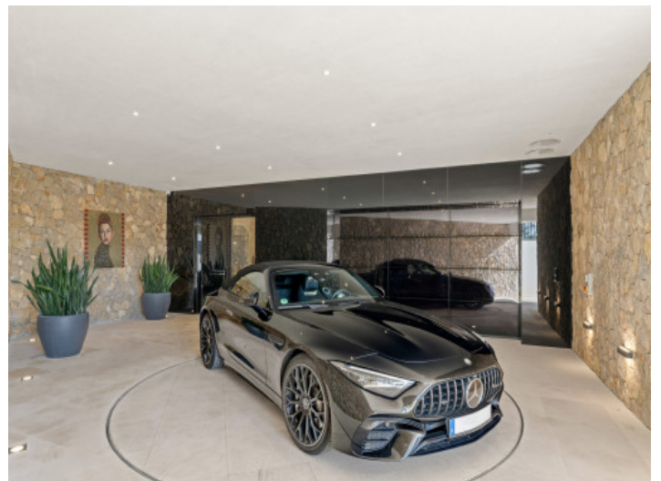
House entrance with turntable

All information is correct to the best of our knowledge. Errors and prior sale excepted. This prospectus is purely for information purposes. Only the notarized deed of sale is legally binding.