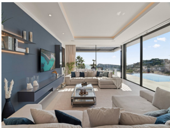
Living area with magnificent sea view