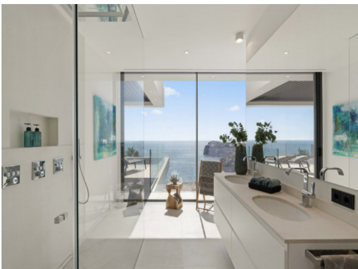
Designer bathroom with sea view