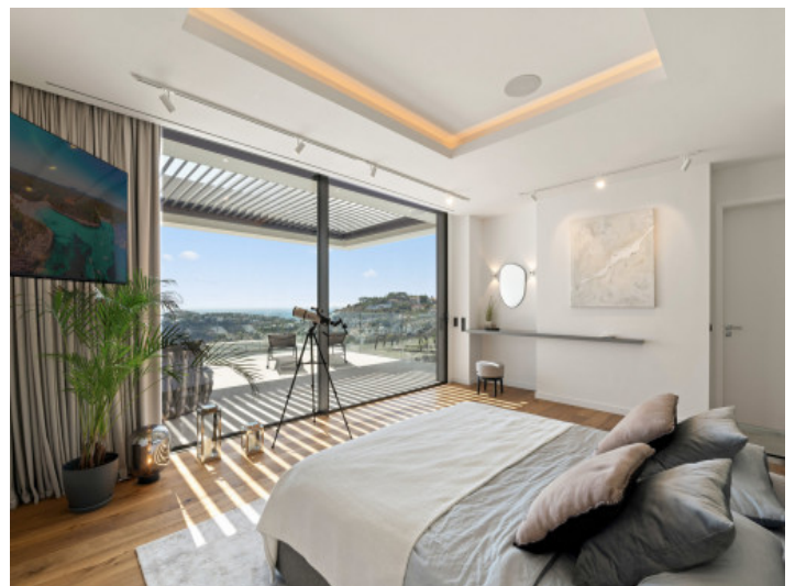
One of the 5 bedrooms