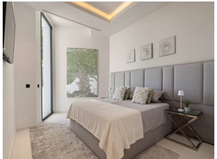
One of the 5 bedrooms