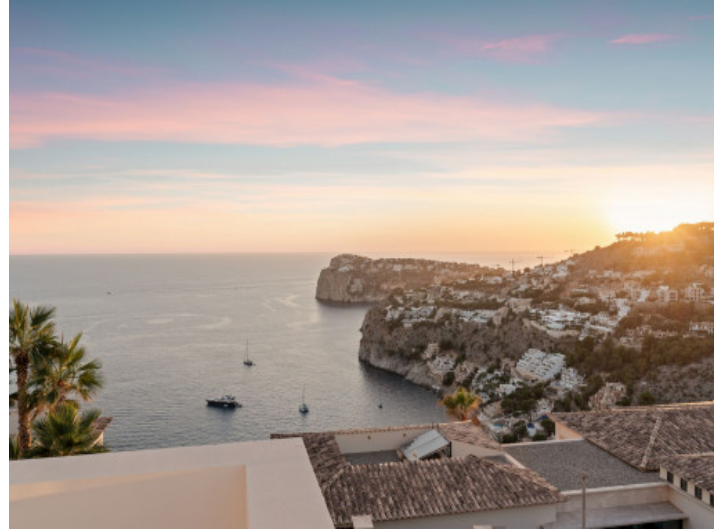
Unique meditteran sea views