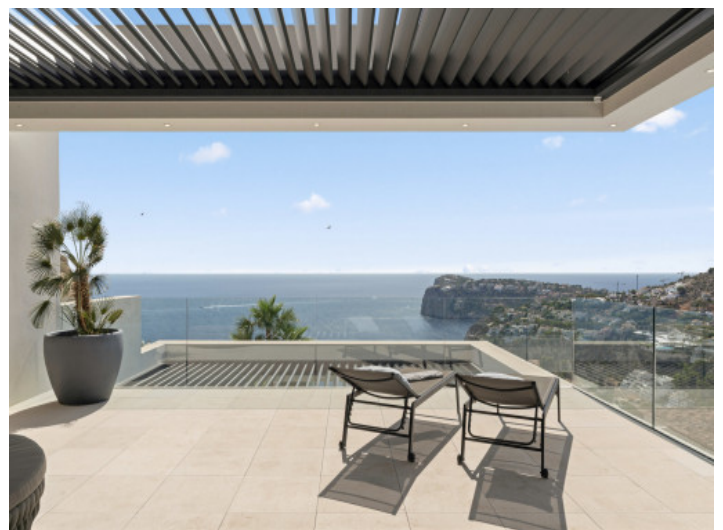
Covered sea view terrace

All information is correct to the best of our knowledge. Errors and prior sale excepted. This prospectus is purely for information purposes. Only the notarized deed of sale is legally binding.