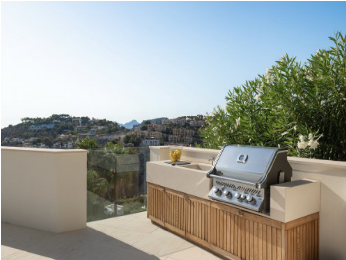
High-quality outdoor kitchen