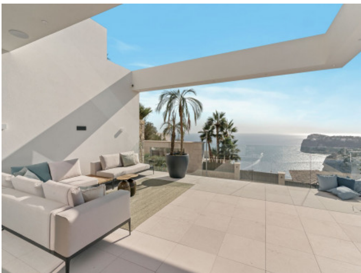
Terrace with sea view