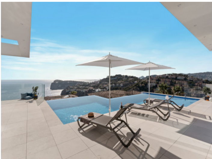
Terrace with sea views