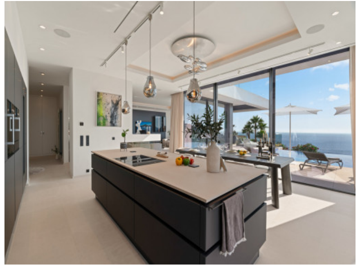
Designer cooking island