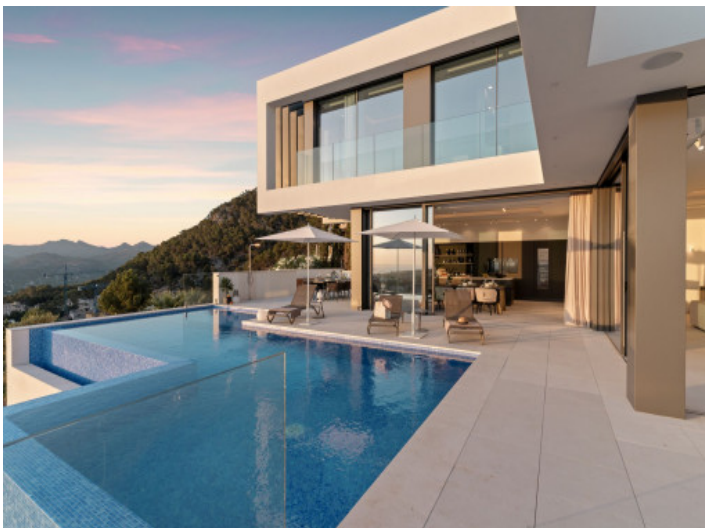
Spacious terrace and outdoor area