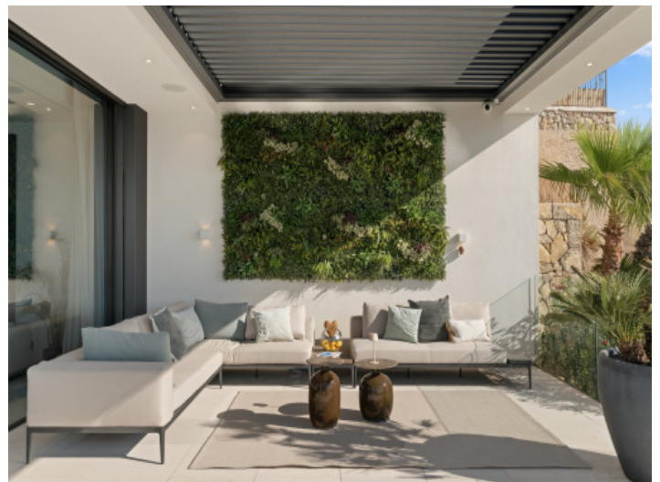
Cozy chill-out area

All information is correct to the best of our knowledge. Errors and prior sale excepted. This prospectus is purely for information purposes. Only the notarized deed of sale is legally binding.