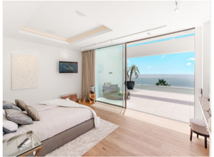
Bedroom with terrace access