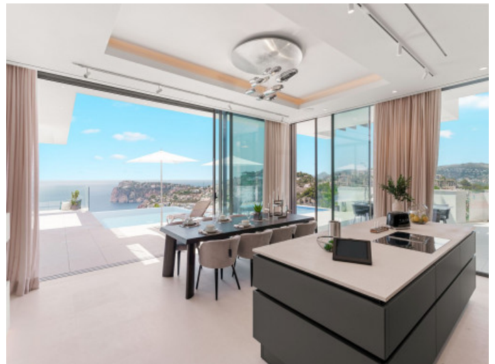
Dining area with fantastic views