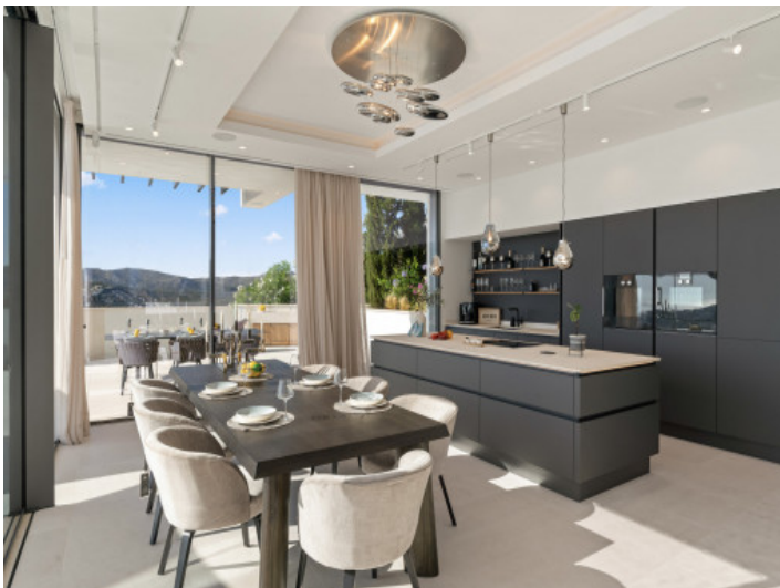
Designer kitchen with stylish dining area