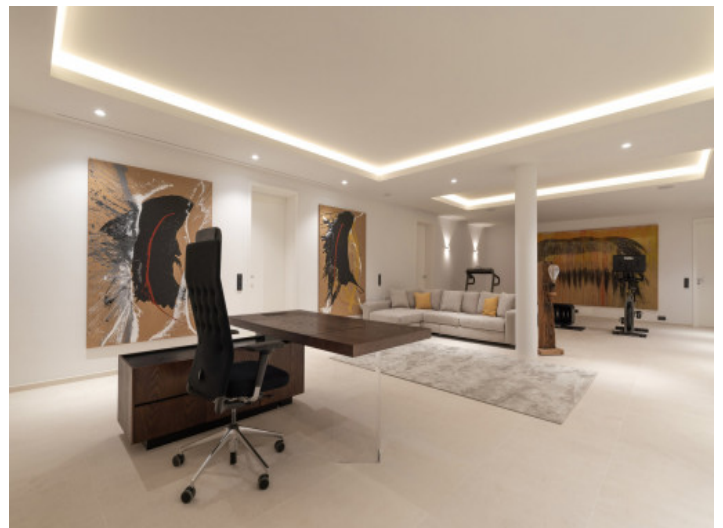
Office and gym

All information is correct to the best of our knowledge. Errors and prior sale excepted. This prospectus is purely for information purposes. Only the notarized deed of sale is legally binding.