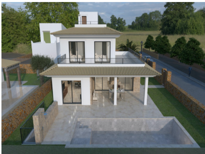
Villa with rooftop terrace