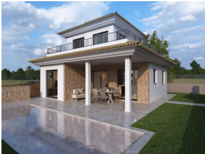
Villa with pool and garden