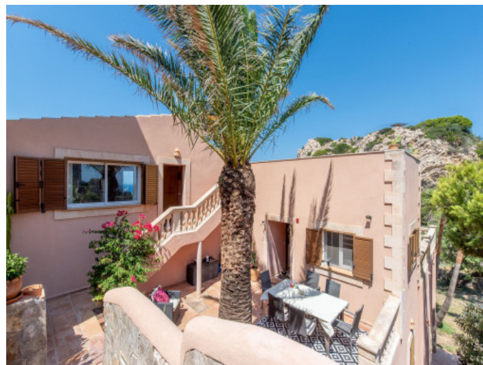
Villa in a quiet hillside location with a low-maintenance garden