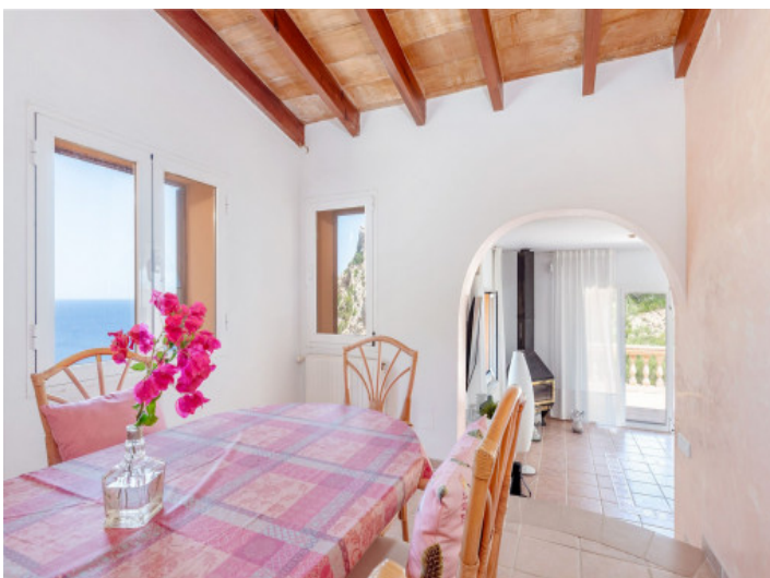
Dining - Situated between kitchen and living area