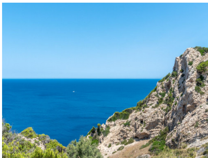
Picture-perfect views from every level of the house