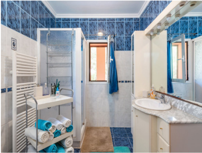
Bathroom with daylight on the groundfloor