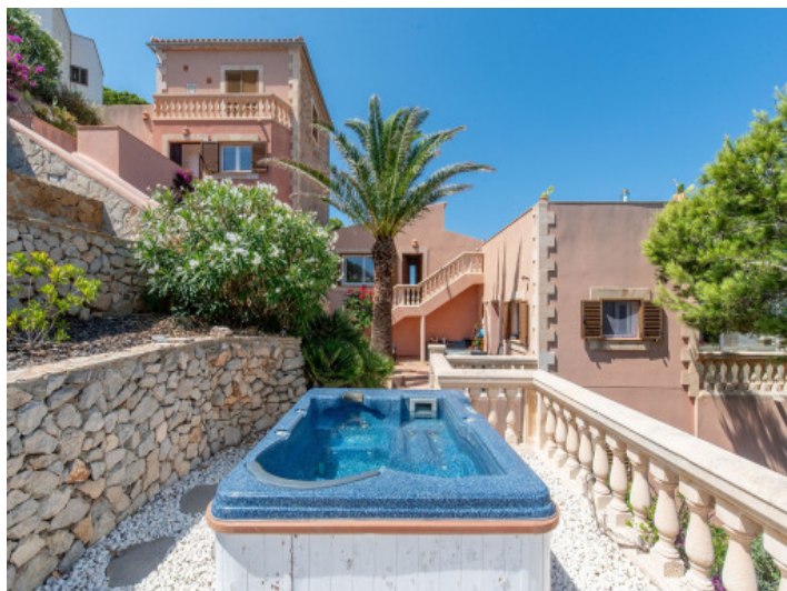
Villa in a quiet hillside location with a low-maintenance garden