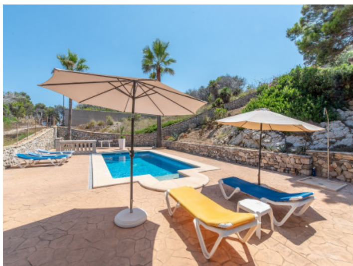
Gaze out across the sea – a peaceful pool area with sun and space