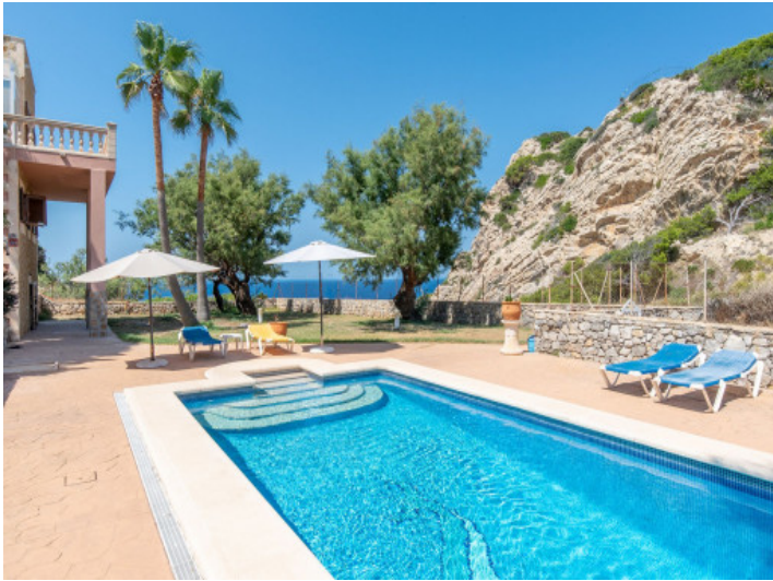
Terrace, pool and panorama – Mediterranean lifestyle under open skies