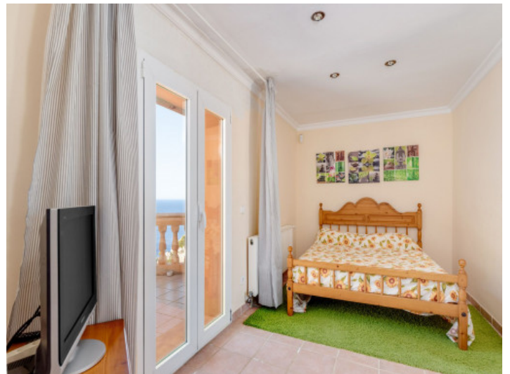
Separate guest apartment with two bedrooms, living room, bathroom and