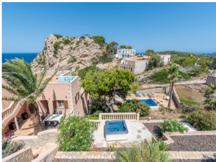
Villa in a quiet hillside location with a low-maintenance garden