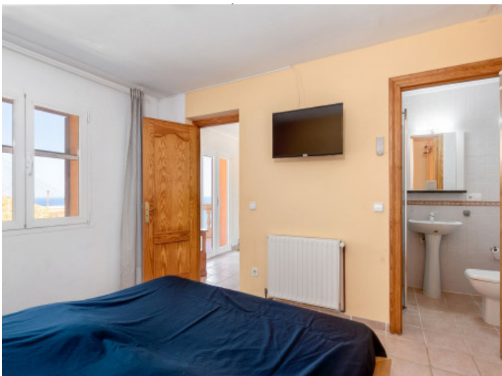
Separate guest apartment with two bedrooms, living room, bathroom and