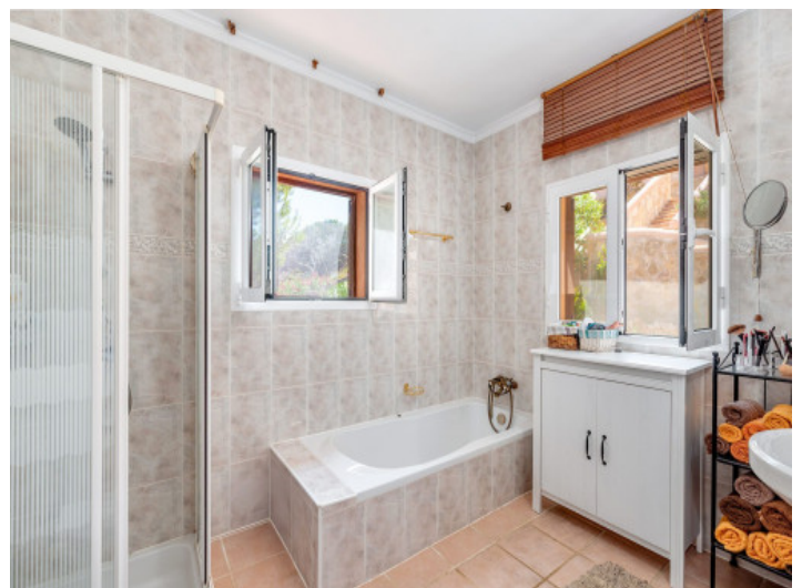
Bathroom with window, bathtub and shower

All information is correct to the best of our knowledge. Errors and prior sale excepted. This prospectus is purely for information purposes. Only the notarized deed of sale is legally binding.