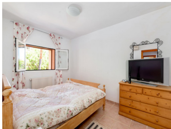
One of the 3 bedrooms on the ground floor

All information is correct to the best of our knowledge. Errors and prior sale excepted. This prospectus is purely for information purposes. Only the notarized deed of sale is legally binding.