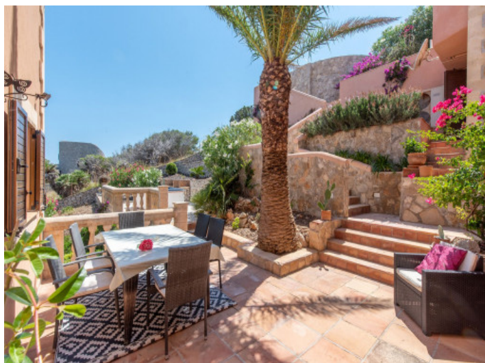
Outdoor dining area - close to the kitchen