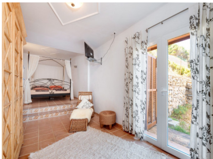
Charming main bedroom with access to the outdoor space and plenty of light