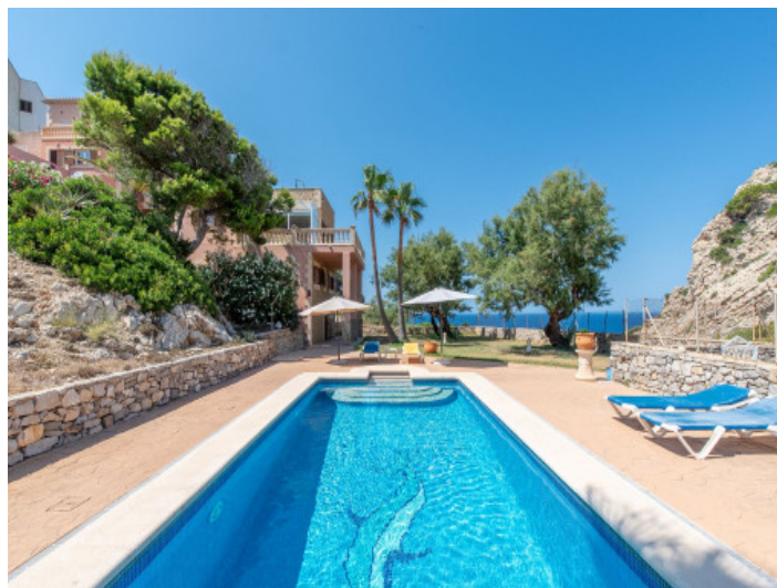
The pool on the lower level invites you to relax