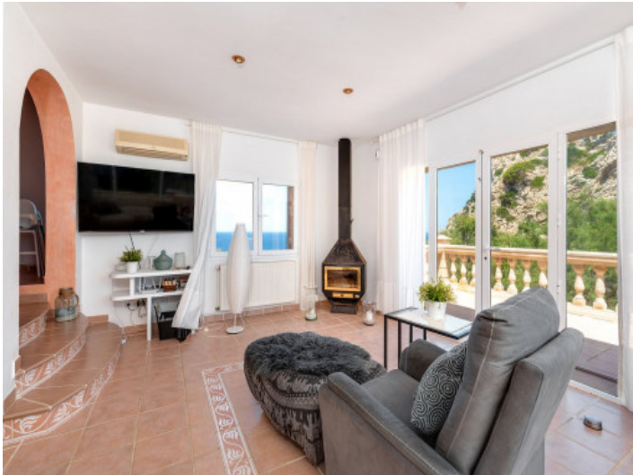
Bright living room with fireplace and access to the sunny terrace with