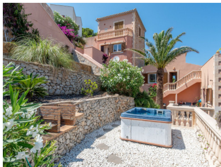
Feel-good moment in the jacuzzi – surrounded by nature and sea air