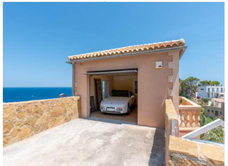
Garage for one car

All information is correct to the best of our knowledge. Errors and prior sale excepted. This prospectus is purely for information purposes. Only the notarized deed of sale is legally binding.