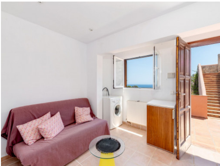
Separate guest apartment with two bedrooms, living room, bathroom and