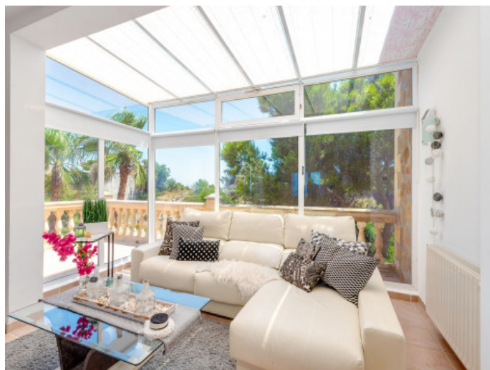
Bright living room with panoramic views and direct terrace access

All information is correct to the best of our knowledge. Errors and prior sale excepted. This prospectus is purely for information purposes. Only the notarized deed of sale is legally binding.