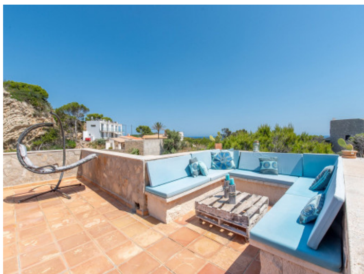
Sun terrace with chill-out area and breathtaking sea view