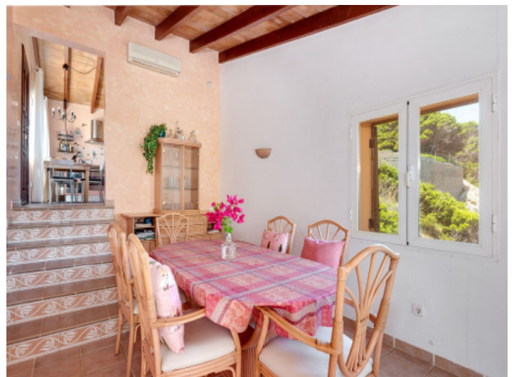
Dining - Situated between kitchen and living area