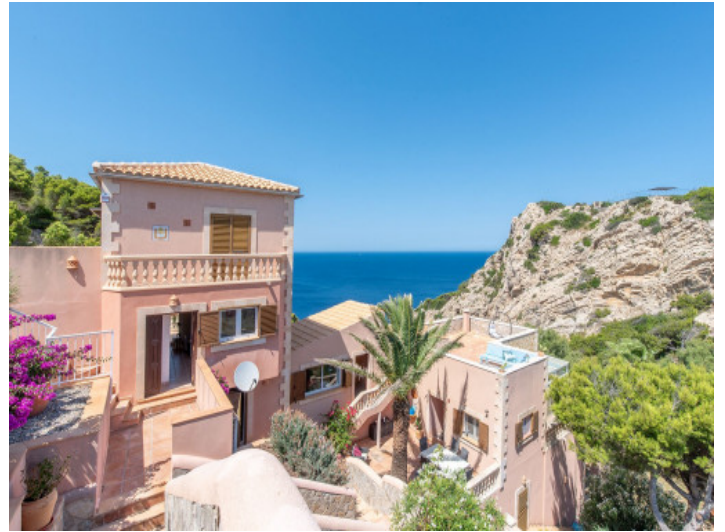
Enjoy the stunning sea view from every level of this well-kept villa