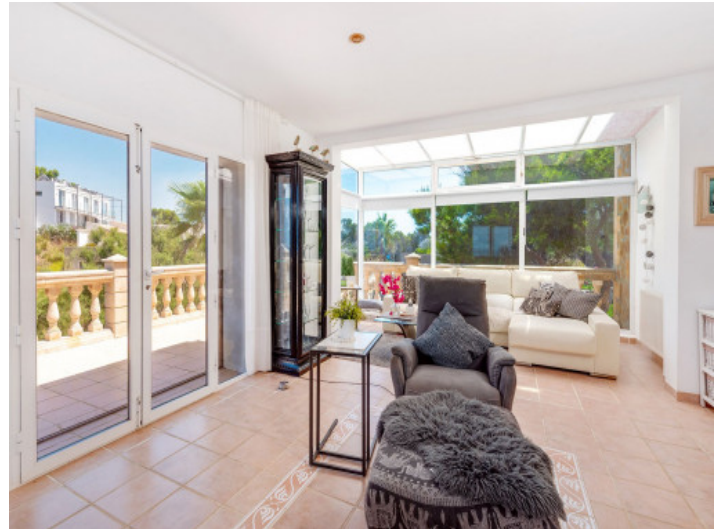
Bright living room with panoramic views and direct terrace access