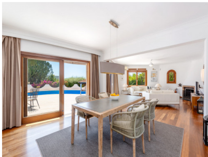
Bright dining area with fireplace