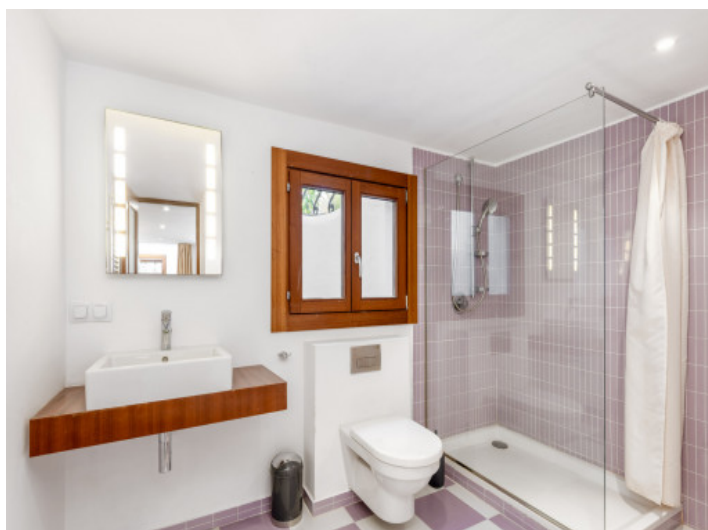
En-suite bathroom in the guest apartment