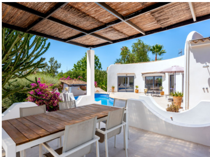
Covered seating area on the terrace