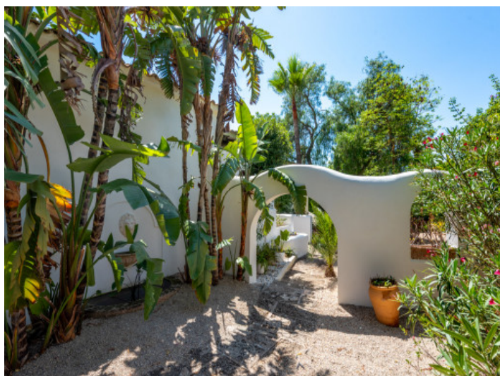
Mature, landscaped garden