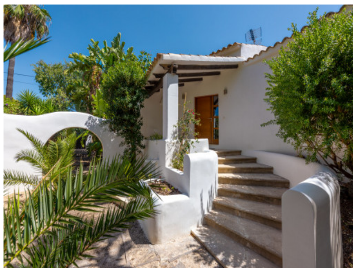
Main entrance to the villa