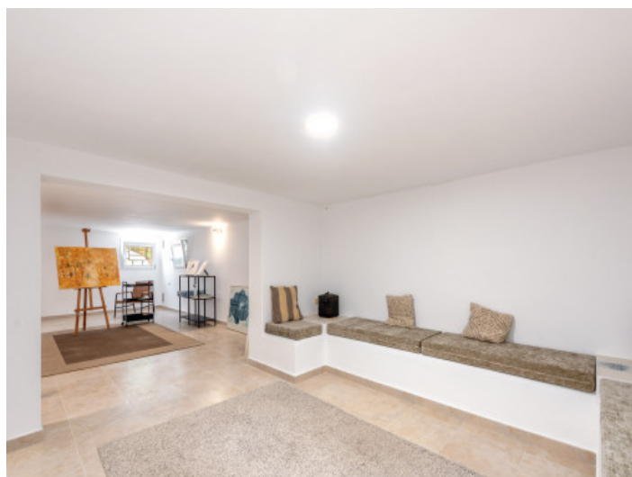
TV room on the lower level