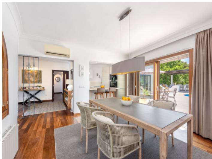
Open-plan living and dining area