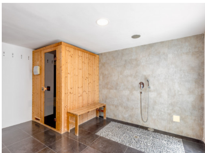
Sauna and shower on the lower level