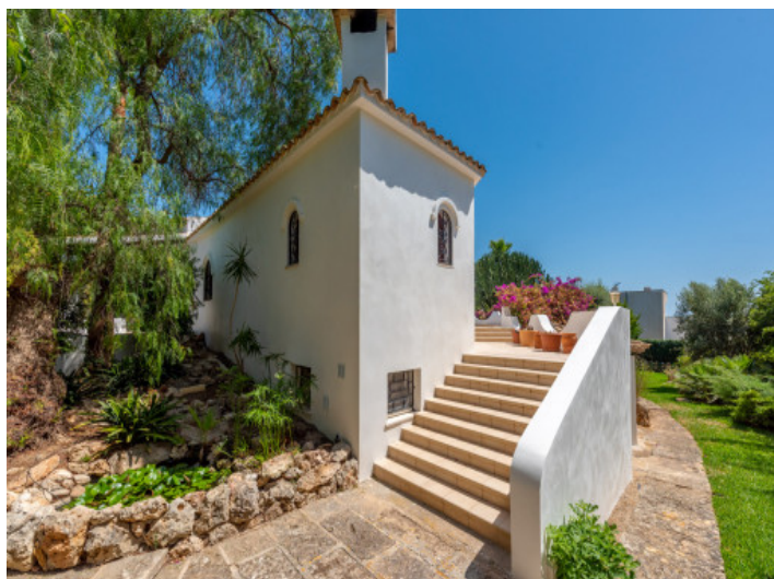
Rear side of the house with staircase leading to the pool terrace