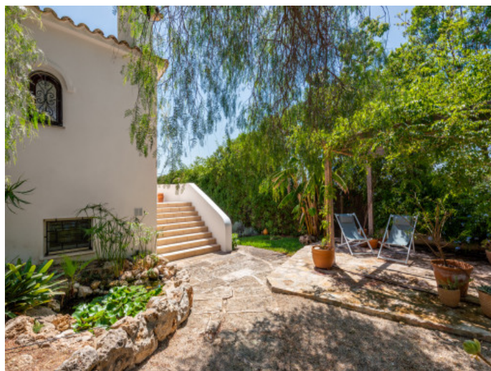
Garden pond with water lilies and cozy seating area

All information is correct to the best of our knowledge. Errors and prior sale excepted. This prospectus is purely for information purposes. Only the notarized deed of sale is legally binding.