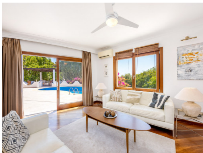
Bright living area with access to the pool terrace