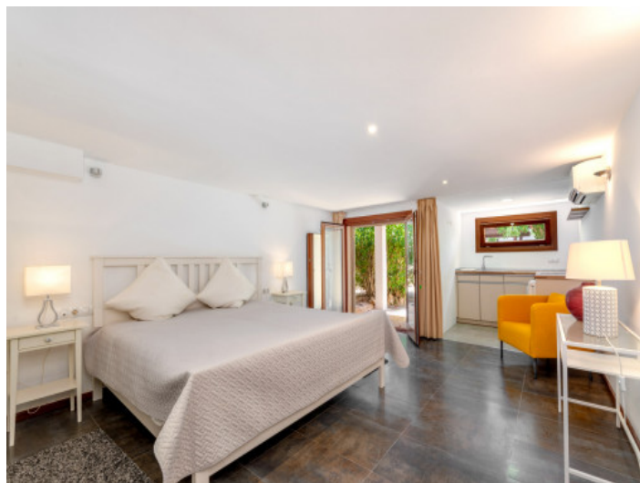
Guest apartment with kitchenette