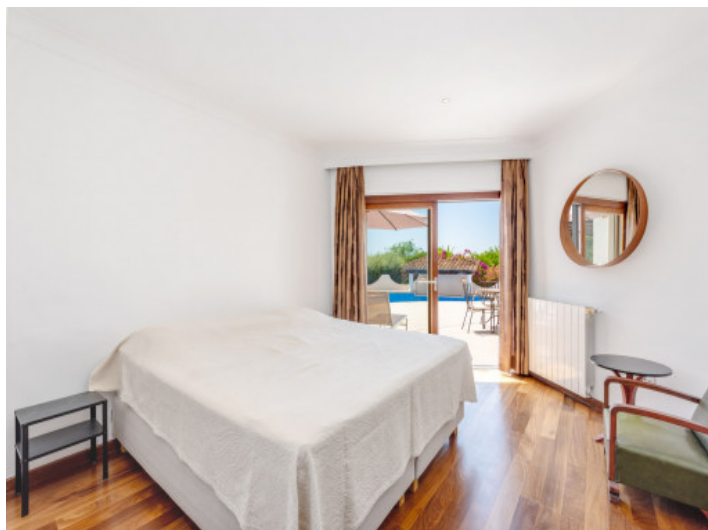
One of three bedrooms on the main floor