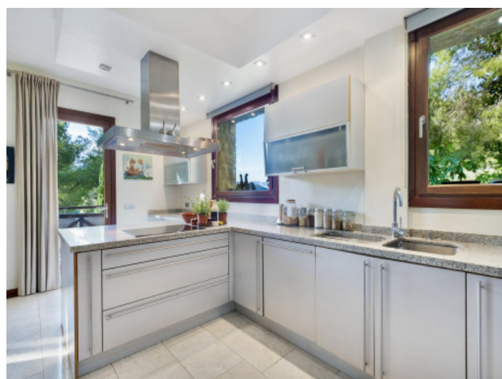
Spacious built-in kitchen