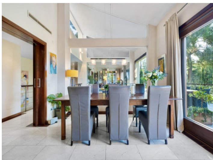
Bright, open dining area