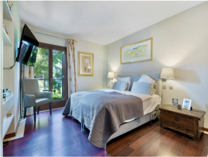
One of 5 spacious bedrooms