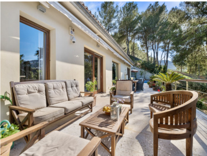
Sunny outdoor terrace