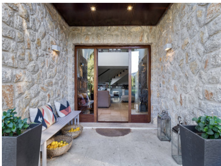
Impressive entrance area