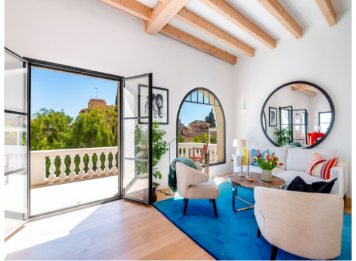
Living area with access to the terrace