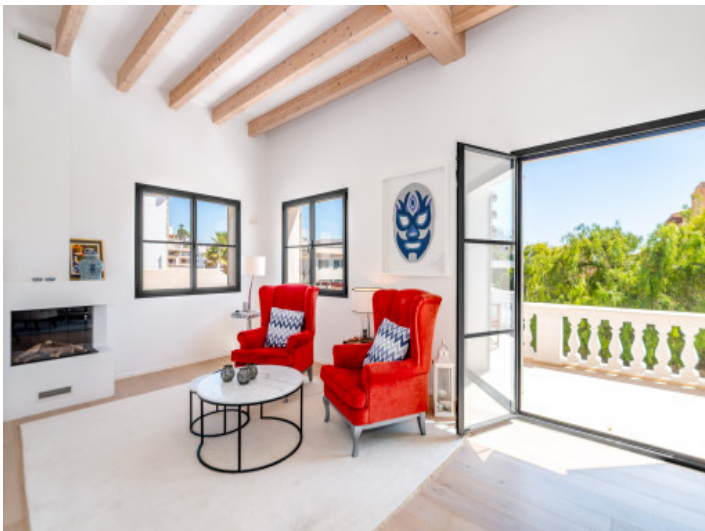
Lounge area with fireplace