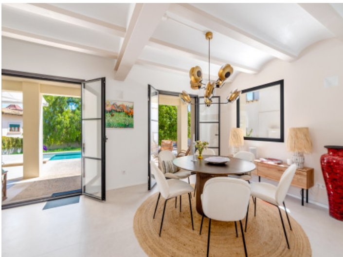
Open dining area