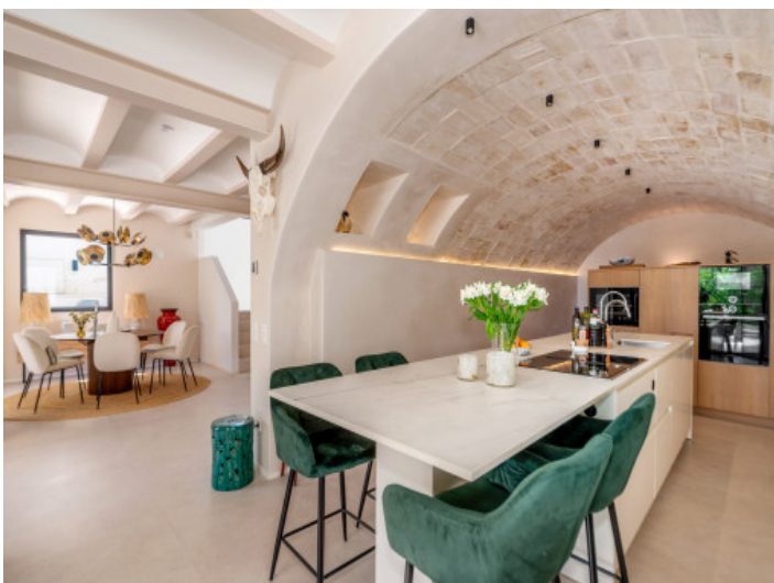
Kitchen with adjacent dining area

All information is correct to the best of our knowledge. Errors and prior sale excepted. This prospectus is purely for information purposes. Only the notarized deed of sale is legally binding.