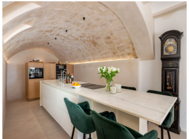
Kitchen with vaulted ceiling