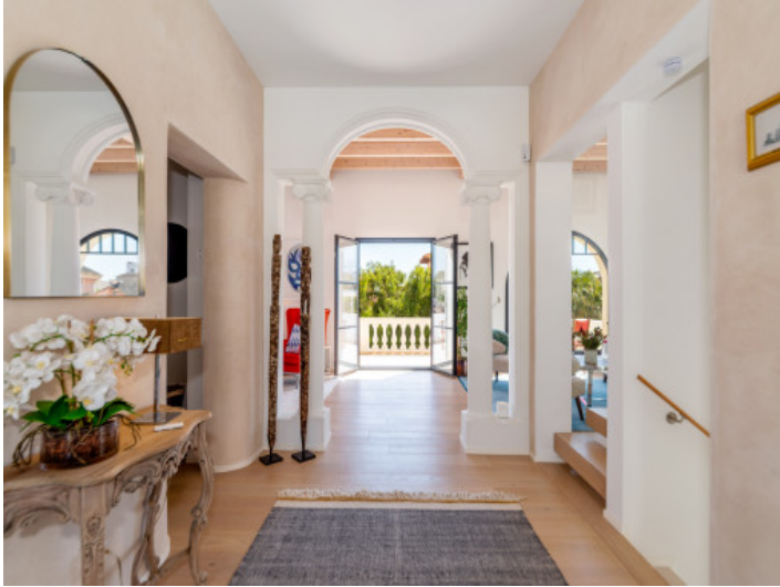
Stylish entrance area