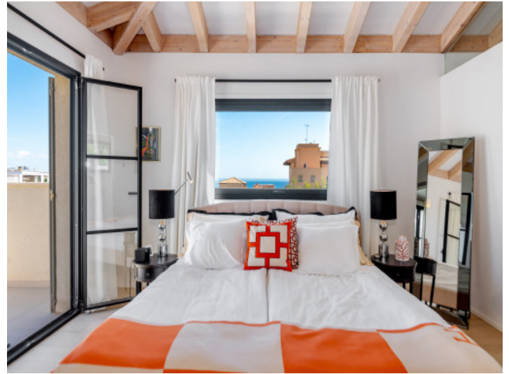
Master bedroom with a view