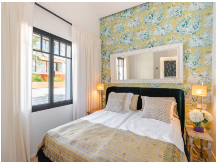
One of four bedrooms