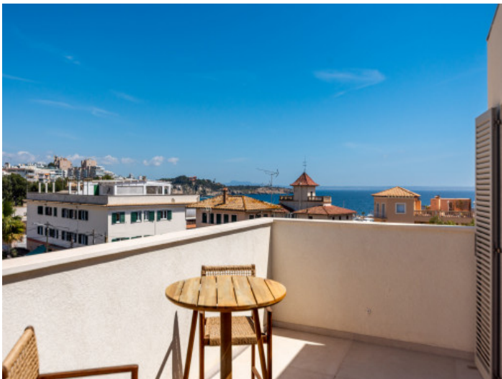
Terrace with sea view