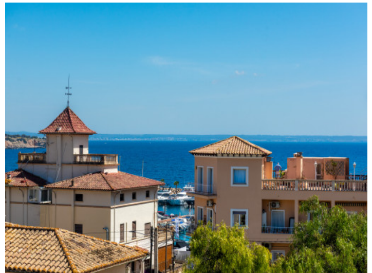
View of the harbor and the sea