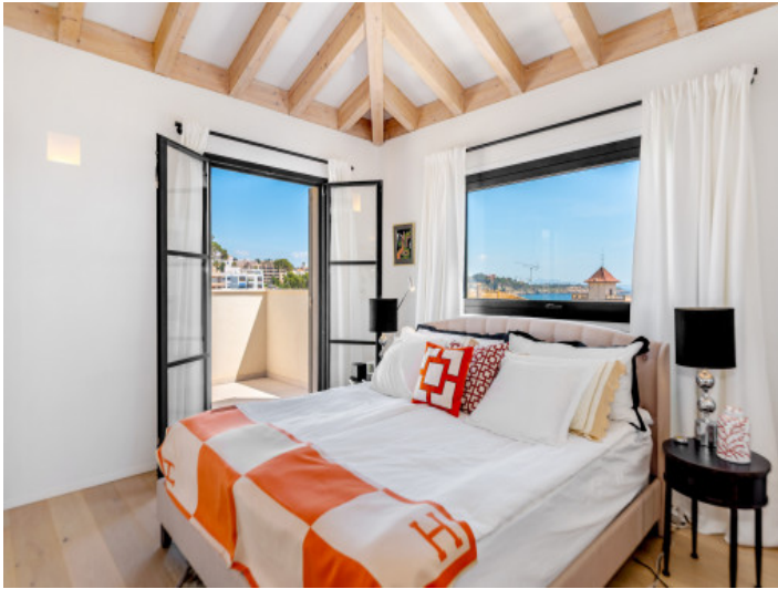
Master bedroom with terrace