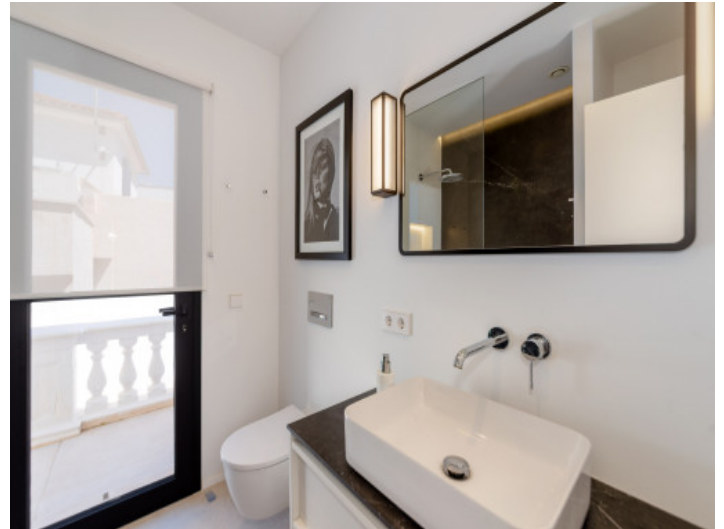
One of three bathrooms