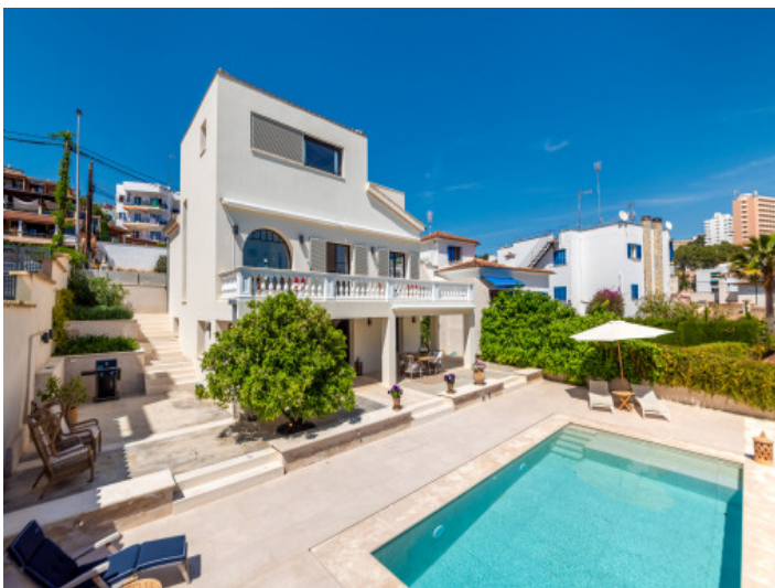
Overall view of the villa