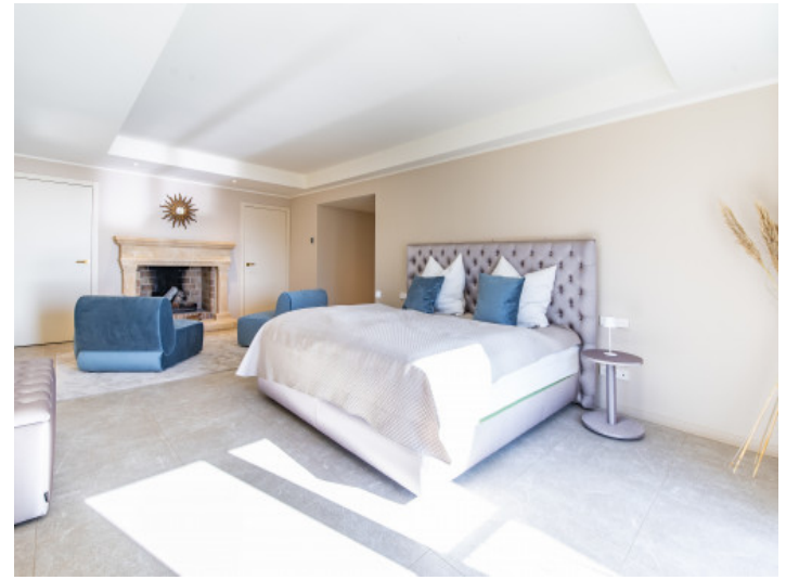
Master bedroom with fireplace