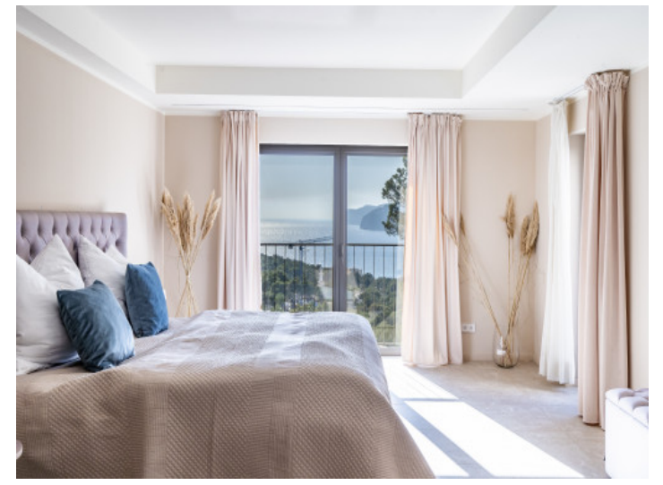
One of five bedrooms

PORTA MALLORQUINA® Your home. Our passion.