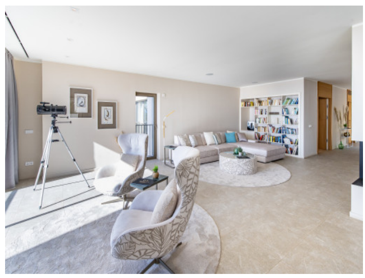
Open living area