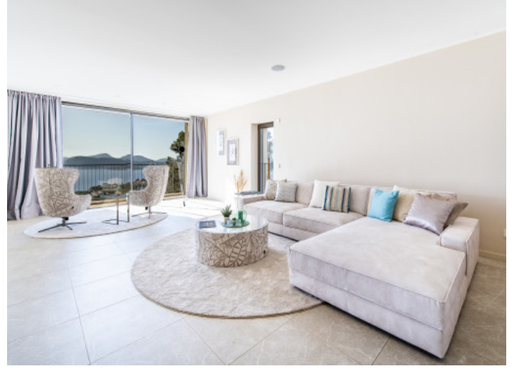
Bright living room with unique view