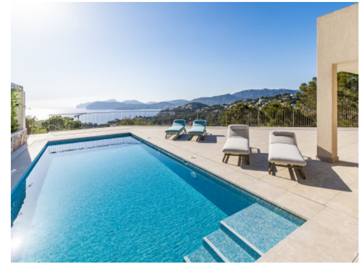
View from the terrace with pool

PORTA MALLORQUINA® Your home. Our passion.