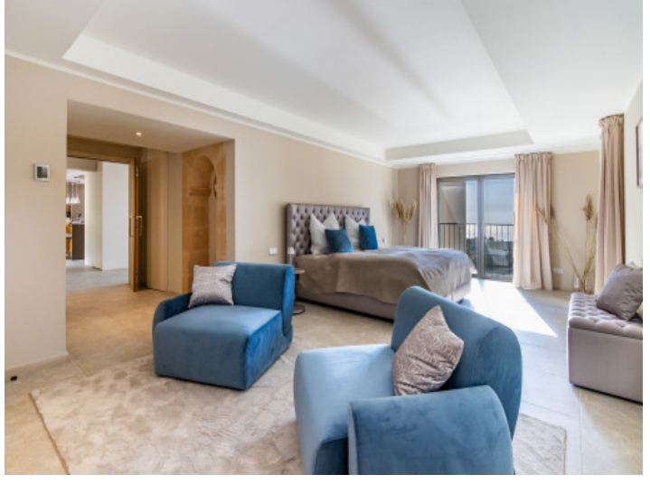
Master bedroom with sea view