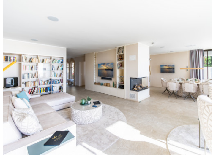
Living area with adjacent dining room Custom-made kitchen All information is correct to the best of our knowledge. Errors and prior sale excepted. This prospectus is purely for information purposes. Only the notarized deed of sale is legally binding.

PORTA MALLORQUINA • THERESIENSTR.: 81, 80333 MUNICH TEL. +34 971 698 242 • INFO@PORTAMALLORQUINA.COM