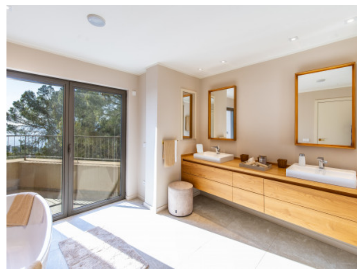
One of six bathrooms