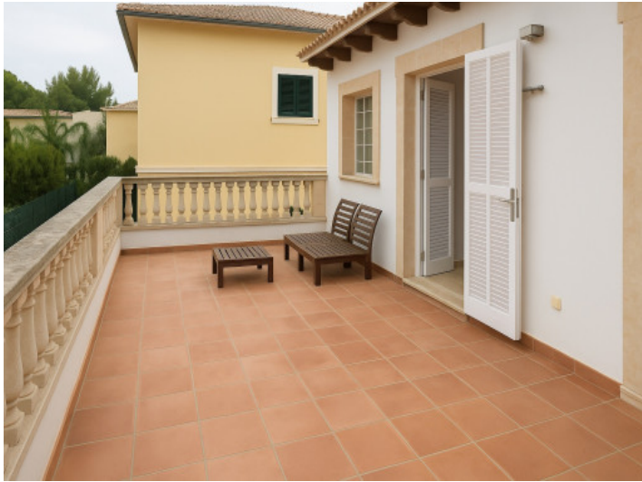
Rear upper floor terrace – ideal for privacy and relaxation