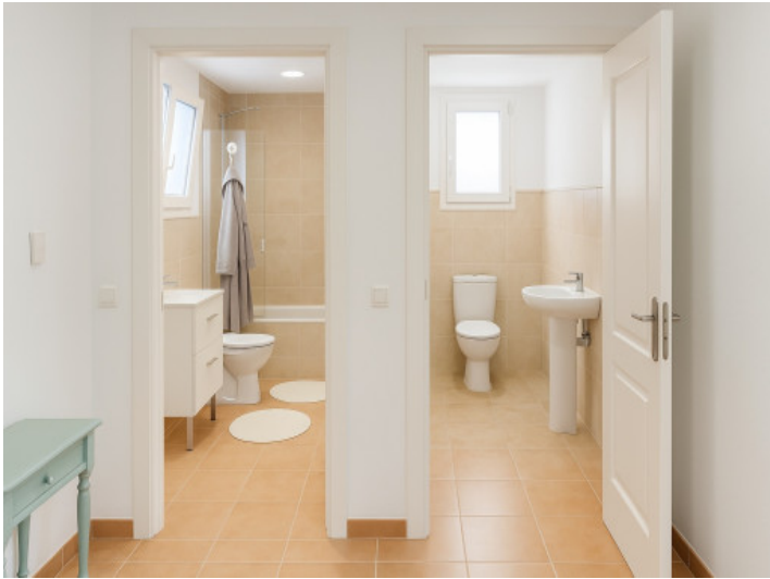
En-suite bathroom on the left & separate guest WC on the right – smart