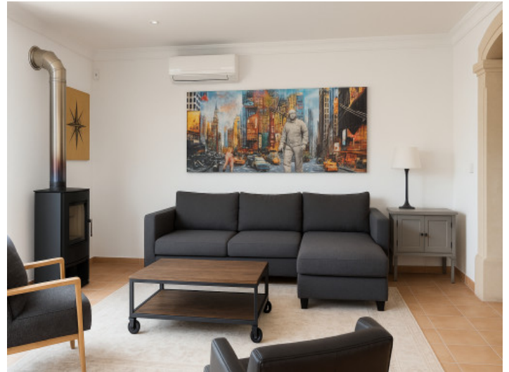
Stylish living room with wood-burning stove and air conditioning