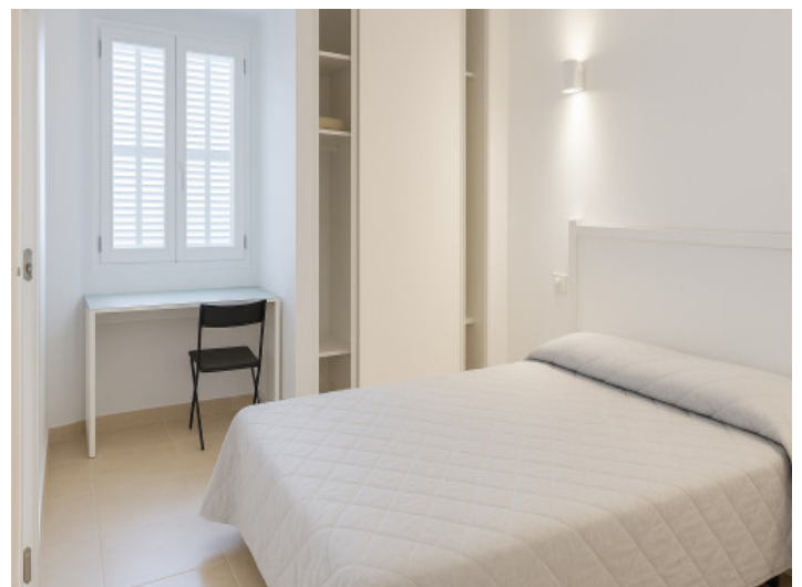
Ground floor master bedroom with built-in wardrobe and desk

All information is correct to the best of our knowledge. Errors and prior sale excepted. This prospectus is purely for information purposes only. The realized appearance is not legally binding.