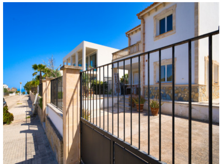
Gated property with sea view in a quiet residential area