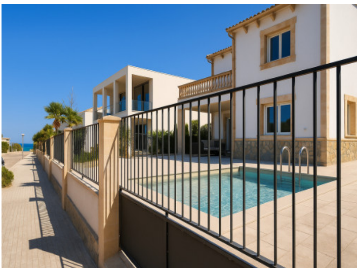
Photomontage of the future pool with sea view – prime location living