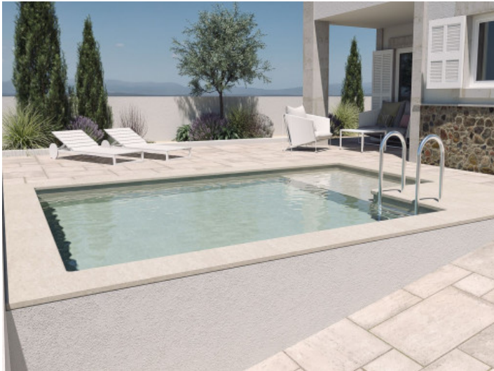
Rendered image of the planned swimming pool – your future relaxation