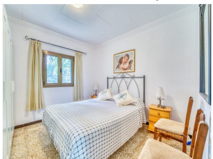
Second double bedroom