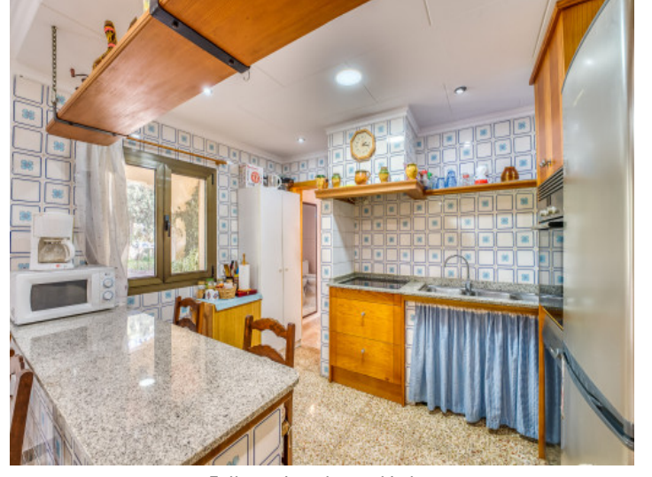
Fully equipped open kitchen

All information is correct to the best of our knowledge. Errors and prior sale excepted. This prospectus is purely for information purposes. Only the notarized deed of sale is legally binding.