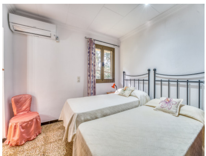
Master bedroom with air conditioning