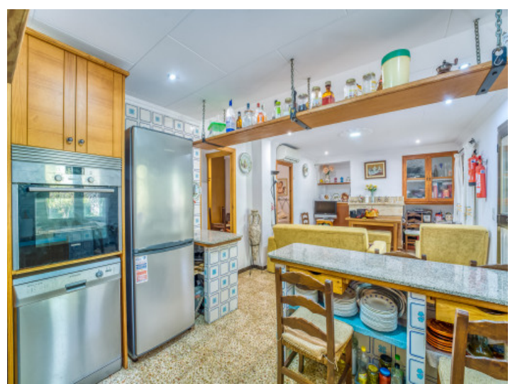
View from the kitchen into the living area