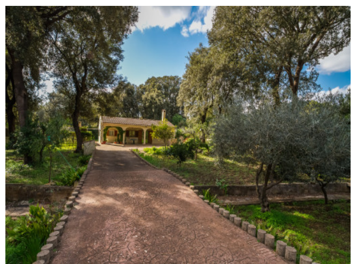
Car access to the holiday home