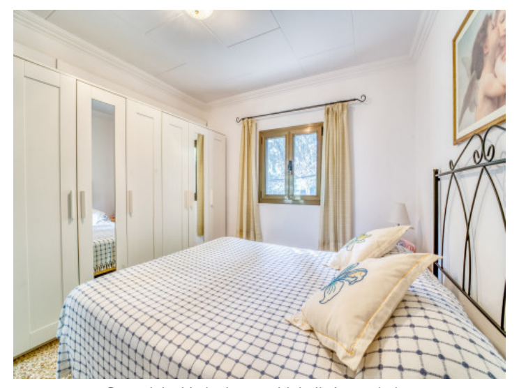
Second double bedroom with built-in wardrobes