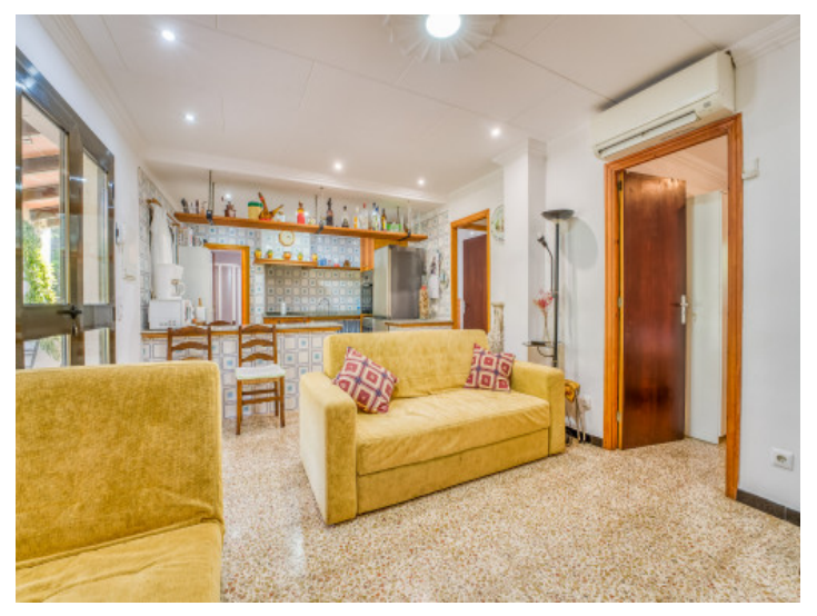
Open living area to the kitchen