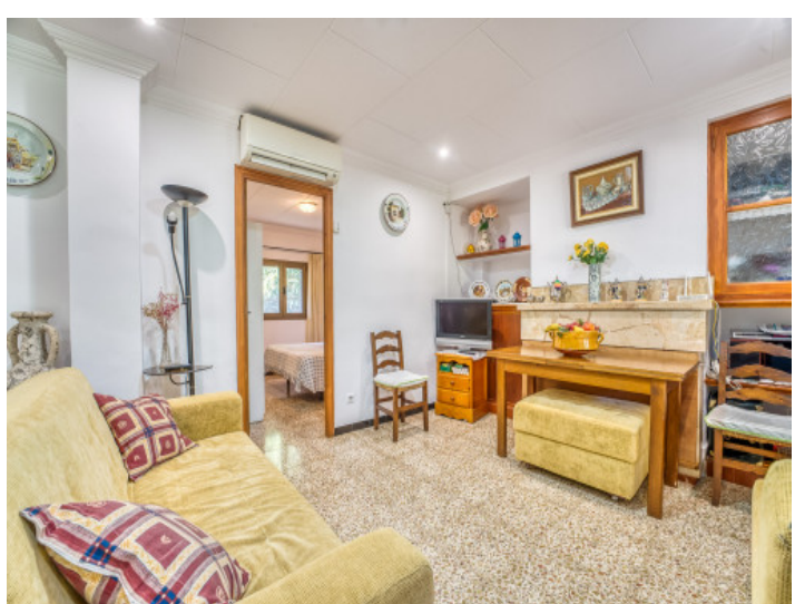
Living room with access to the sleeping areas