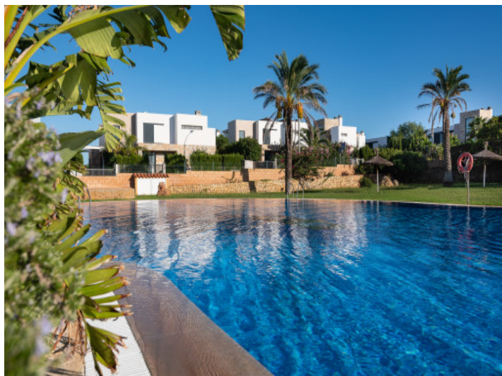
Mediterranean oasis of well-being-charming villa with private garden and