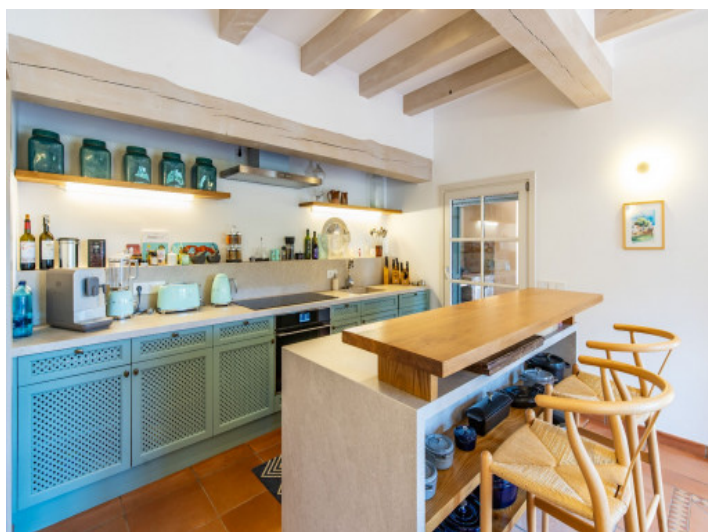
Country style kitchen