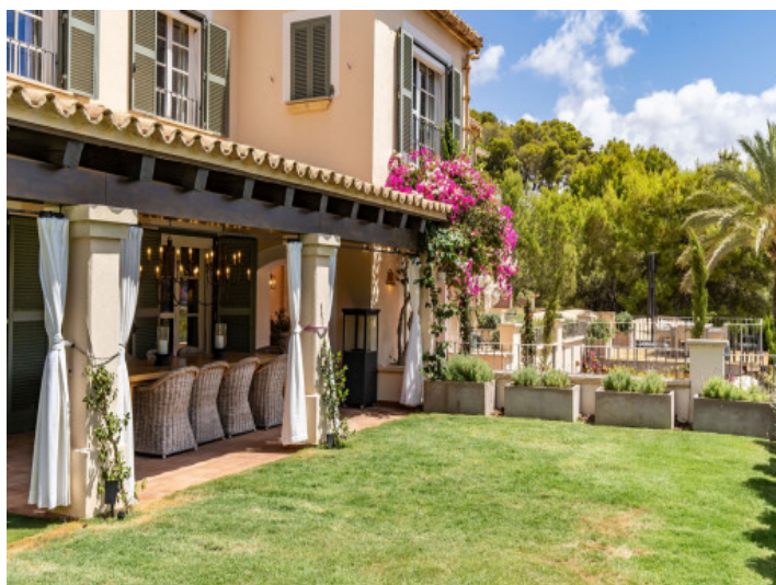
Villa in top location