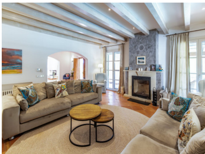
Elegant living area with fireplace