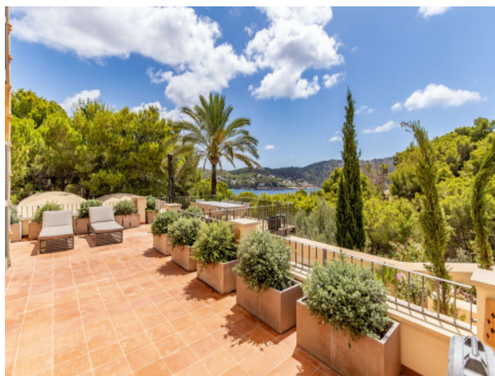
Terrace with sea view