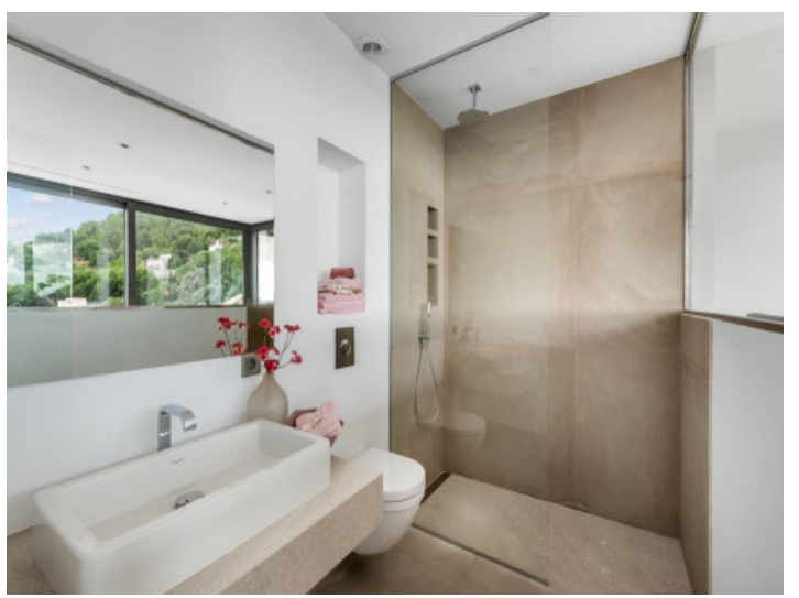
Modern bathroom Elegant bathrooms All information is correct to the best of our knowledge. Errors and prior sale excepted. This prospectus is purely for information purposes. Only the notarized deed of sale is legally binding.