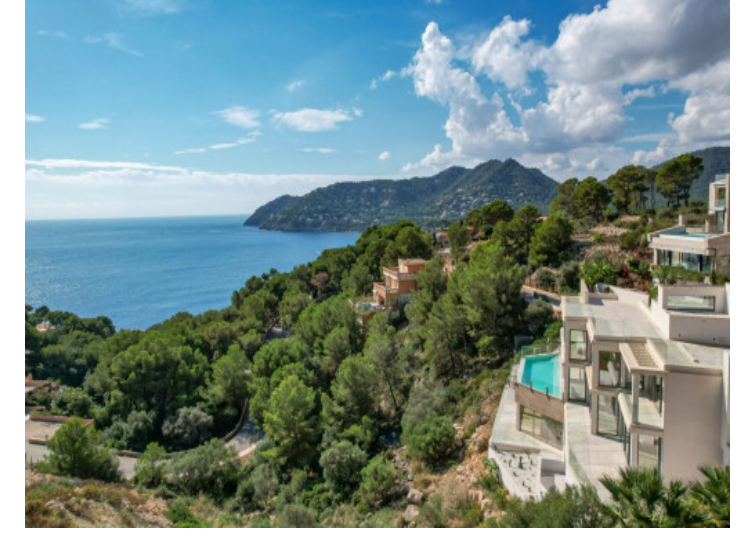
Fantastic sea view