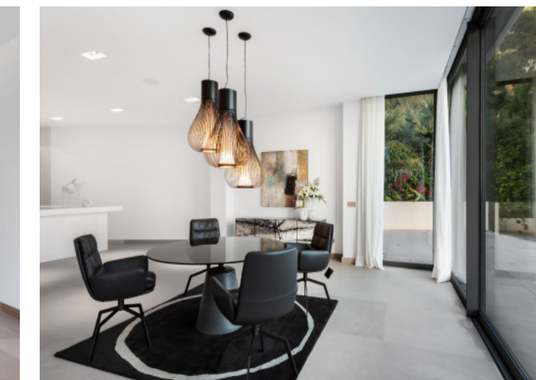
Dining area Light-flooded property All information is correct to the best of our knowledge. Errors and prior sale excepted. This prospectus is purely for information purposes. Only the notarized deed of sale is legally binding.

PORTA MALLORQUINA • THERESIENSTR.: 81, 80333 MUNICH TEL. +34 971 698 242 • INFO@PORTAMALLORQUINA.COM