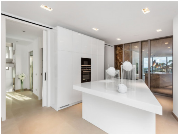
Large kitchen island