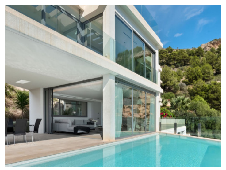
Living area close to the pool