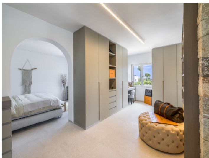
Bedroom with walk-in wardrobe