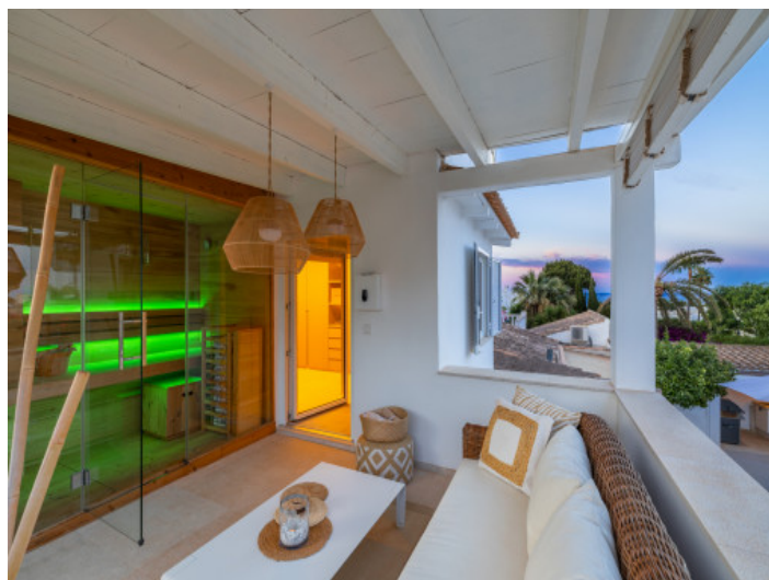
Sauna with sea views

All information is correct to the best of our knowledge. Errors and prior sale excepted. This prospectus is purely for information purposes. Only the notarized deed of sale is legally binding.