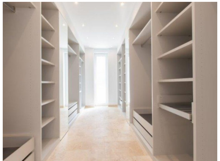
Large walk-in wardrobe

All information is correct to the best of our knowledge. Errors and prior sale excepted. This prospectus is purely for information purposes. Only the notarized deed of sale is legally binding.