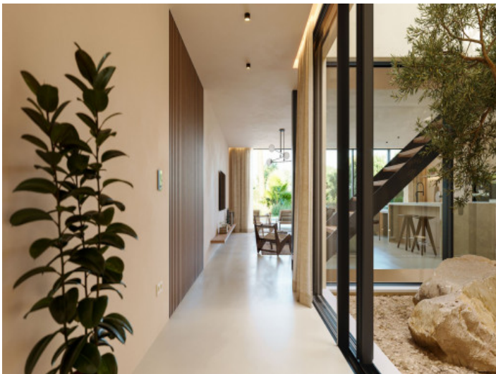
Light flooded modern villa