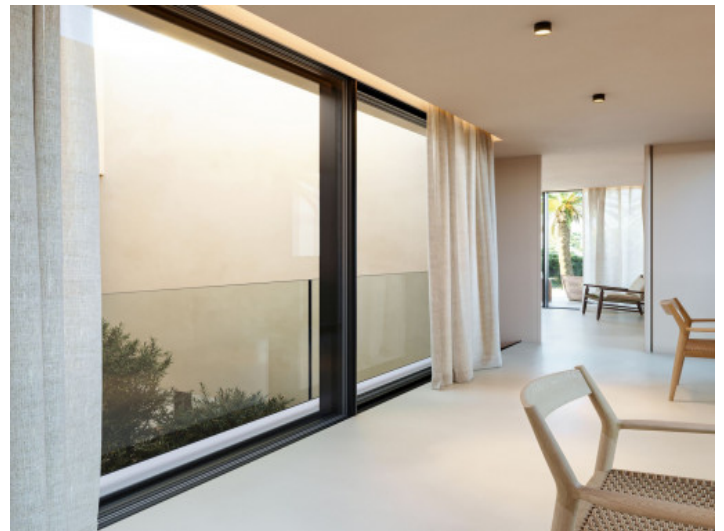
Large window fronts