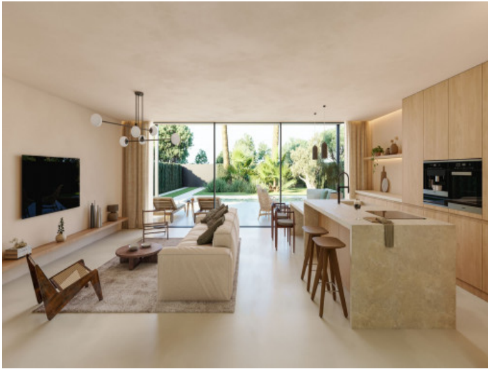
Open plan design