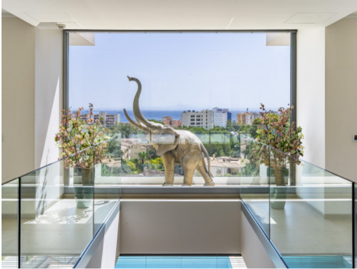
View from main floor