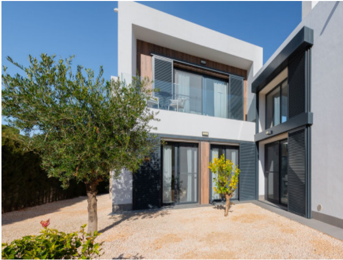
Modern designed villa