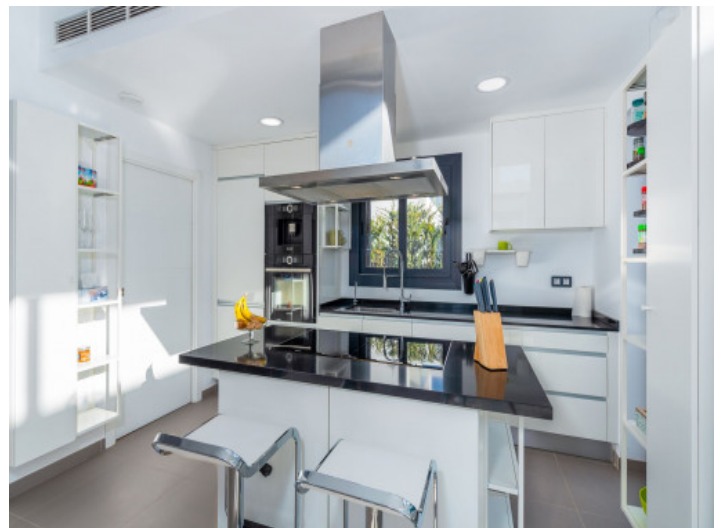
Modern American kitchen

All information is correct to the best of our knowledge. Errors and prior sale excepted. This prospectus is purely for information purposes. Only the notarized deed of sale is legally binding.