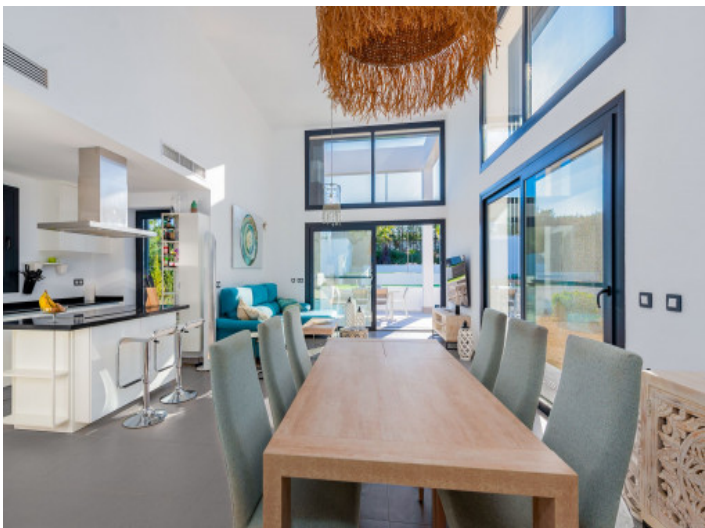
Open, modern living concept