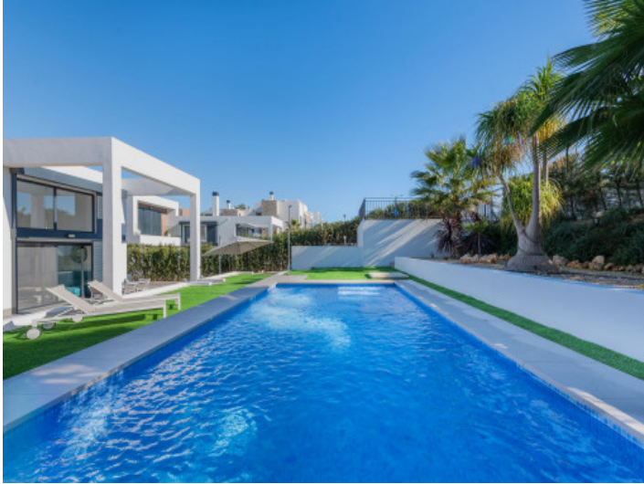
Large pool with sun terrace