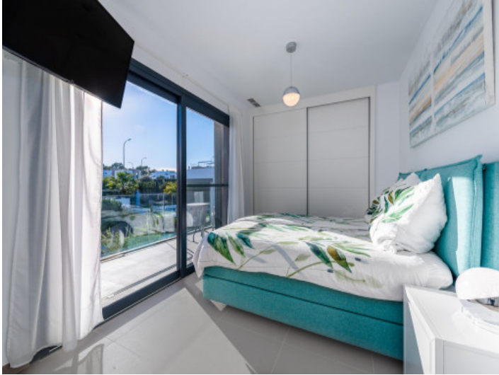
Bedroom on the upper floor