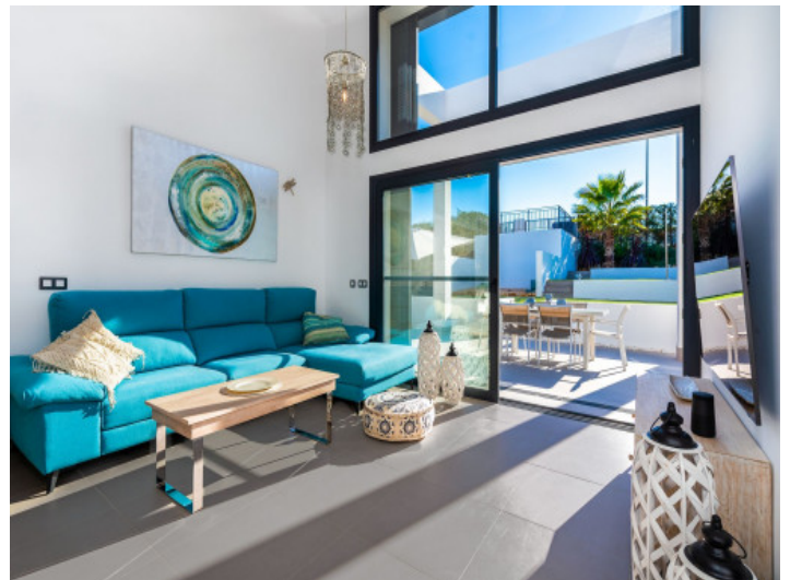
Living area with large window facade