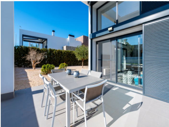
Ample sun terrace