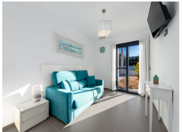
Bedroom with terrace access

All information is correct to the best of our knowledge. Errors and prior sale excepted. This prospectus is purely for information purposes. Only the notarized deed of sale is legally binding.