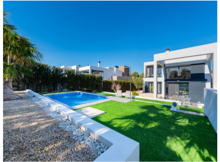
Pool and outdoor area