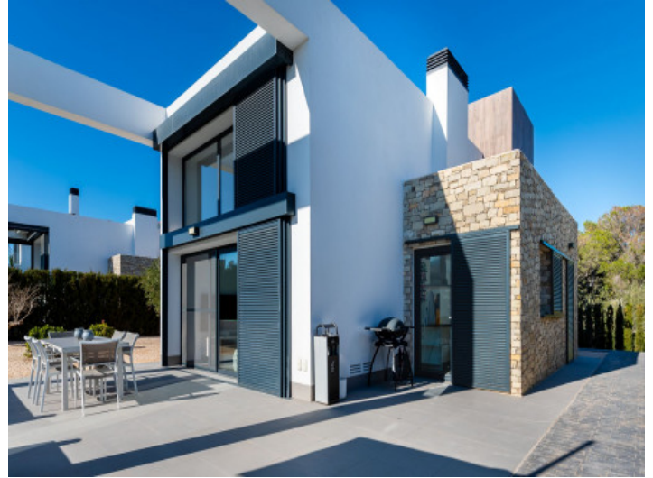
Exterior view and terrace