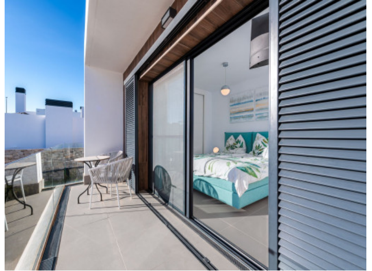
Sunny balcony of the bedroom