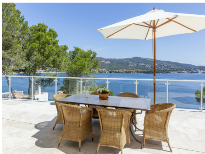
Sunny terrace with outdoor dining area