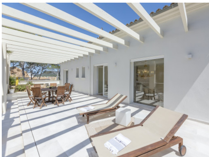
Additional terrace with sun loungers