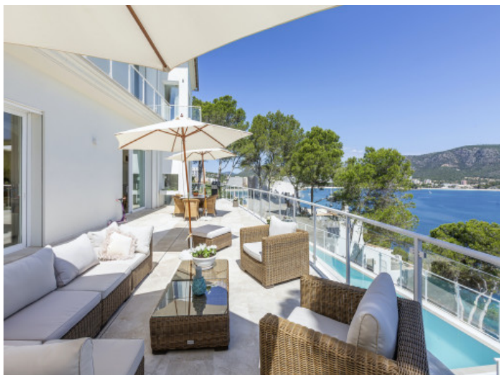
Mediterranean villa in first sea line nearby Palmanova