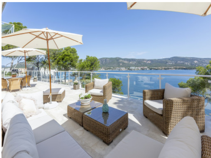
Additional view of the terrace