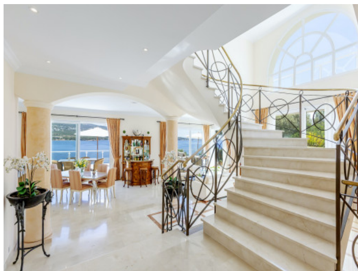
Elegant dining area and staircase

All information is correct to the best of our knowledge. Errors and prior sale excepted. This prospectus is purely for information purposes. Only the notarized deed of sale is legally binding.