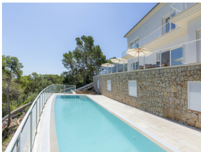
Fantastic pool area