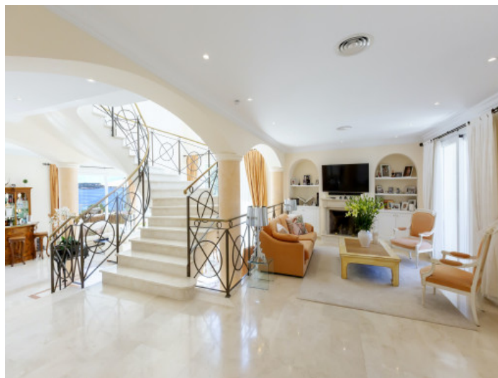
Additional living area