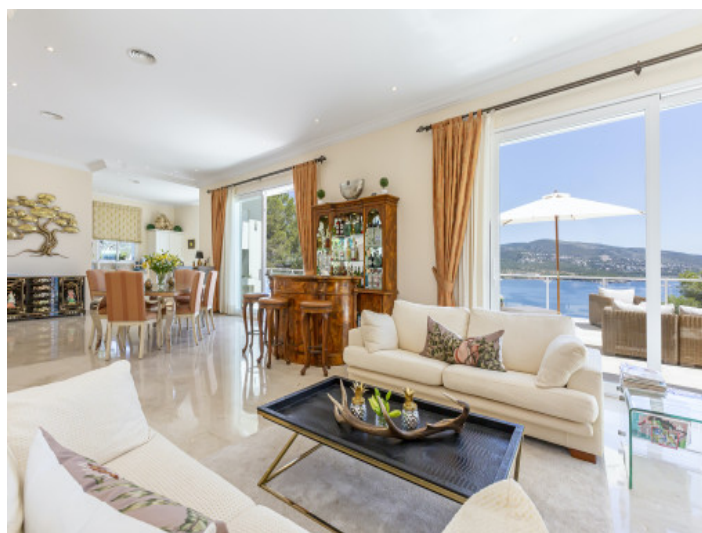
Open plan living area