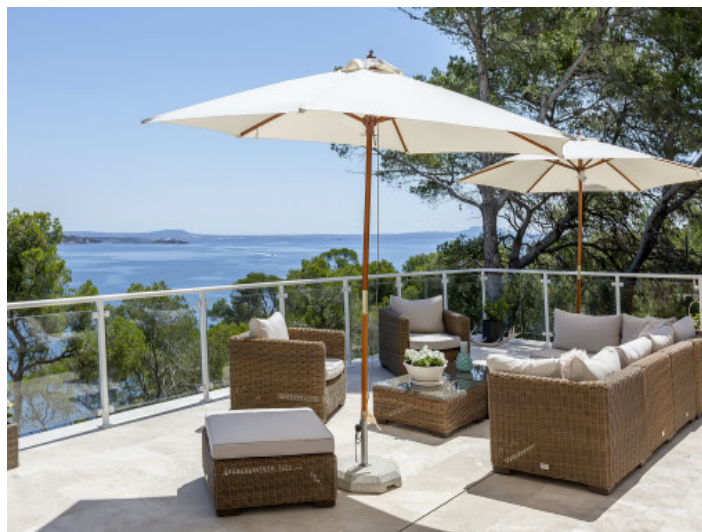
Sunny terrace with lounge