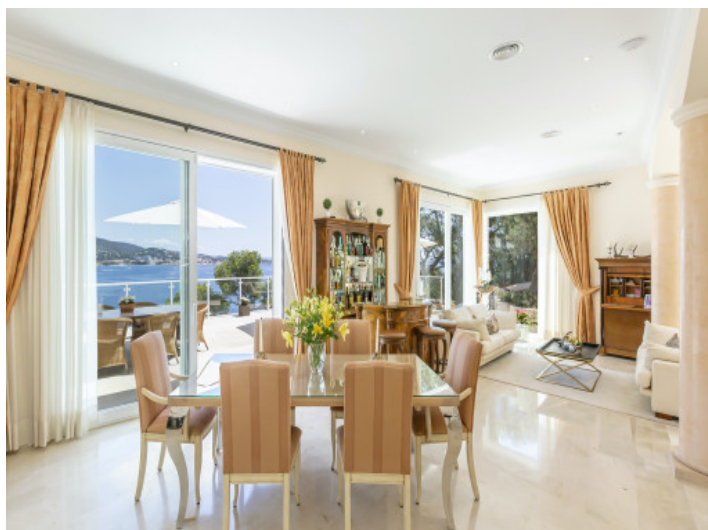
Dining area with sea views