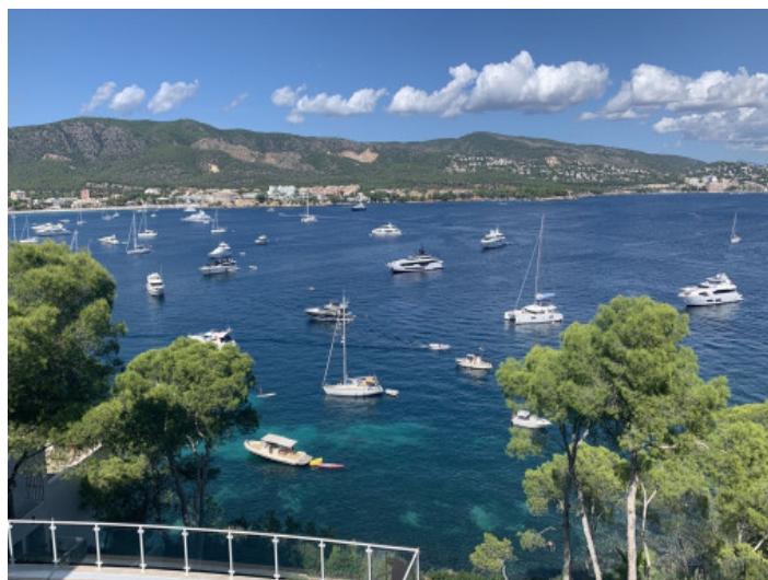
Superb sea and mountain views

All information is correct to the best of our knowledge. Errors and prior sale excepted. This prospectus is purely for information purposes. Only the notarized deed of sale is legally binding.