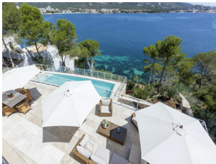
Pool area with breathtaking sea views