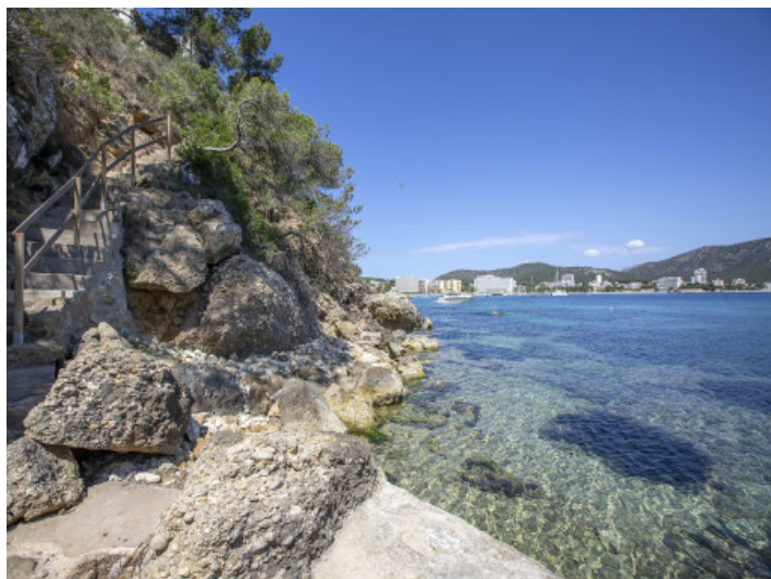
Direct sea access