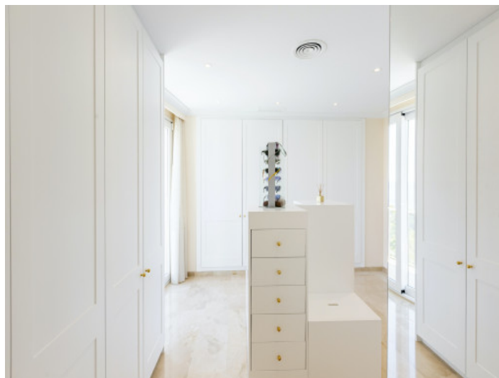
Beautiful dressing room