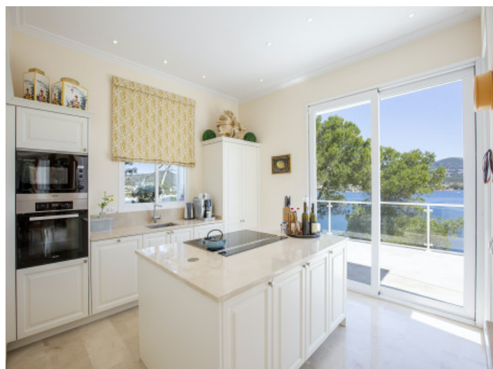
Modern kitchen with island