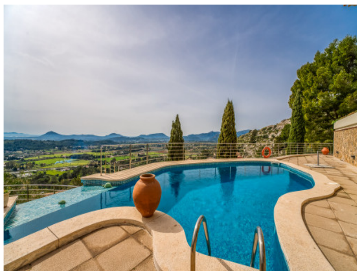
Pool with amazing views