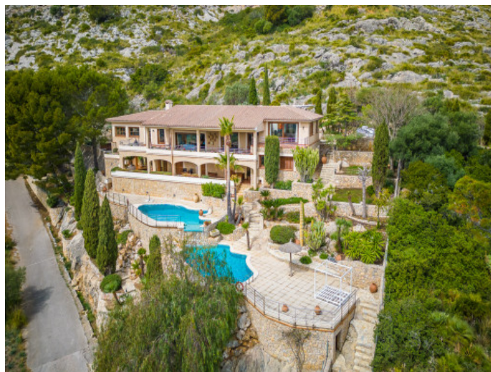
View of the villa