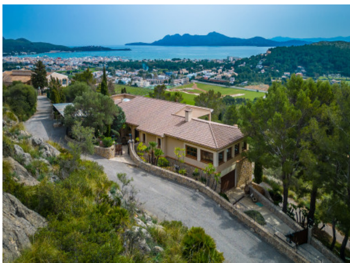
Stunning sea views