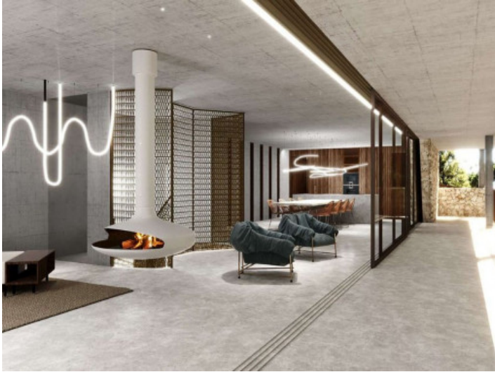
Villa with 4 bedrooms and 4 bathrooms