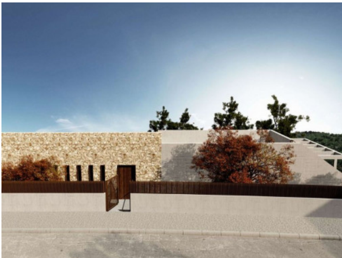
Render of the facade