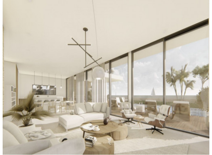
Living area with sea views