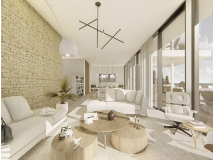
Stylish living area