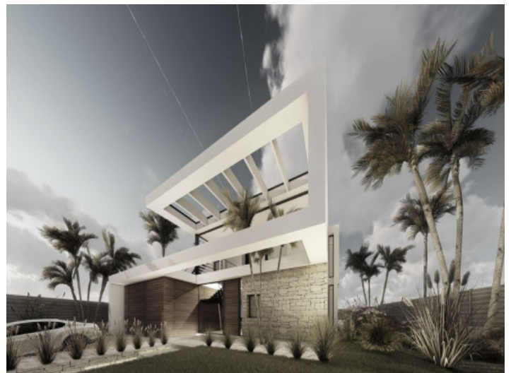
Entrance and garden

All information is correct to the best of our knowledge. Errors and prior sale excepted. This prospectus is purely for information purposes. Only the notarized deed of sale is legally binding.