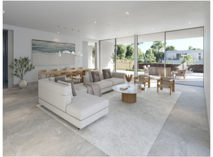
Modern living area