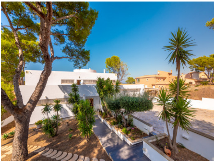
Front views from the villa