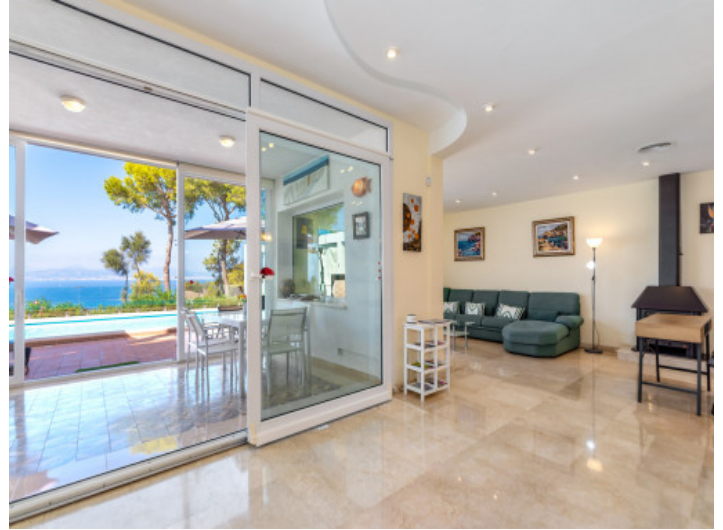
Terrace access from the living area