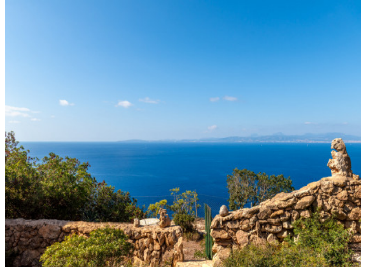
Gorgeous sea views