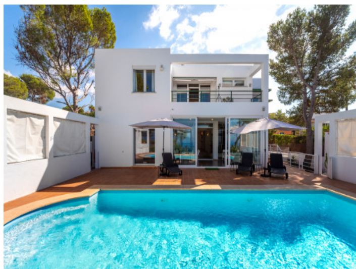
Villa with two levels and pool