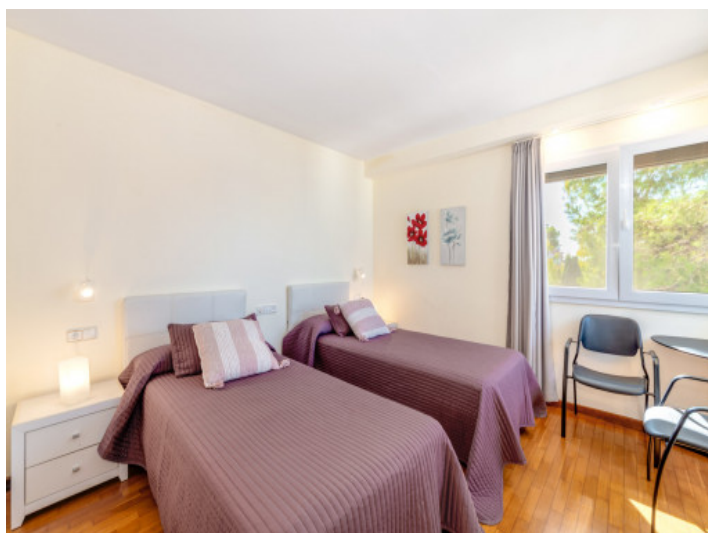
Bedroom with two single beds