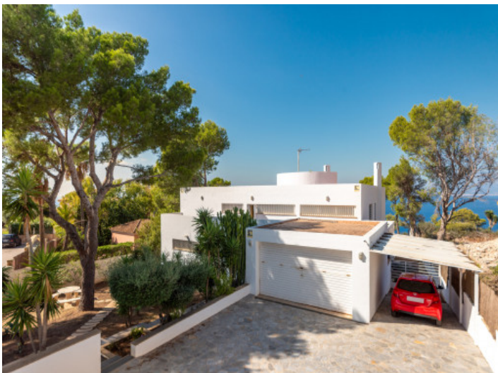
Garage and covered parking space