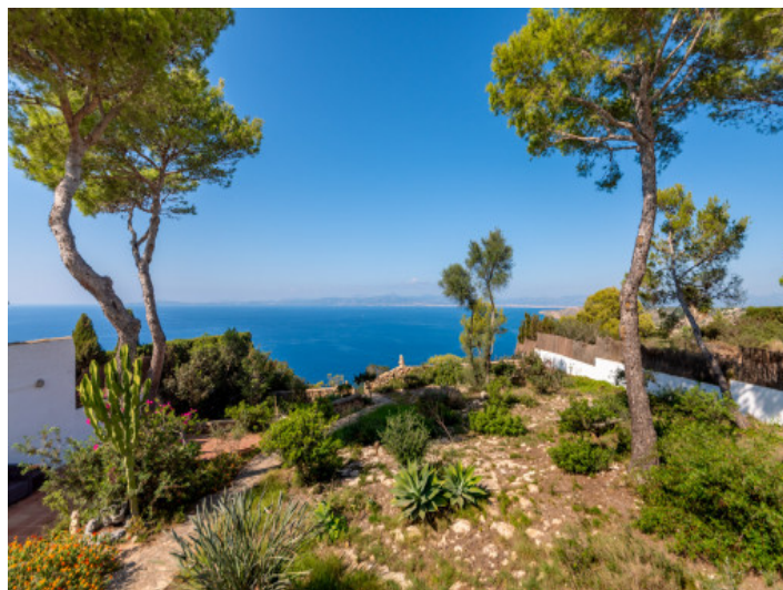
First sea line villa