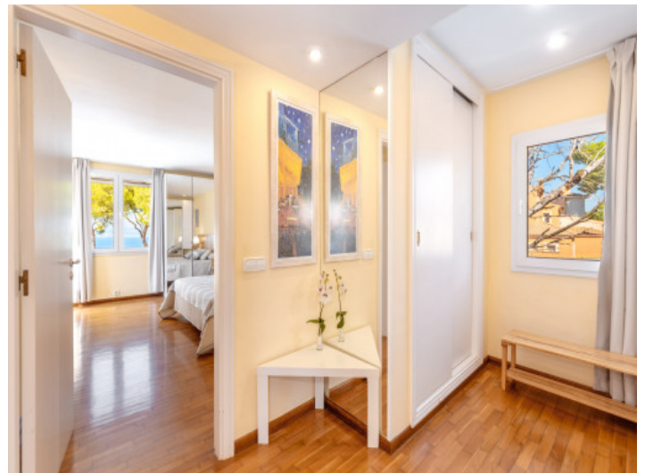
Bedroom with mediterranean sea views