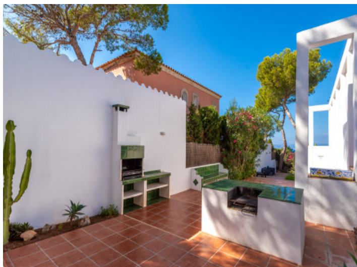
Patio with barbecue area