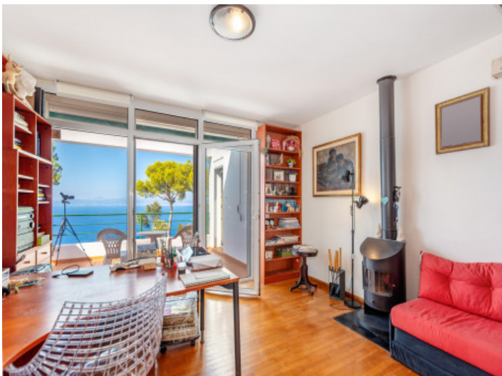
Office with fireplace