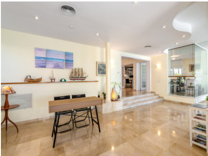
Living area with views to the dining area