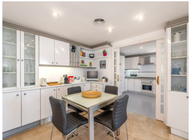
Kitchen is separated in two rooms