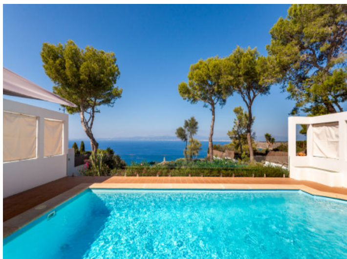
Pool area is surrounded by a terrace