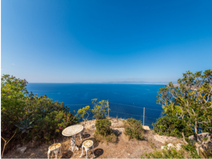
Terrace with views to the bay of Palma