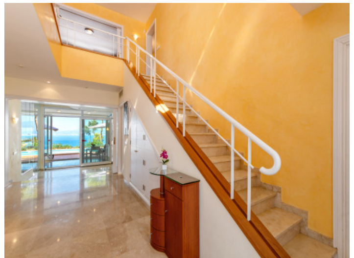
Corridor with staircase

All information is correct to the best of our knowledge. Errors and prior sale excepted. This prospectus is purely for information purposes. Only the notarized deed of sale is legally binding.