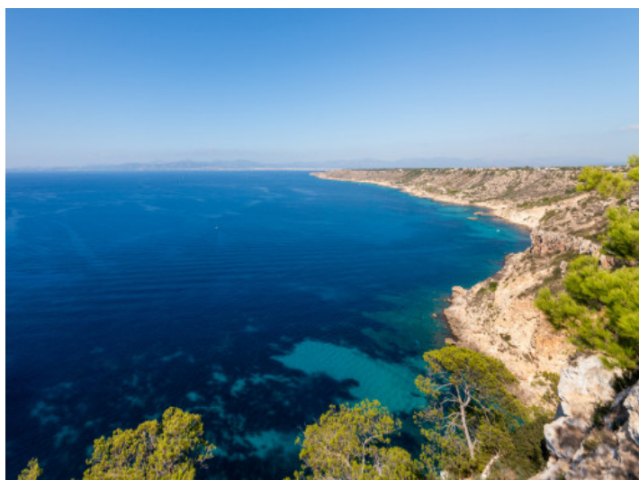
Unique sea views