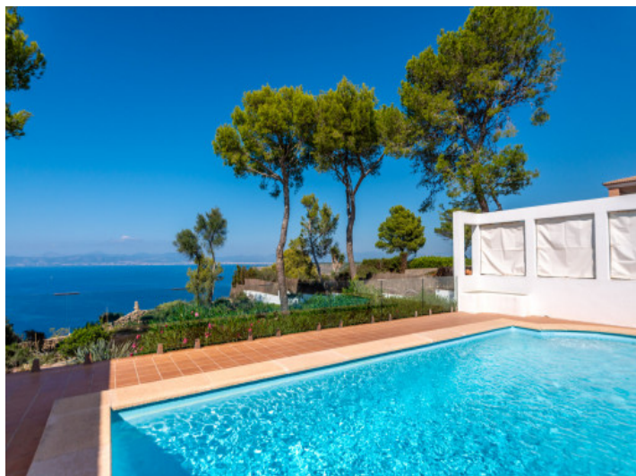
Pool and sea views