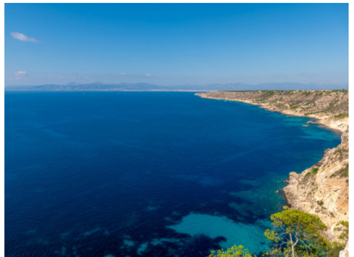
Sea views over the mediterranean sea

All information is correct to the best of our knowledge. Errors and prior sale excepted. This prospectus is purely for information purposes. Only the notarized deed of sale is legally binding.