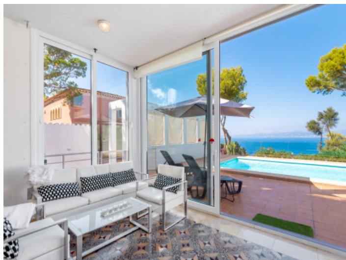
Wintergarden with pool views

All information is correct to the best of our knowledge. Errors and prior sale excepted. This prospectus is purely for information purposes. Only the notarized deed of sale is legally binding.