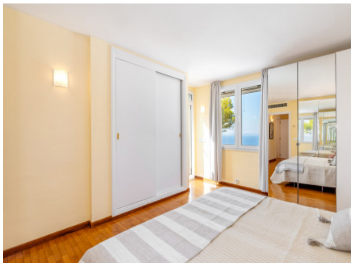
Bedroom with built-in wardrobe