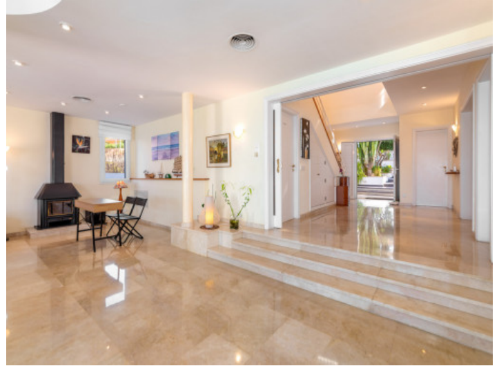
Living area with views to the entrance