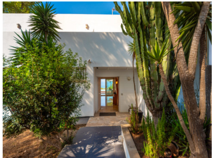
Entrance to the villa