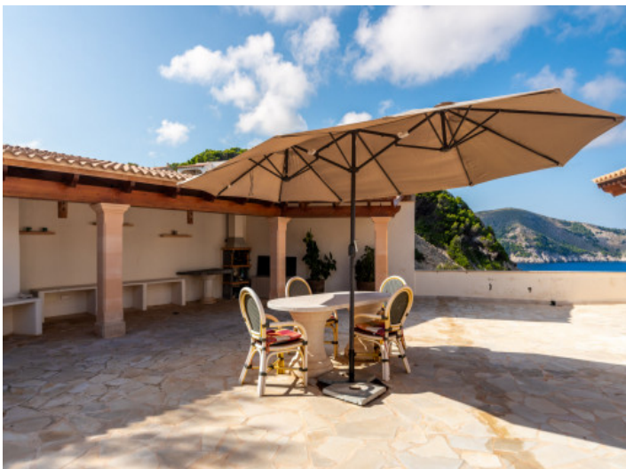
Terrace with outdoor kitchen