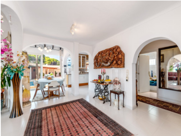
Open dining area