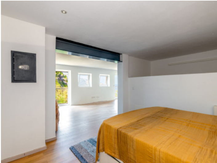
Upper apartment with bedroom