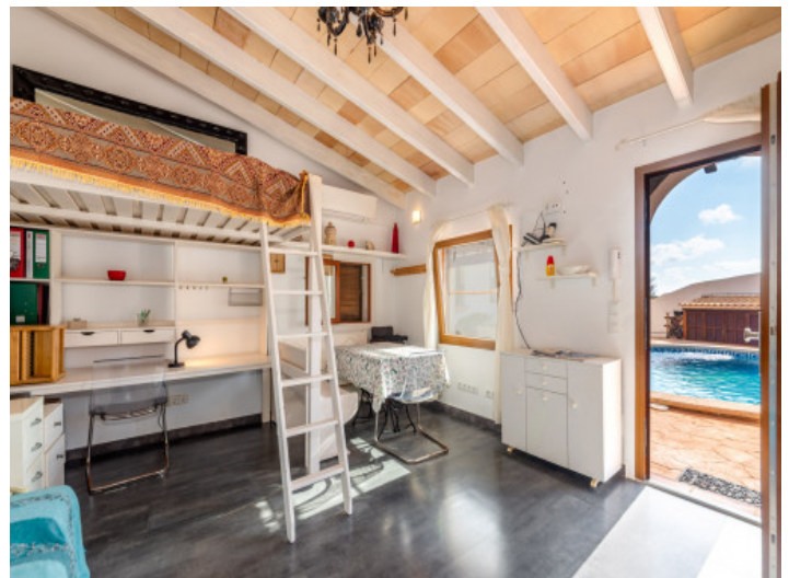
Studio with pool access

All information is correct to the best of our knowledge. Errors and prior sale excepted. This prospectus is purely for information purposes. Only the notarized deed of sale is legally binding.