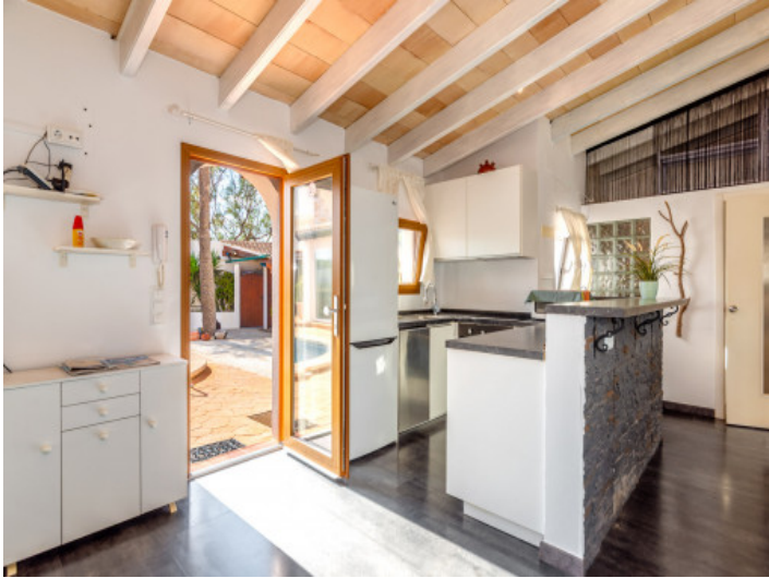
2nd kitchen with bar