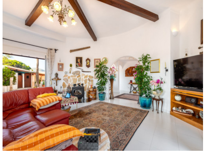
Cosy living area