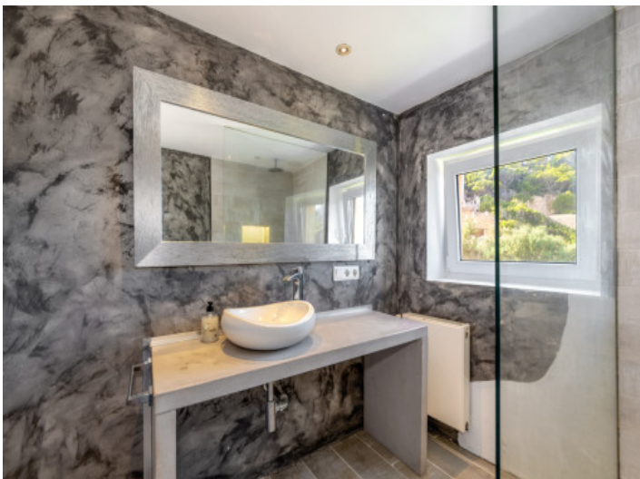
Bathroom with daylight