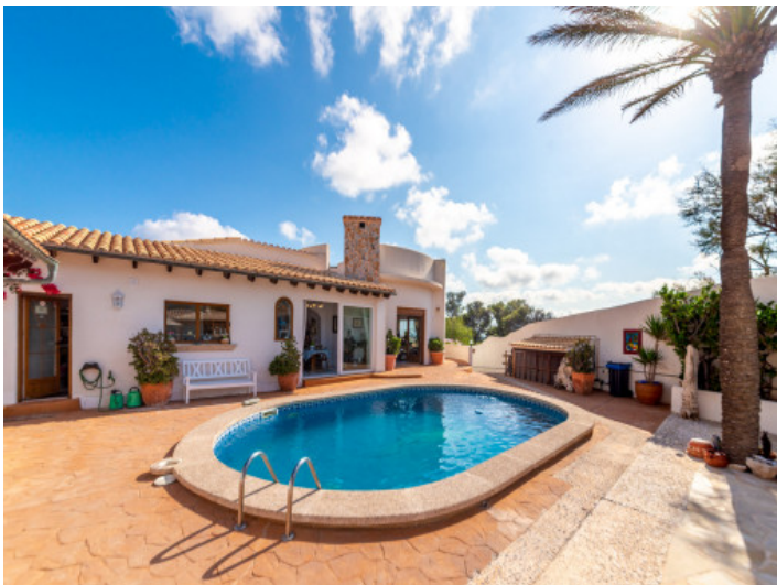
Well-tended pool area