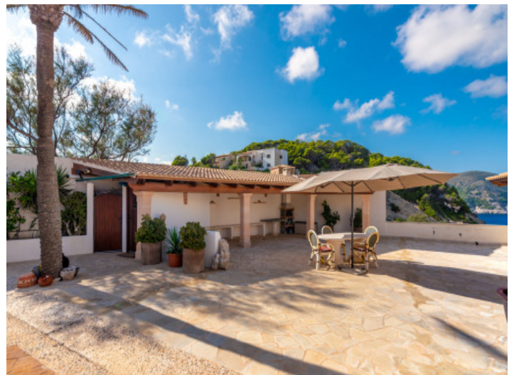
Terrace with mediterranean sea views

All information is correct to the best of our knowledge. Errors and prior sale excepted. This prospectus is purely for information purposes. Only the notarized deed of sale is legally binding.