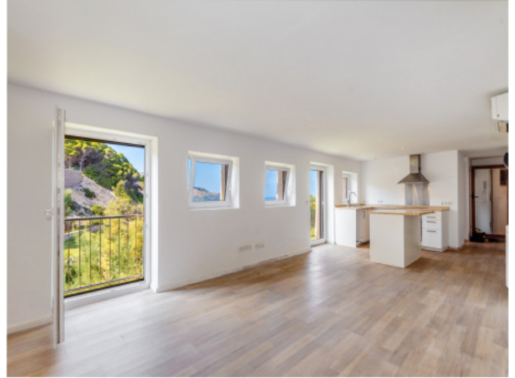
Upper apartment with kitchen