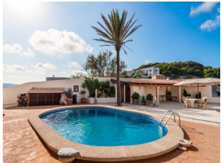
Pool is surrounded by a terrace