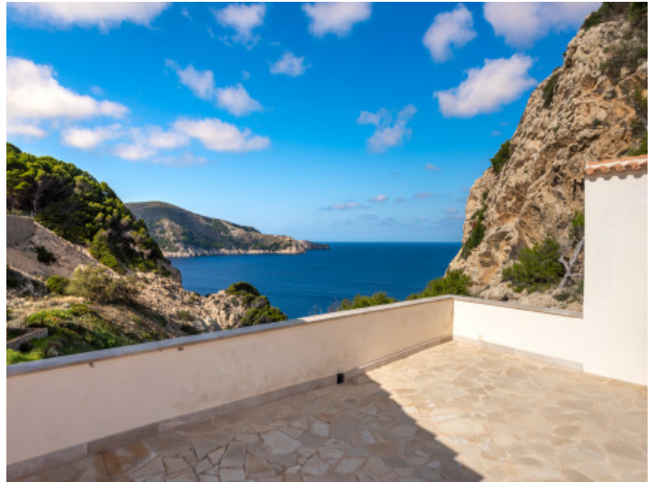
Sea views from the terrace