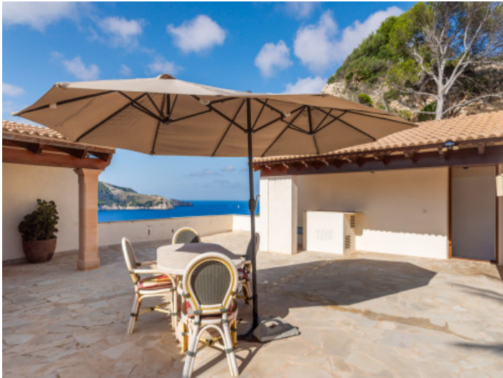
Terrace with sea views