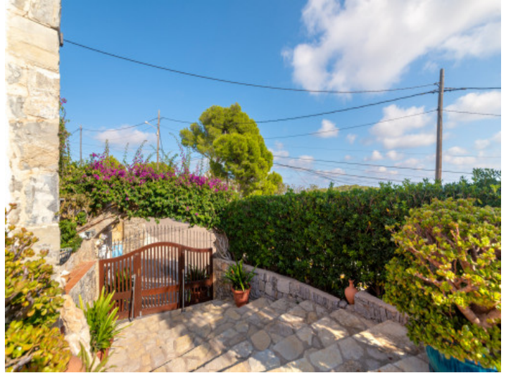
Entrance to the villa