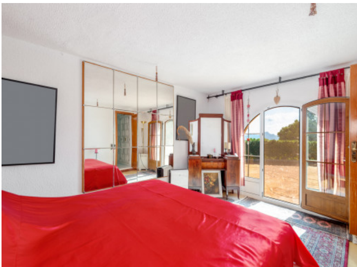
Bedroom with terrace access