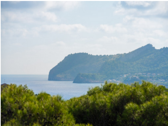
Unique landscape views