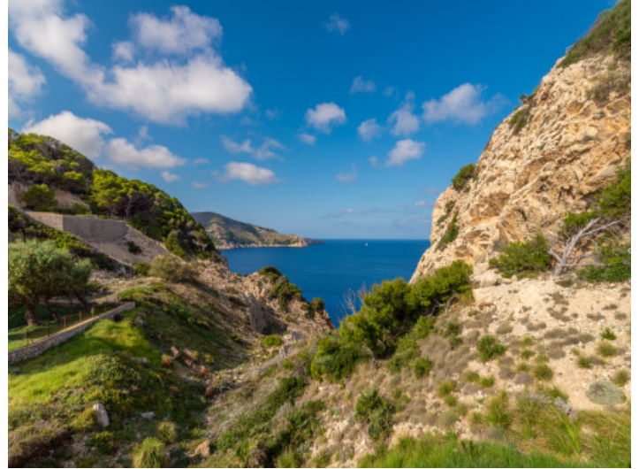
Impressive sea views