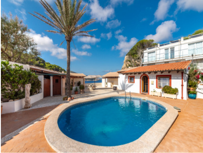
Mediterranean pool area