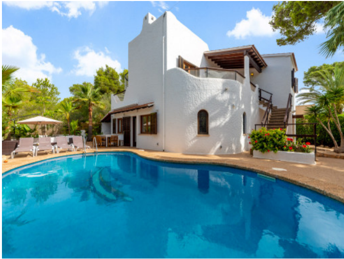
Villa and pool