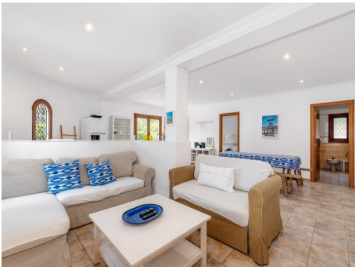
Large living area on the ground floor