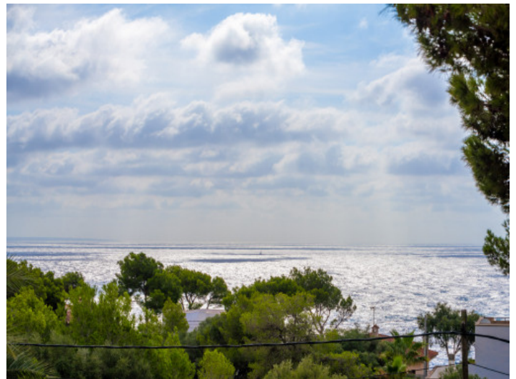
Fantastic sea views