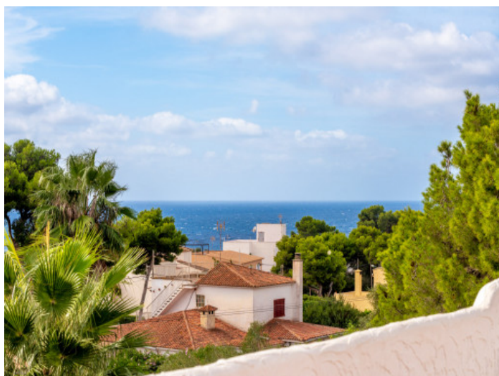
Terrace with sea views