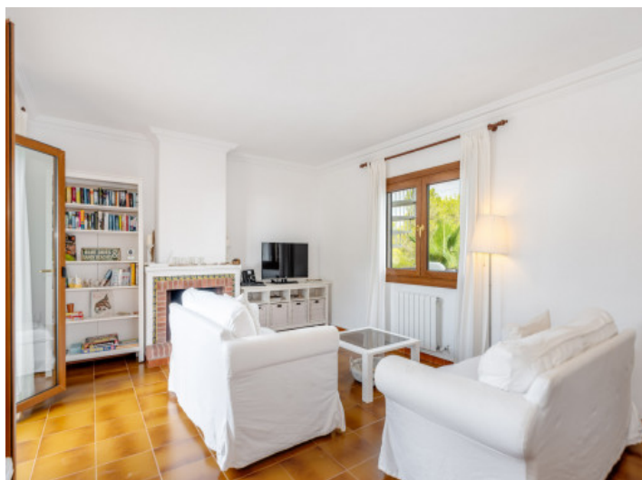
Cosy living area on the upper floor