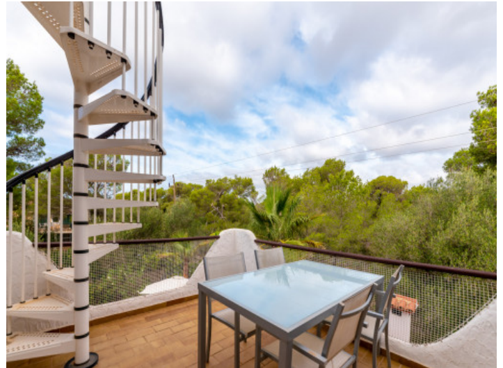
Terrace of the kitchen