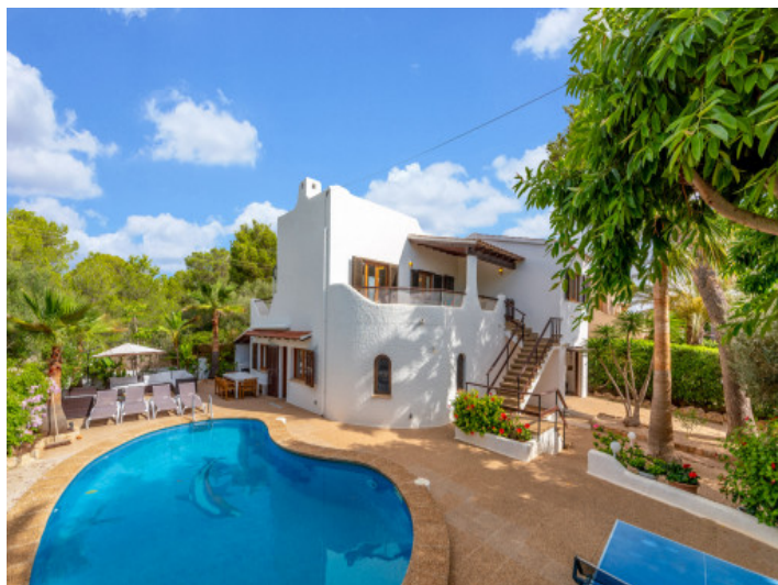
View over the well-tended outdoor area