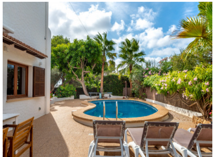
Pool with palm-tree garden

All information is correct to the best of our knowledge. Errors and prior sale excepted. This prospectus is purely for information purposes. Only the notarized deed of sale is legally binding.