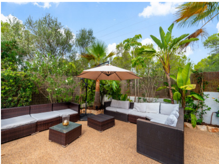
Lovely chill-out area