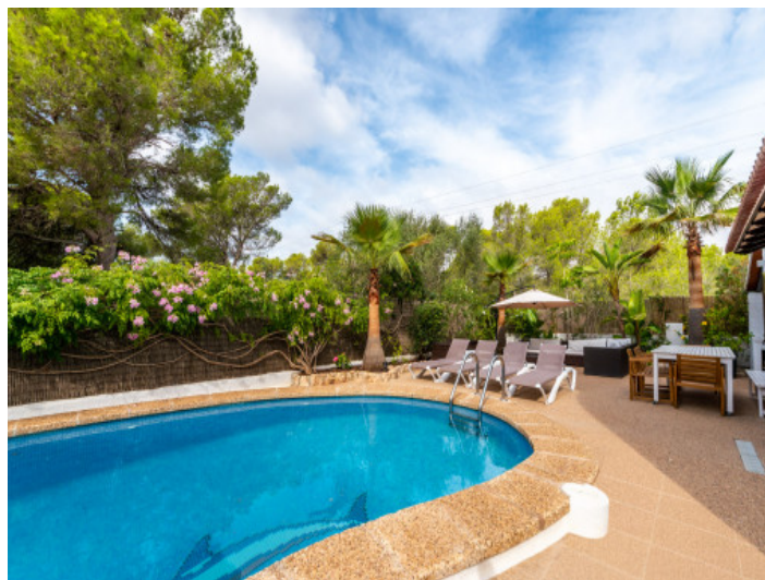
Pool area with privacy