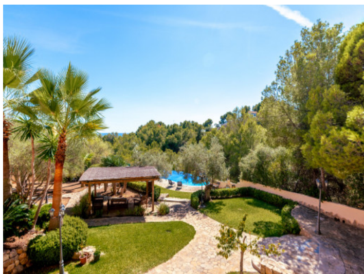
Gorgeous outdoor area