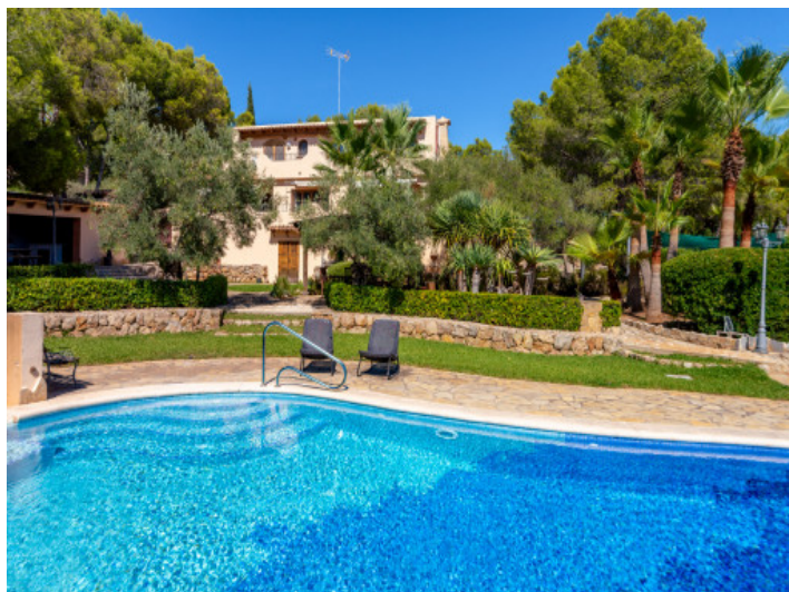
Pool area with views to the finca