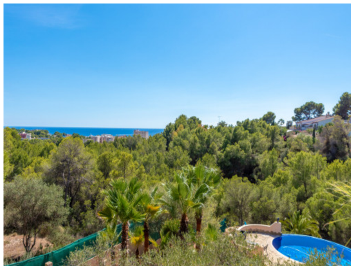
Sea views from the balcony