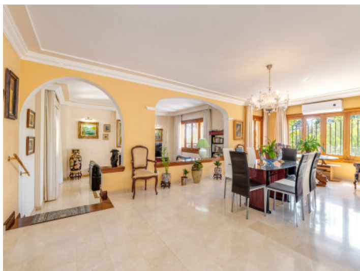
Dining area with views to the living area