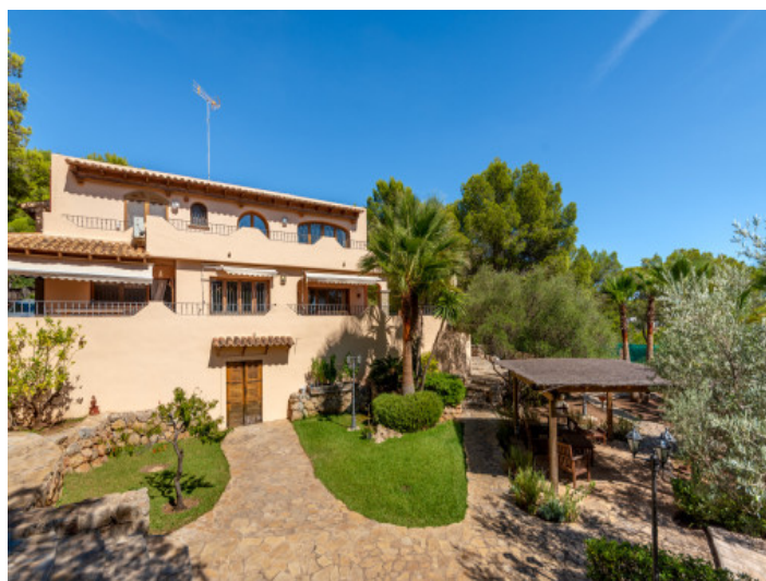
Views from the garden to the finca