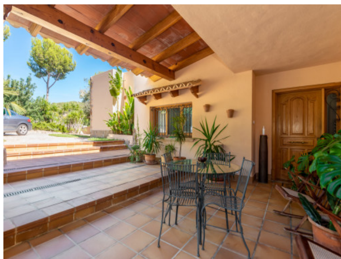
Front terrace from the entrance area