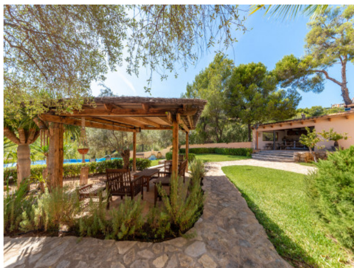
Garden with a covered terrace and pool views