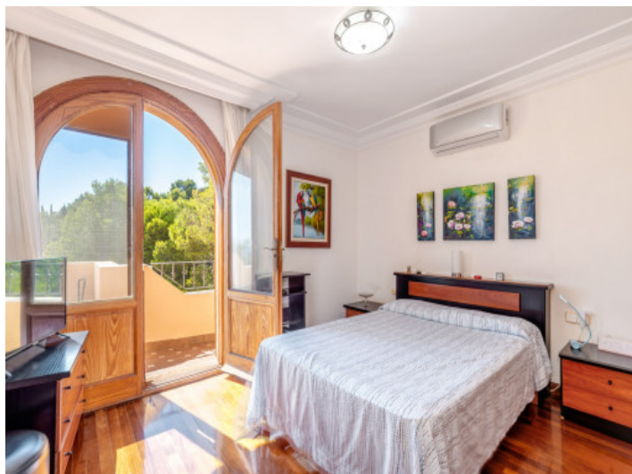
Bedroom with balcony access