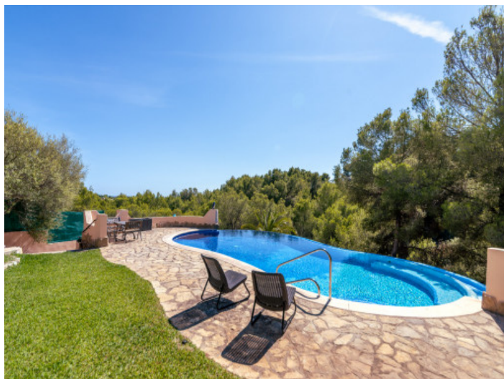
Spacious pool area