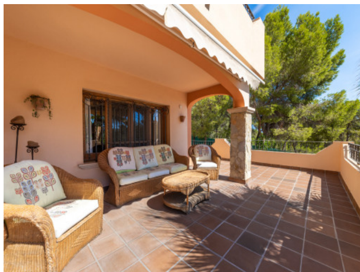
Covered terrace with lounge area

All information is correct to the best of our knowledge. Errors and prior sale excepted. This prospectus is purely for information purposes. Only the notarized deed of sale is legally binding.