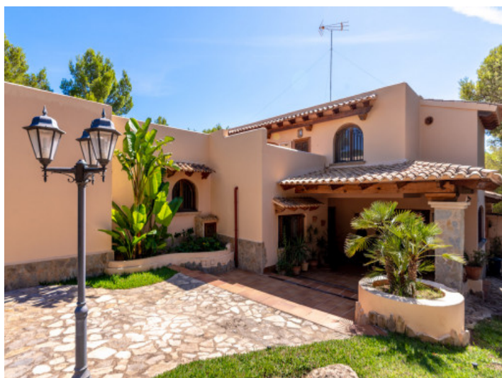
Front views to the finca