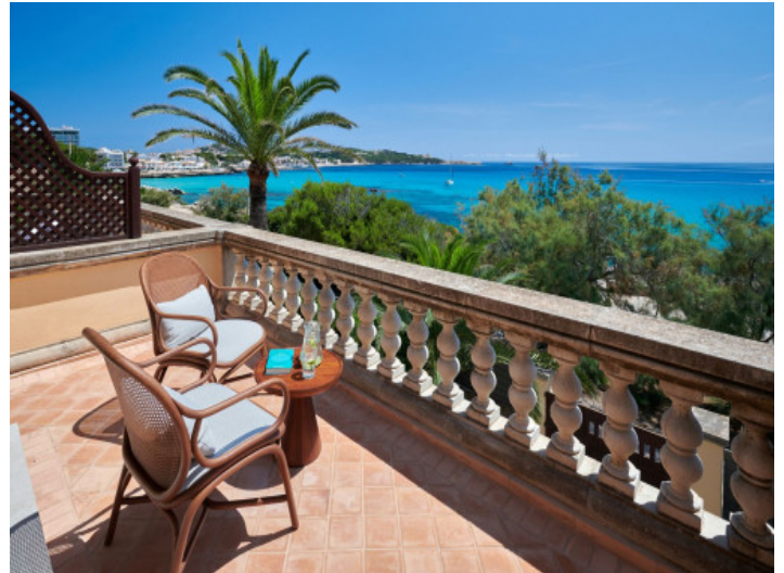
Sea view balcony