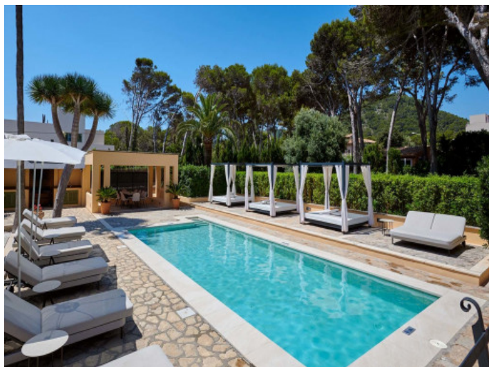
Wonderful pool oasis