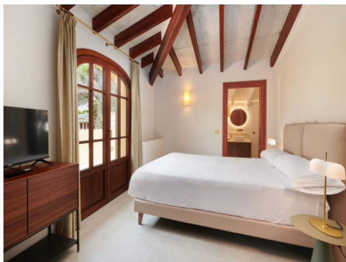
One of 7 bedrooms