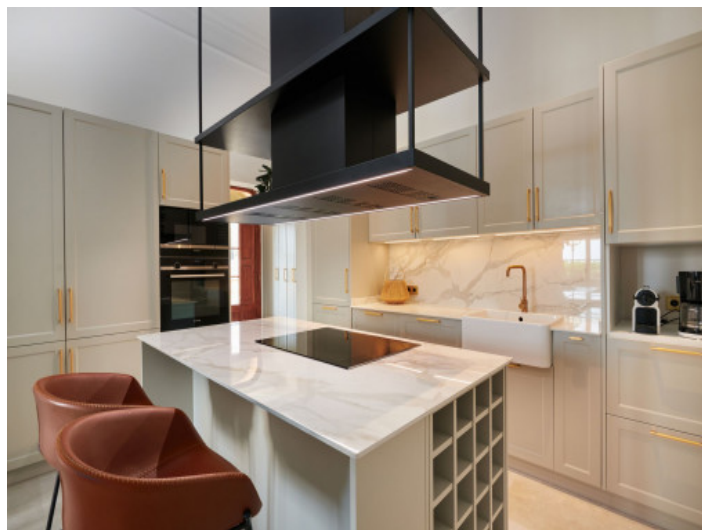
Modern kitchen with island