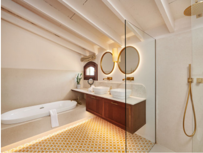
One of 8 bathrooms