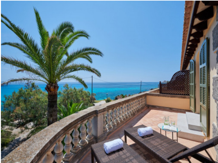
Sea view balcony