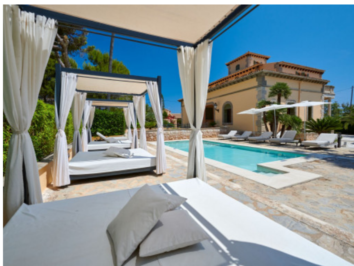
Relaxing pool area