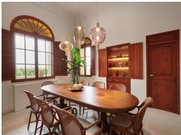
Enchanting dining area