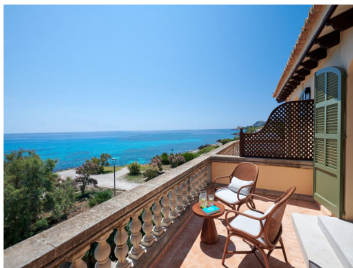
Wonderful seaside villa-retreat with 7 bedrooms, sea views and exclusive King's Gate District