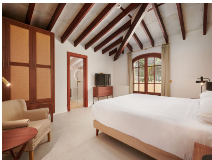
One of 7 bedrooms