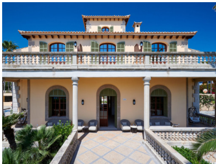
Access to the villa