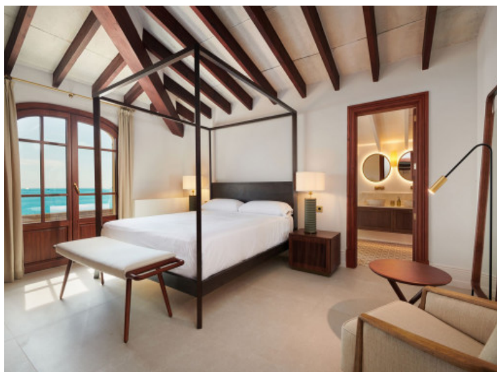
One of 7 bedrooms