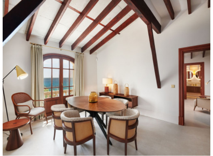
Further seating area