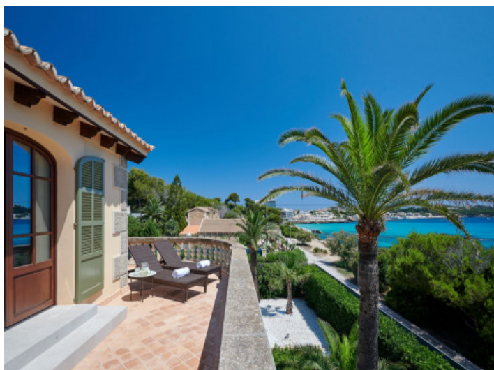
Sea view balcony