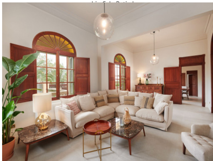
Living area with lots of character

All information is correct to the best of our knowledge. Errors and prior sale excepted. This prospectus is purely for information purposes. Only the notarized deed of sale is legally binding.