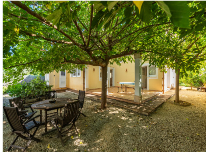
Idyllic rear terrace