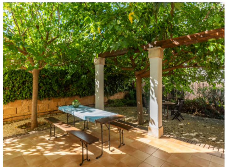
Rear terrace from the villa