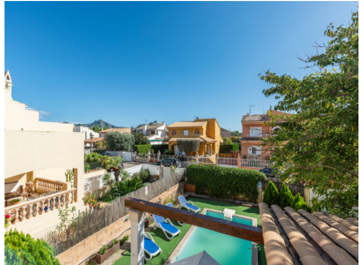
Views over the pool area