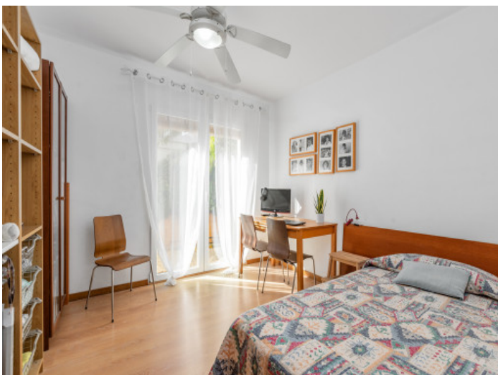
Bedroom with terrace access