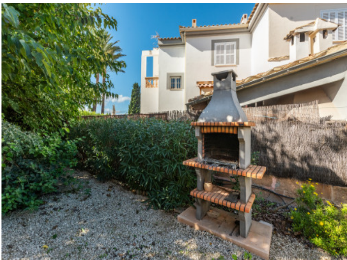
Mallorquin barbecue area