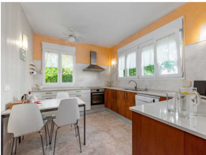
Kitchen with dining area