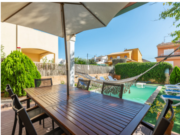
Terrace from the villa