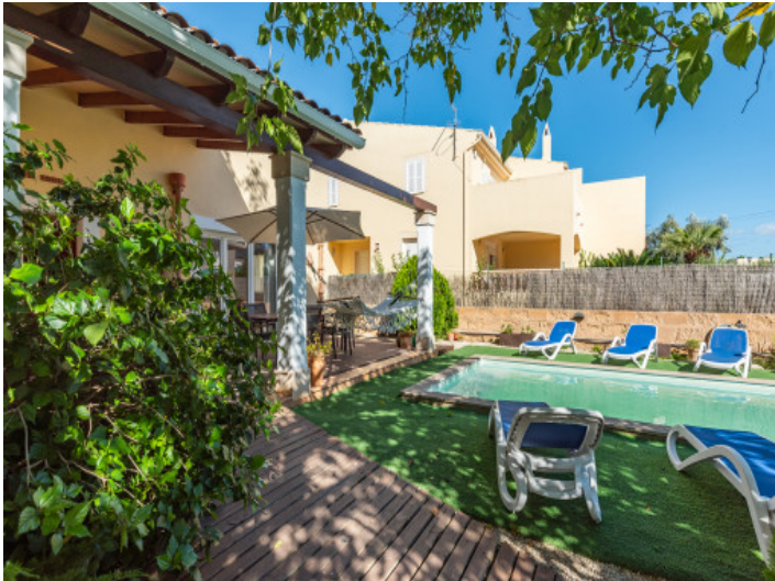
Gorgeous pool area