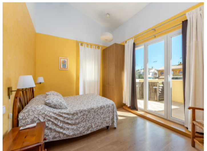
Bedroom with balcony

All information is correct to the best of our knowledge. Errors and prior sale excepted. This prospectus is purely for information purposes. Only the notarized deed of sale is legally binding.