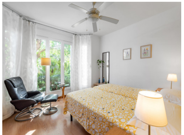
Bedroom with fan