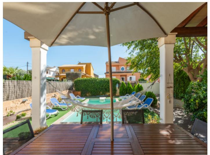
Terrace with dining area