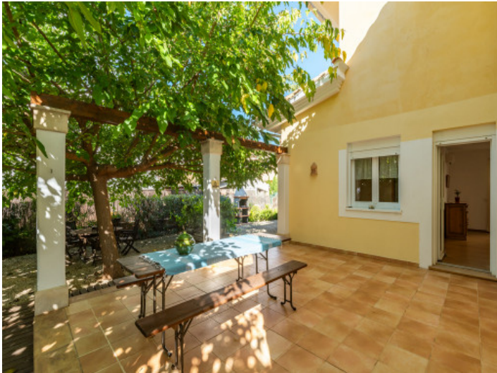
Rear terrace with shade-providing trees