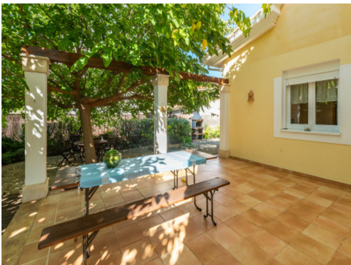
Tiled rear terrace