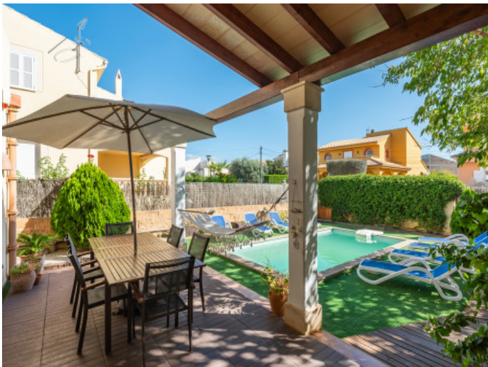
Terrace with views to the pool