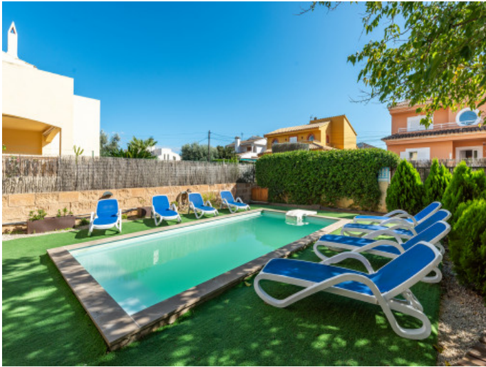
Pool area from the villa