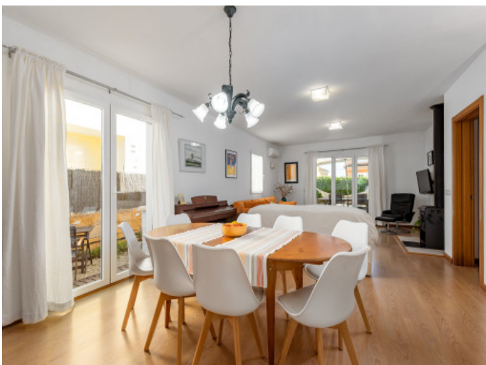
Open dining and living area