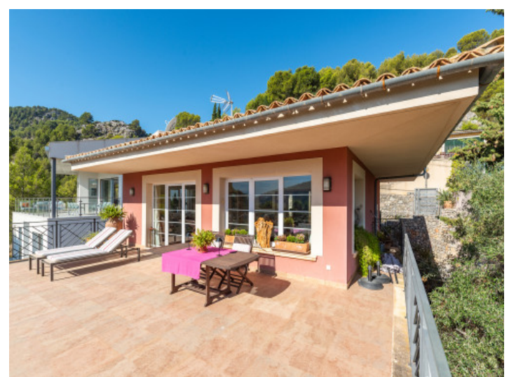
Terrace with outdoor furniture Sweeping views All information is correct to the best of our knowledge. Errors and prior sale excepted. This prospectus is purely for information purposes. Only the notarized deed of sale is legally binding.