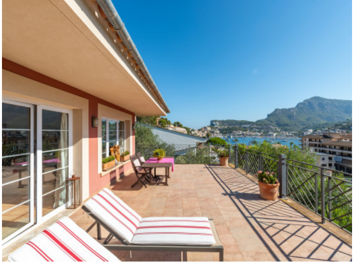
Sunny terrace with panoramic views