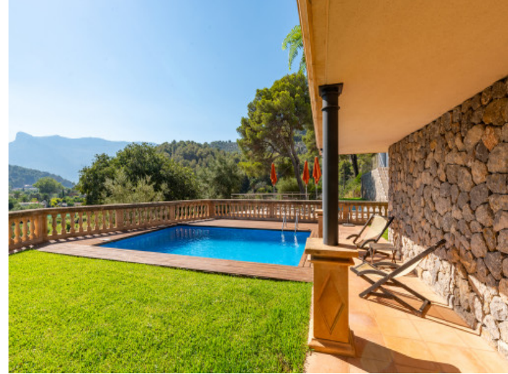
Beautiful pool area with lawn