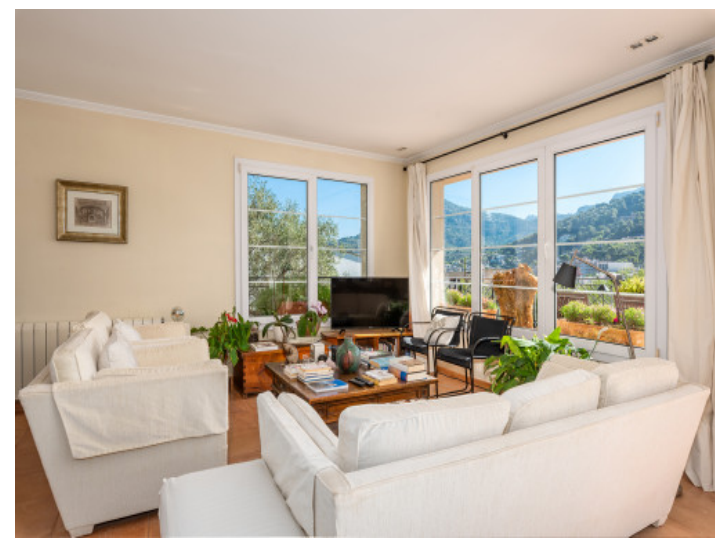
Lovely mountain views Comfortable living area All information is correct to the best of our knowledge. Errors and prior sale excepted. This prospectus is purely for information purposes. Only the notarized deed of sale is legally binding.