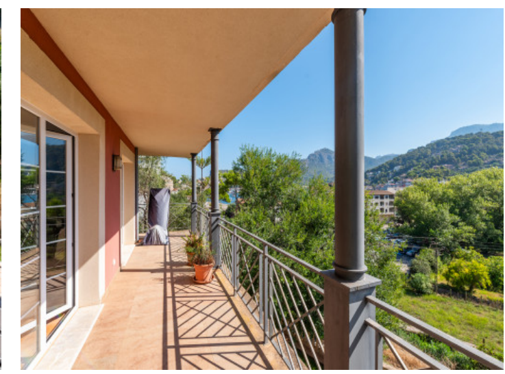
Large private pool Covered terrace All information is correct to the best of our knowledge. Errors and prior sale excepted. This prospectus is purely for information purposes. Only the notarized deed of sale is legally binding.