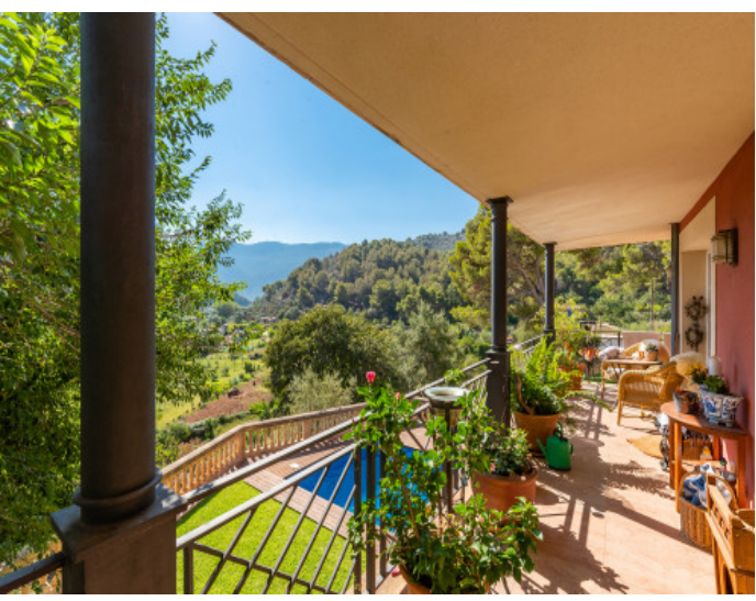
Covered terrace with mountain views