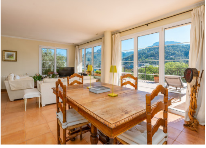
Living and dining area with magnificent views