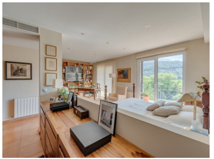
One of 4 bedrooms Study in master bedroom All information is correct to the best of our knowledge. Errors and prior sale excepted. This prospectus is purely for information purposes. Only the notarized deed of sale is legally binding.