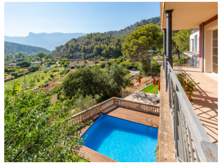
Terrace overlooking the pool

PORTA MALLORQUINA® Your home. Our passion.