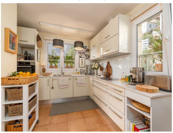
Modern, fully equipped kitchen