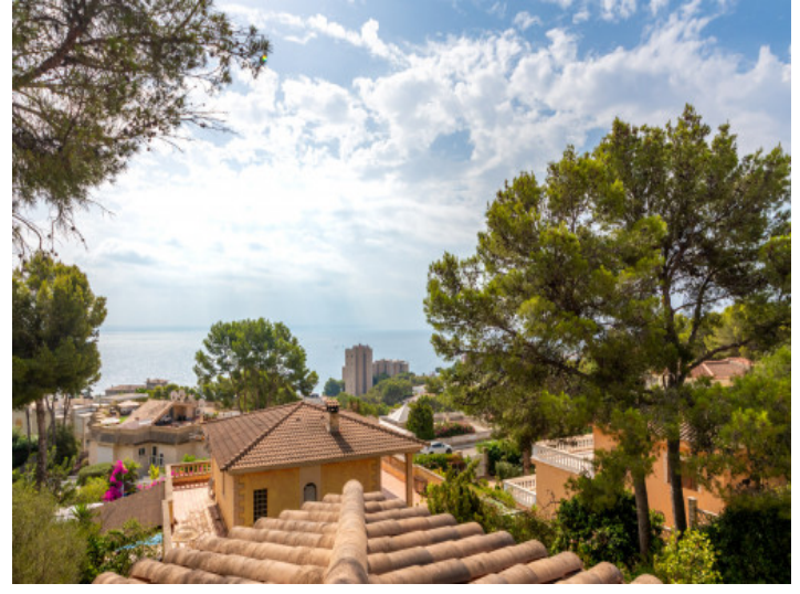
Fantastic sea views