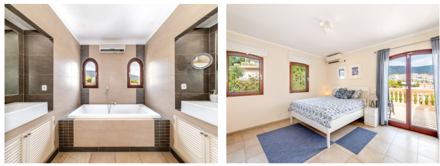
Bathroom en suite with bathtub

PORTA MALLORQUINA® Your home. Our passion.