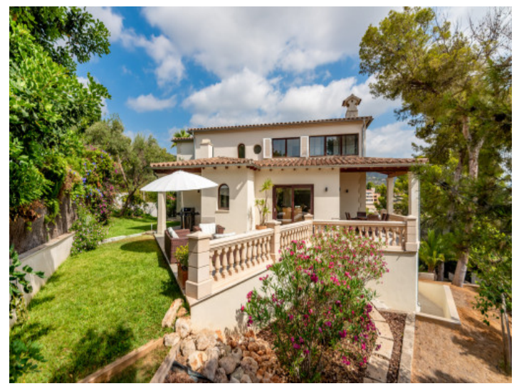
Lovely garden and terraces