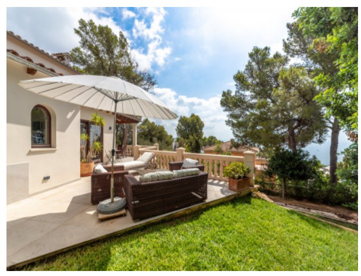
Cosy lounge terrace