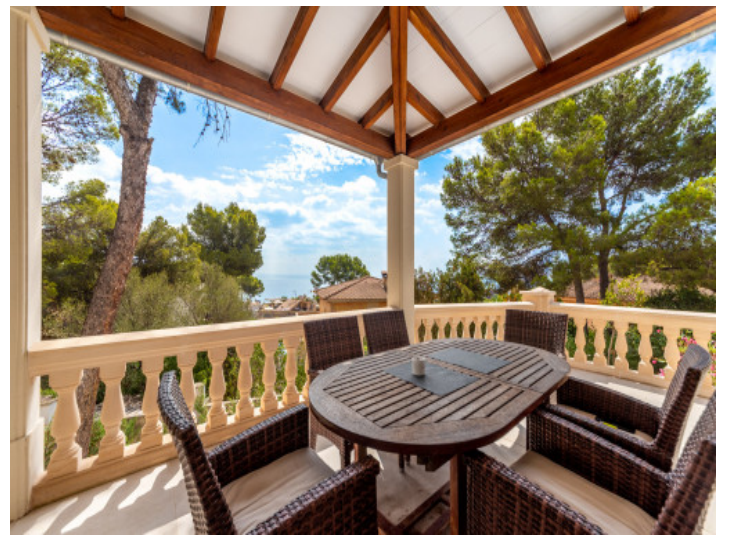
Covered outdoor dining area