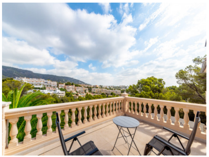
Terrace with sweeping views Refreshing pool area All information is correct to the best of our knowledge. Errors and prior sale excepted. This prospectus is purely for information purposes. Only the notarized deed of sale is legally binding.