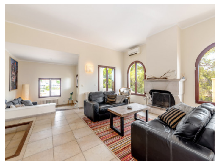
Large living area Further seating area All information is correct to the best of our knowledge. Errors and prior sale excepted. This prospectus is purely for information purposes. Only the notarized deed of sale is legally binding.