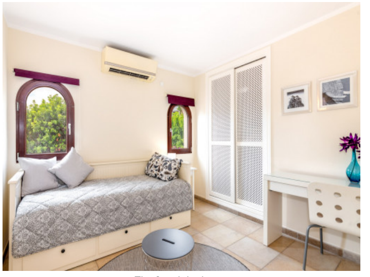
The fourth bedroom