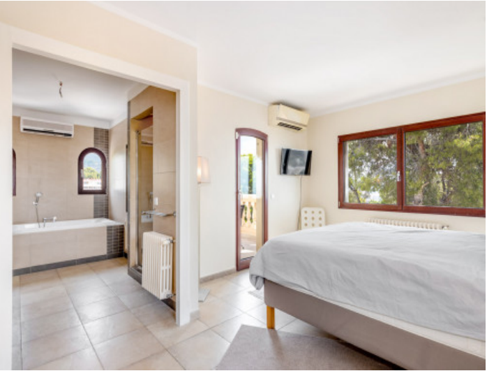
Bedroom with bathroom en suite

All information is correct to the best of our knowledge. Errors and prior sale excepted. This prospectus is purely for information purposes. Only the notarized deed of sale is legally binding.