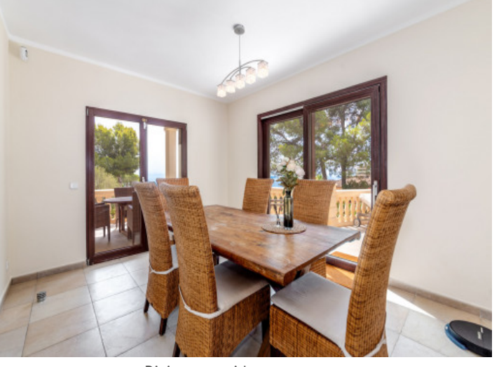
Dining area with terrace access