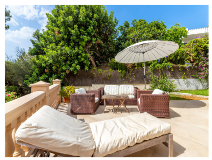
Sunny lounge terrace