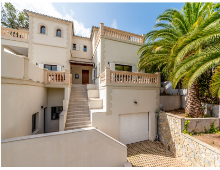
Terrace and garden