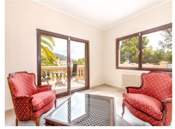
Room with terrace access