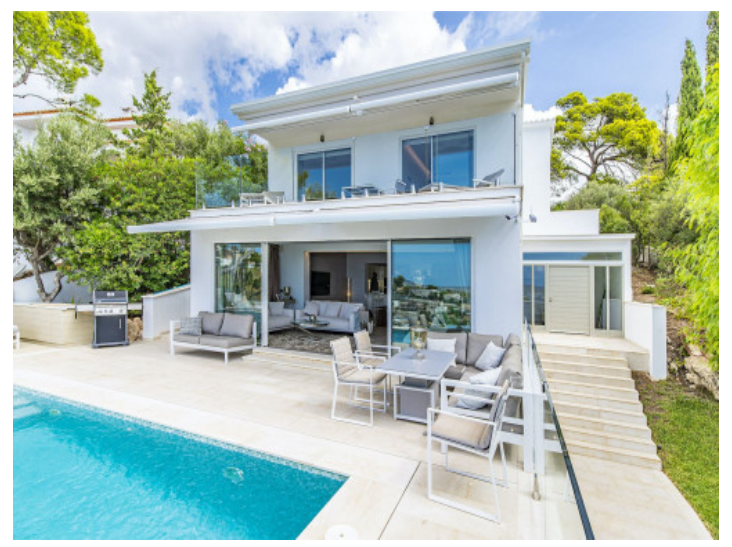
Modern luxurious villa