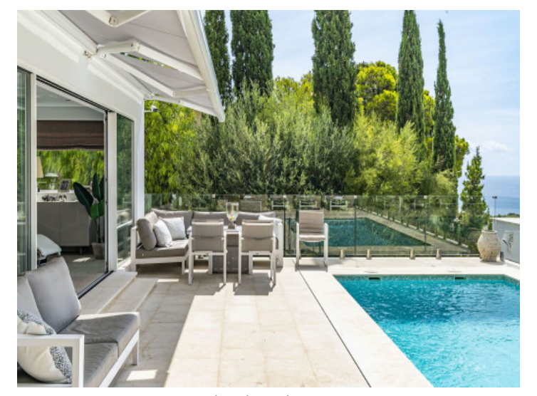
Lovely pool area