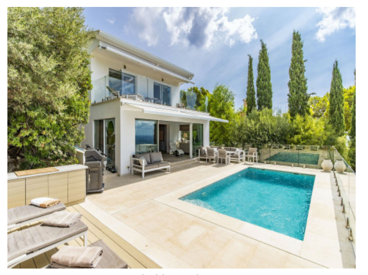
Inviting pool area

All information is correct to the best of our knowledge. Errors and prior sale excepted. This prospectus is purely for information purposes. Only the notarized deed of sale is legally binding.