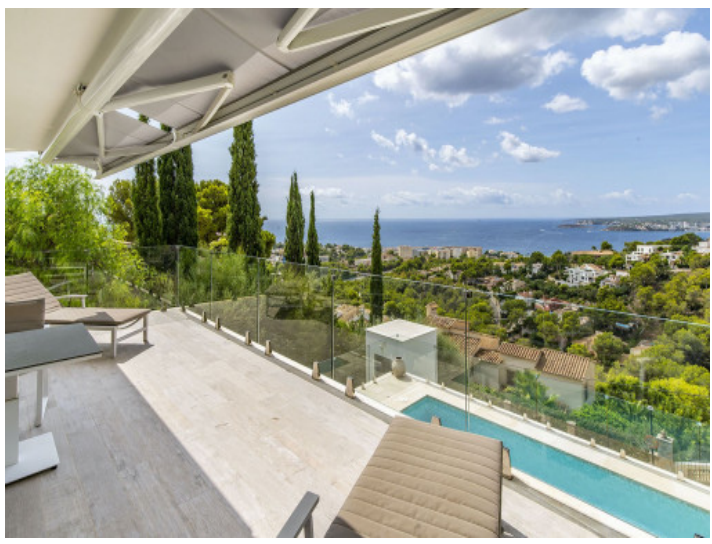
Sunny terrace with awning