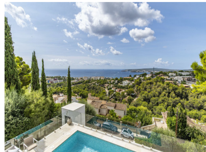
Fantastic sweeping views