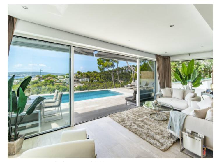
Living area with direct access to a terrace