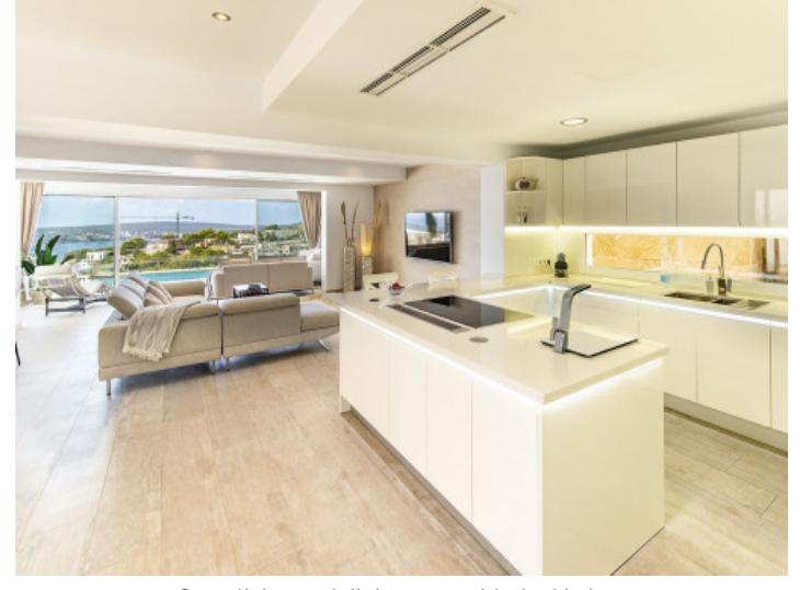
Open living and dining area with the kitchen

All information is correct to the best of our knowledge. Errors and prior sale excepted. This prospectus is purely for information purposes. Only the notarized deed of sale is legally binding.