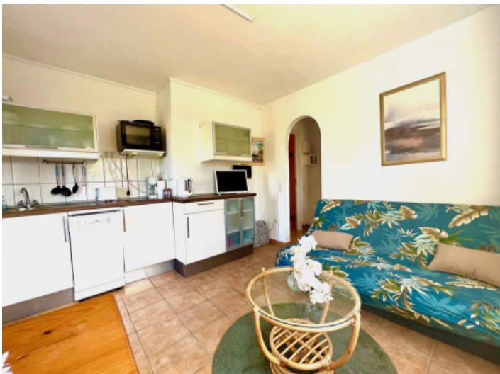
One of 6 apartments