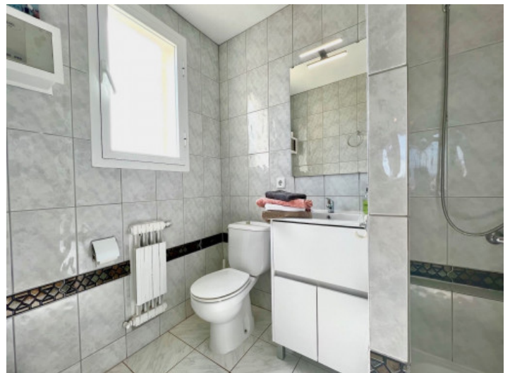
One of 7 bathrooms

All information is correct to the best of our knowledge. Errors and prior sale excepted. This prospectus is purely for information purposes. Only the notarized deed of sale is legally binding.