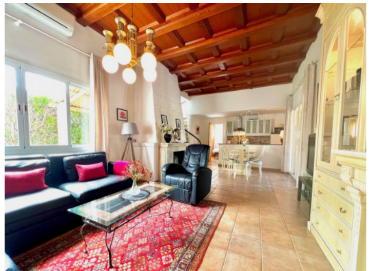
One of 6 apartments

All information is correct to the best of our knowledge. Errors and prior sale excepted. This prospectus is purely for information purposes. Only the notarized deed of sale is legally binding.