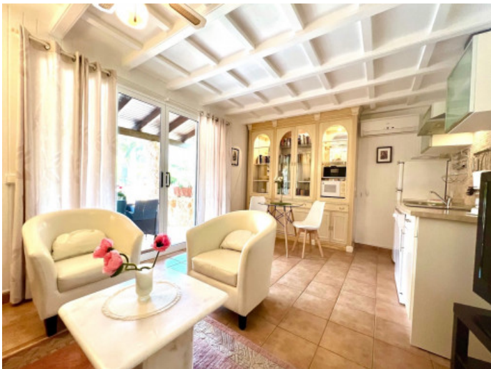
One of 6 apartments