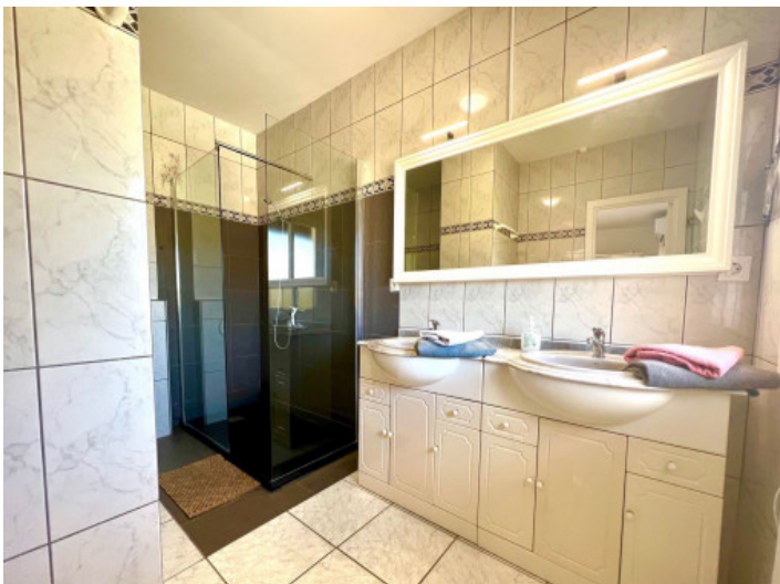
One of 7 bathrooms