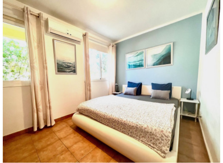
One of 7 bedrooms