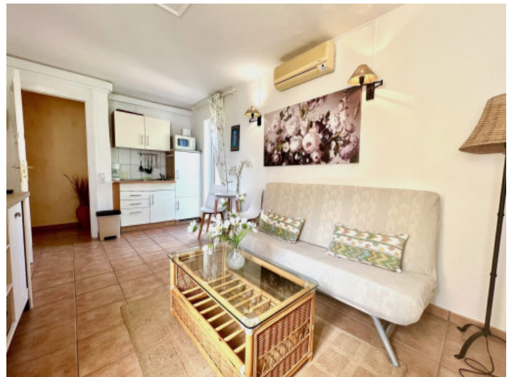
One of 6 apartments