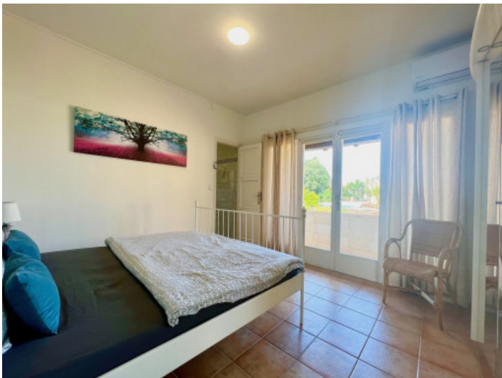
One of 7 bedrooms