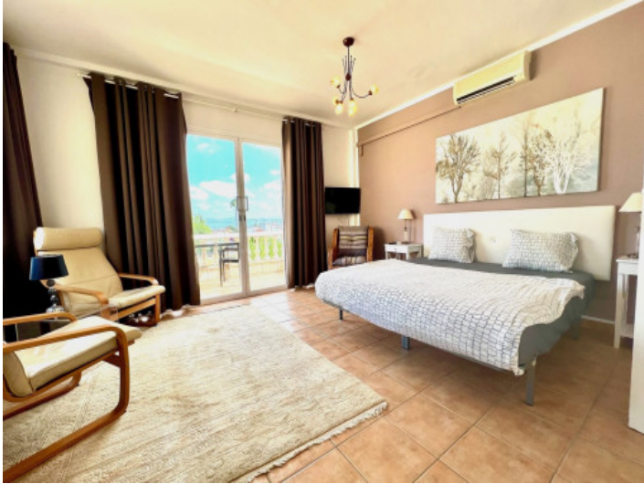
One of 7 bedrooms