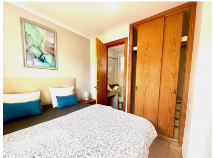
One of 7 bedrooms