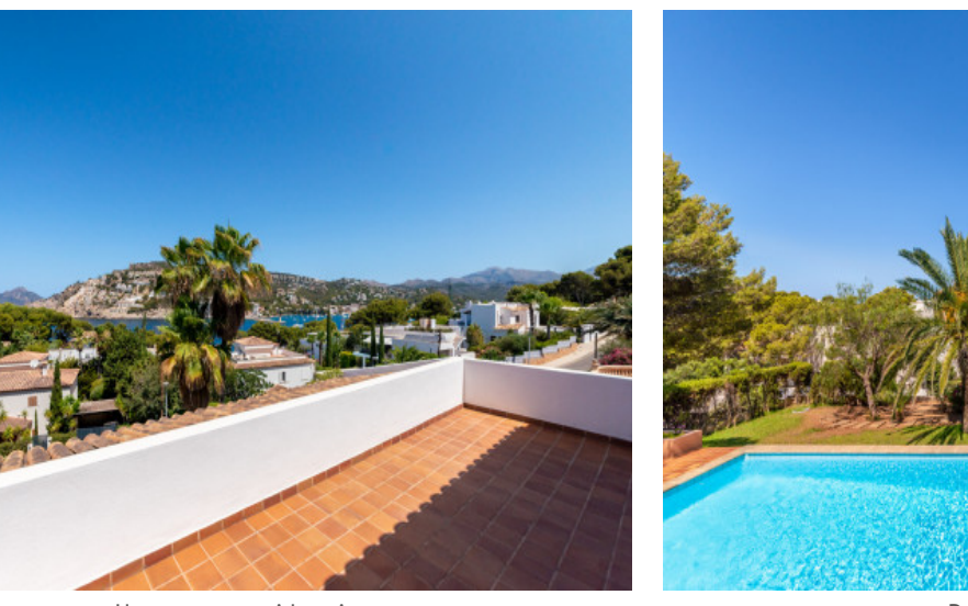
Upper terrace with a view Dreamlike pool area All information is correct to the best of our knowledge. Errors and prior sale excepted. This prospectus is purely for information purposes. Only the notarized deed of sale is legally binding.

PORTA MALLORQUINA • THERESIENSTR.: 81, 80333 MUNICH TEL. +34 971 698 242 • INFO@PORTAMALLORQUINA.COM