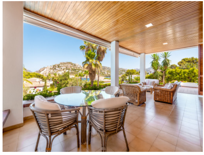
Covered terrace with lounge area