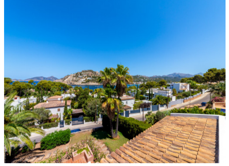
Fantastic sea views

PORTA MALLORQUINA® Your home. Our passion.