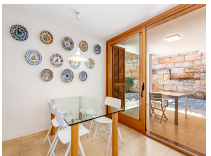
Dining area with direct terrace access Fully equipped kitchen All information is correct to the best of our knowledge. Errors and prior sale excepted. This prospectus is purely for information purposes. Only the notarized deed of sale is legally binding.

PORTA MALLORQUINA • THERESIENSTR.: 81, 80333 MUNICH TEL. +34 971 698 242 • INFO@PORTAMALLORQUINA.COM