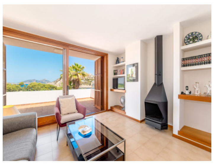
Further living area with terrace