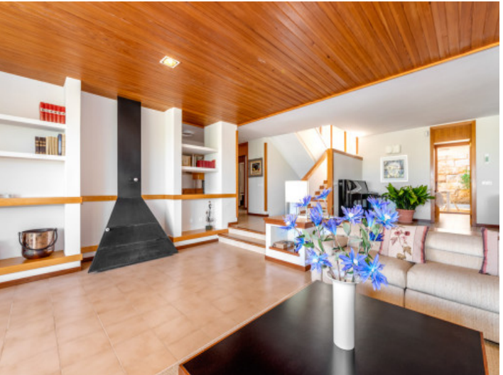
Large, open living area