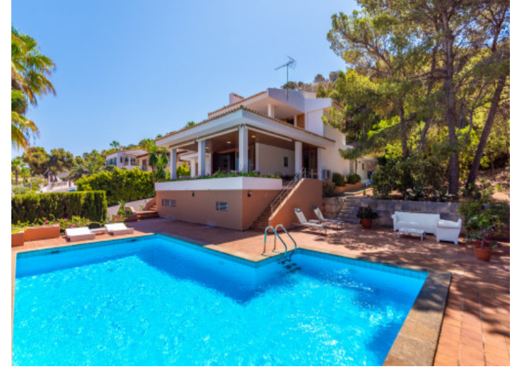
Pool area and terraces