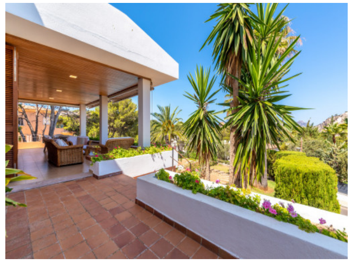
Spacious terrace on the upper floor

PORTA MALLORQUINA<sup>®</sup> Your home. Our passion.