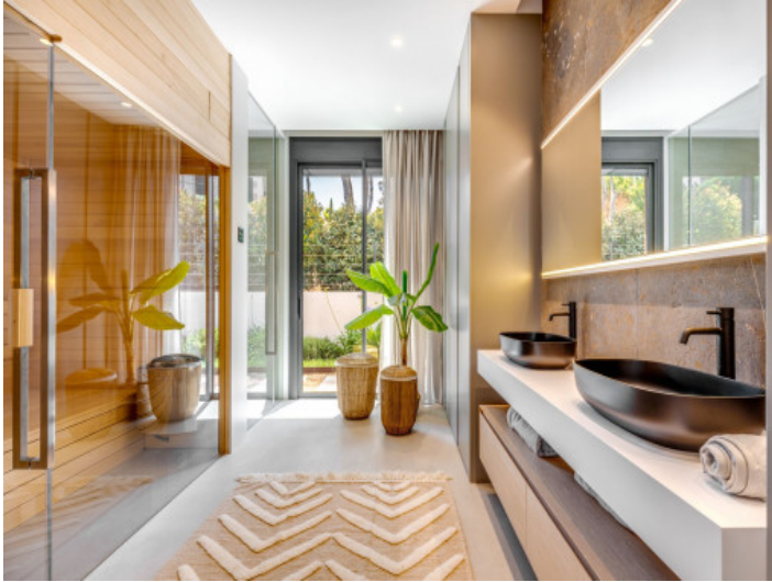
Luxury bathroom with sauna