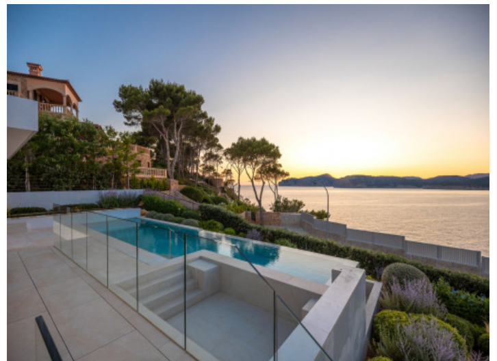
Gorgeous sea views from the terrace

All information is correct to the best of our knowledge. Errors and prior sale excepted. This prospectus is purely for information purposes. Only the notarized deed of sale is legally binding.