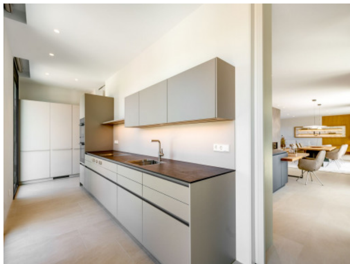
Further hidden kitchen