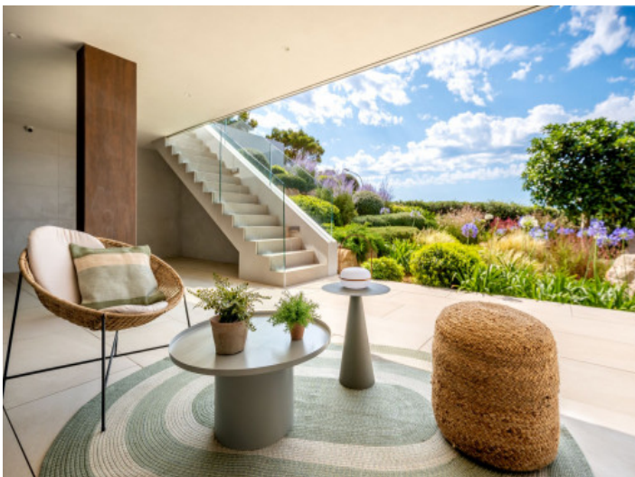
Tranquil lounge terrace