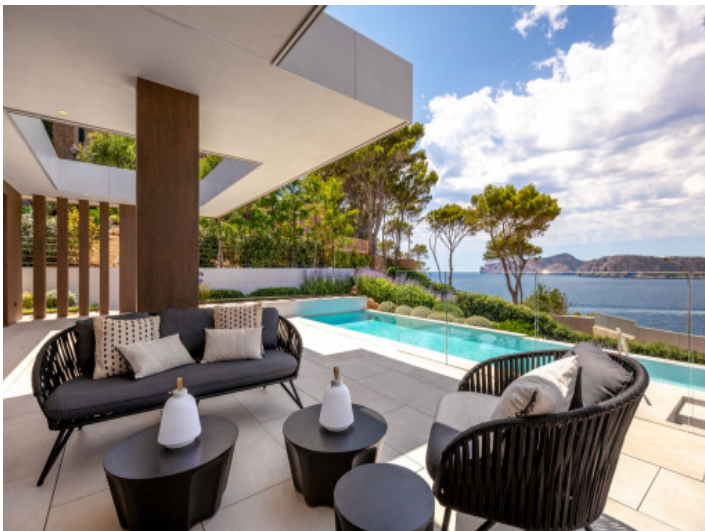
Sea view lounge terrace