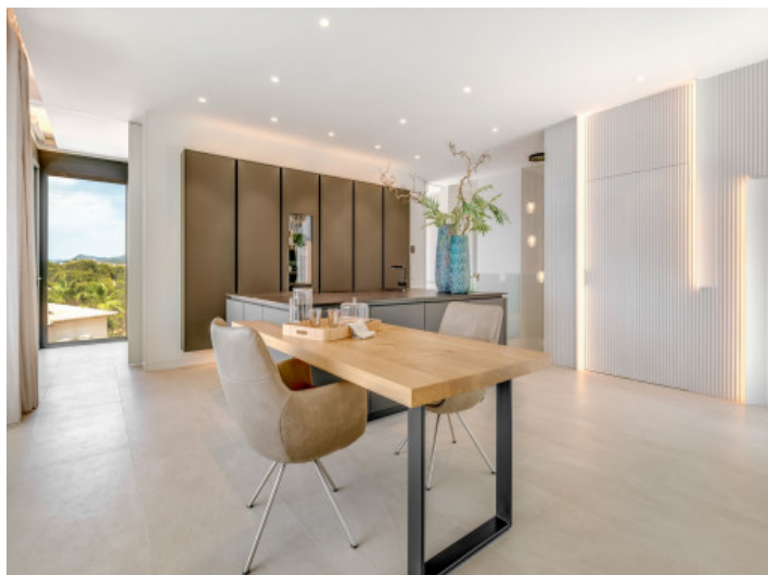
High-quality designer kitchen