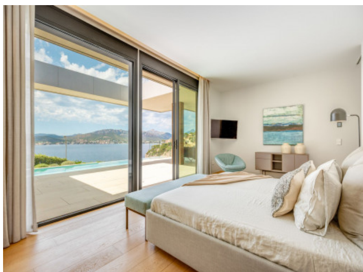
Bedroom with sea view terrace