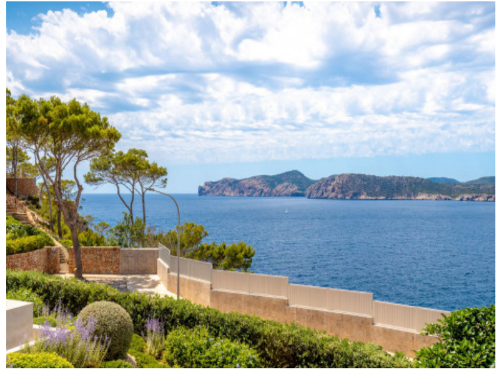
Wonderful sea views