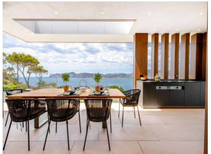
Outdoor sea view terrace