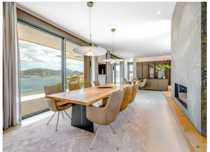
Stylish dining area

All information is correct to the best of our knowledge. Errors and prior sale excepted. This prospectus is purely for information purposes. Only the notarized deed of sale is legally binding.