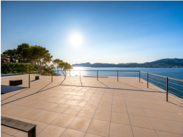
Large sea view roof terrace