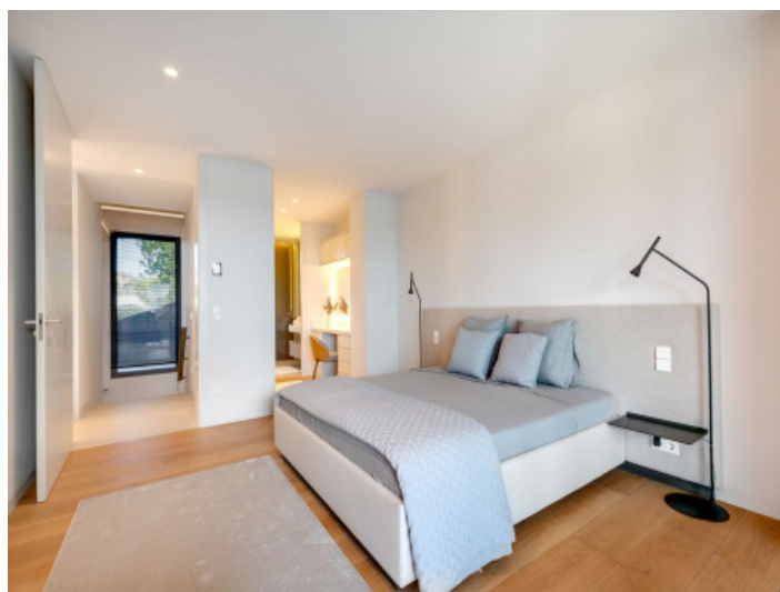
Open en suite bathroom