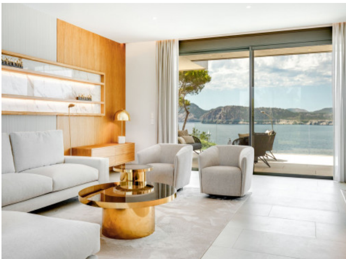
Modern living area