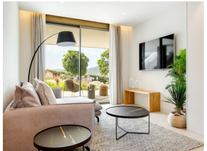
Further living area in the lower floor