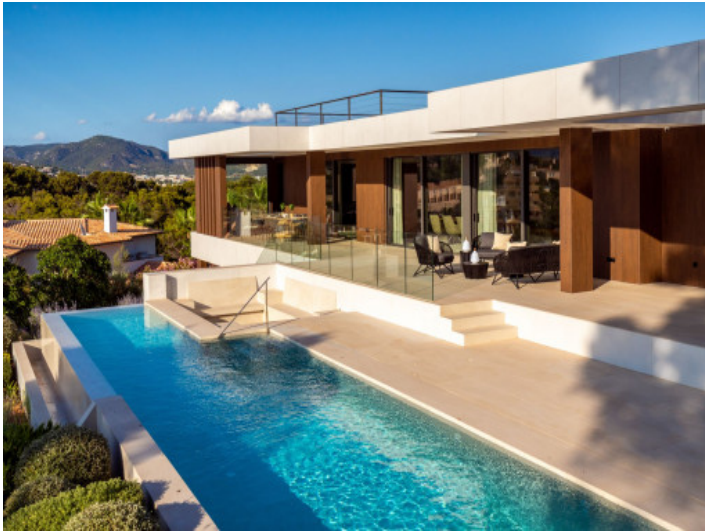
Elegant pool with sun terraces