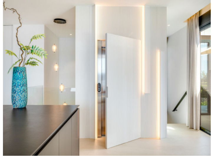
A lift connects the floors