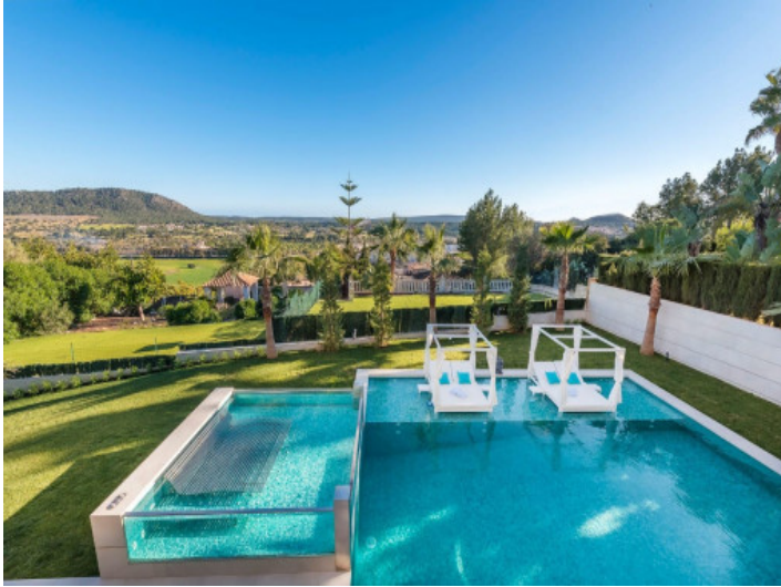
View of the villa