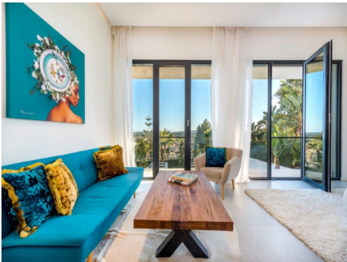
Separate sitting area