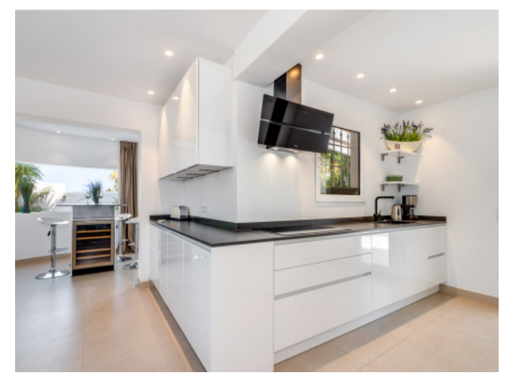
Modern kitchen in white