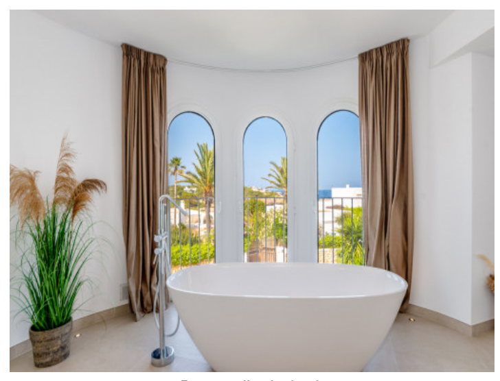
Free standing bath tub