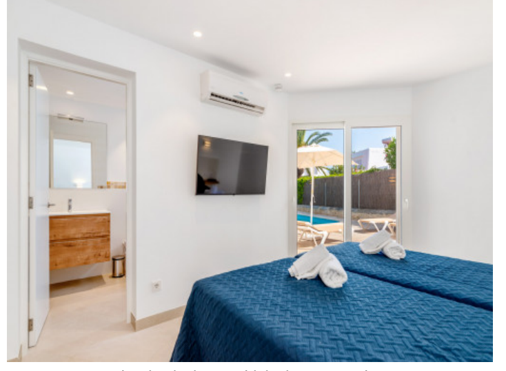
Another bedroom with bathroom en suite

All information is correct to the best of our knowledge. Errors and prior sale excepted. This prospectus is purely for information purposes. Only the notarized deed of sale is legally binding.