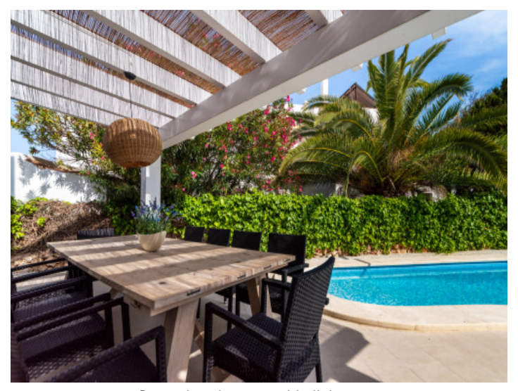
Covered pool terrace with dining area