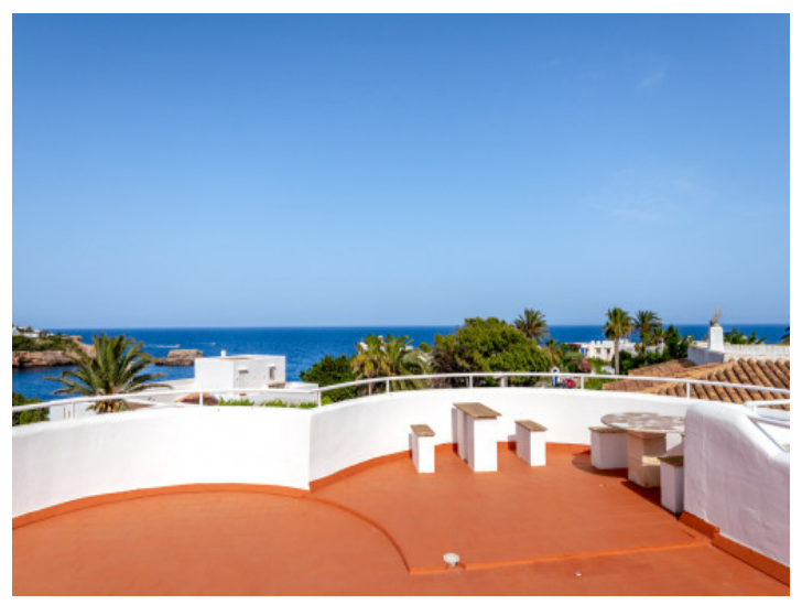
Sea view roof terrace