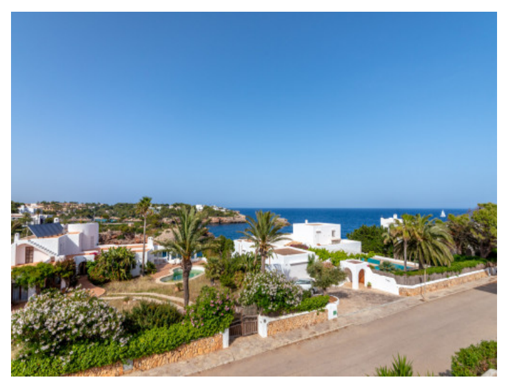
Splendid sea views