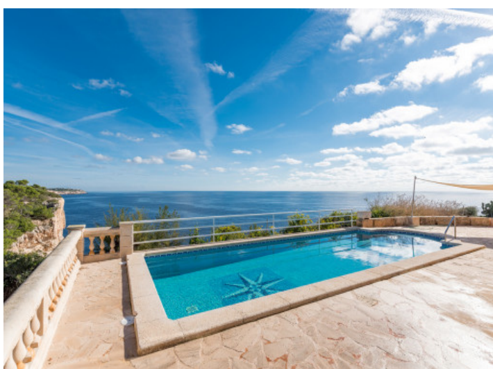
Gorgeous pool area next to the sea