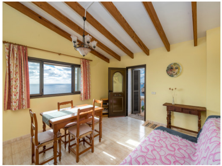
Further dining area with wooden ceiling beams