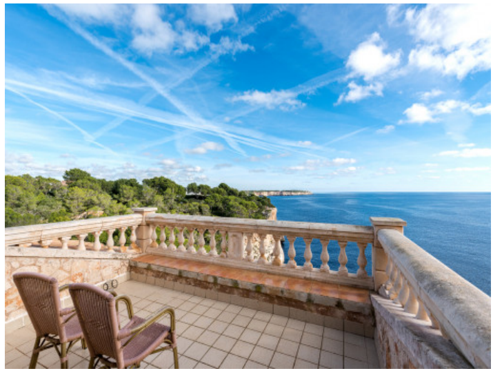
Magnificent roof terrace with sea views

All information is correct to the best of our knowledge. Errors and prior sale excepted. This prospectus is purely for information purposes. Only the notarized deed of sale is legally binding.