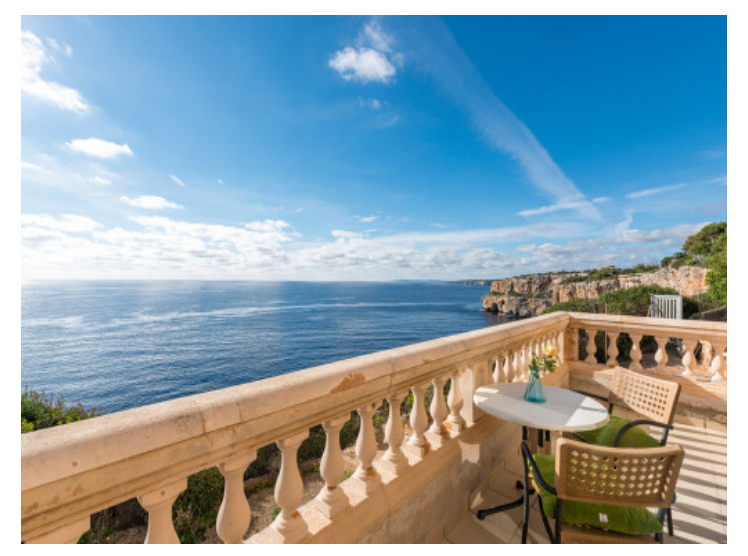
Stunning sea view terrace