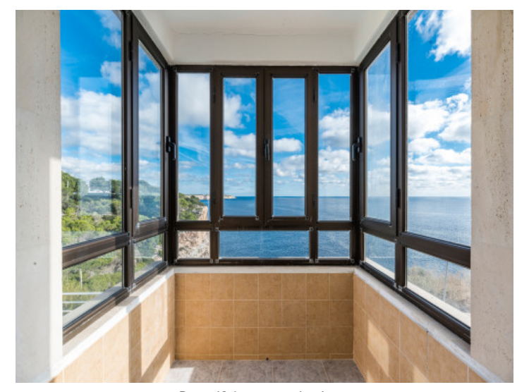
Beautiful panoramic views