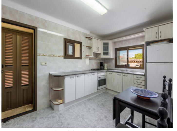
Second kitchen of the property

All information is correct to the best of our knowledge. Errors and prior sale excepted. This prospectus is purely for information purposes. Only the notarized deed of sale is legally binding.