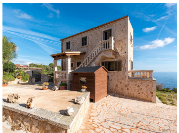
Front view of the villa with stone facade