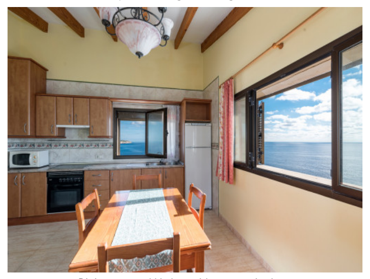
Dining area and kitchen with panoramic views