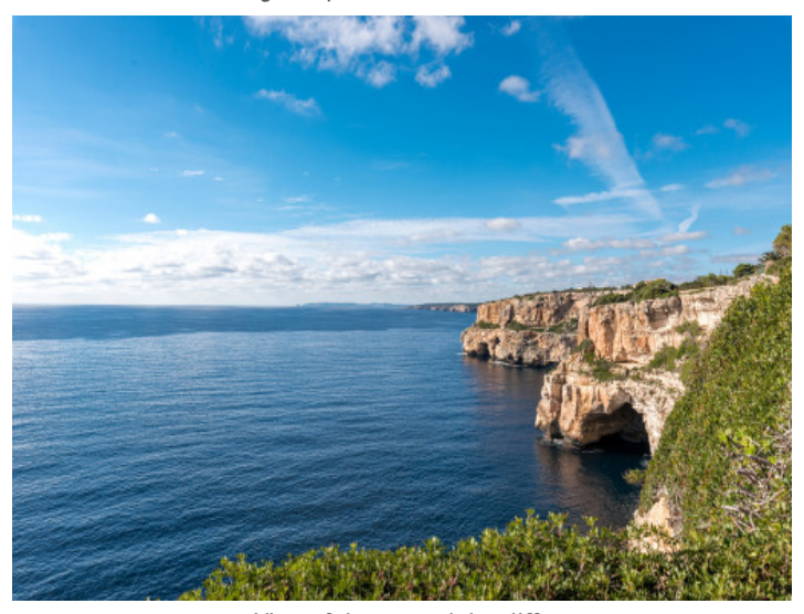
View of the sea and the cliffs