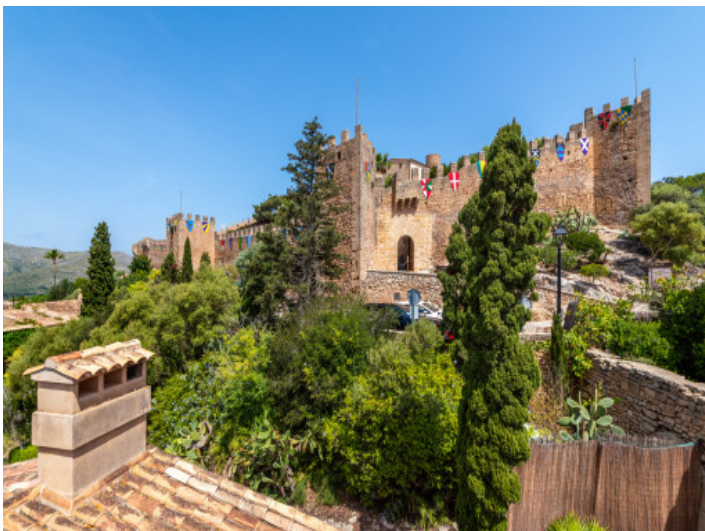
View to the castle

All information is correct to the best of our knowledge. Errors and prior sale excepted. This prospectus is purely for information purposes. Only the notarized deed of sale is legally binding.