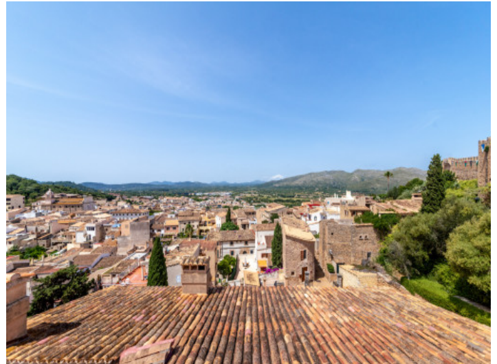
Views over the roof tops