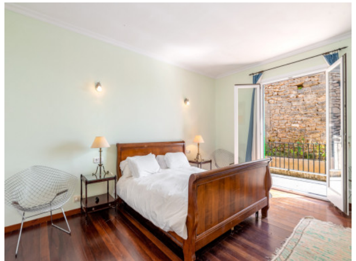
One of 8 bedrooms