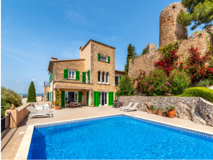
Manor House at Capdepera Castle