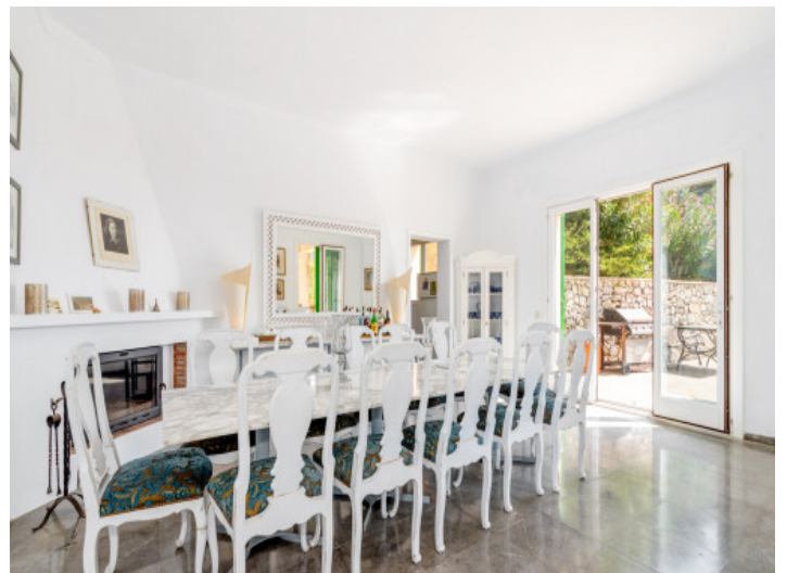
Dining area with a fireplace

All information is correct to the best of our knowledge. Errors and prior sale excepted. This prospectus is purely for information purposes. Only the notarized deed of sale is legally binding.