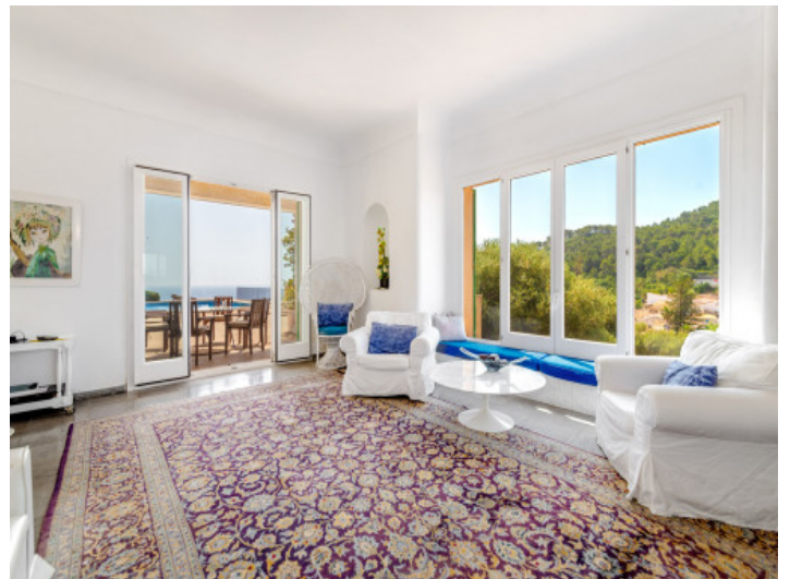
Bright living area with a fantastic view