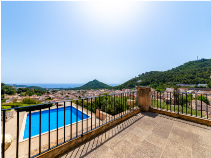
Sunny terrace with fantastic views