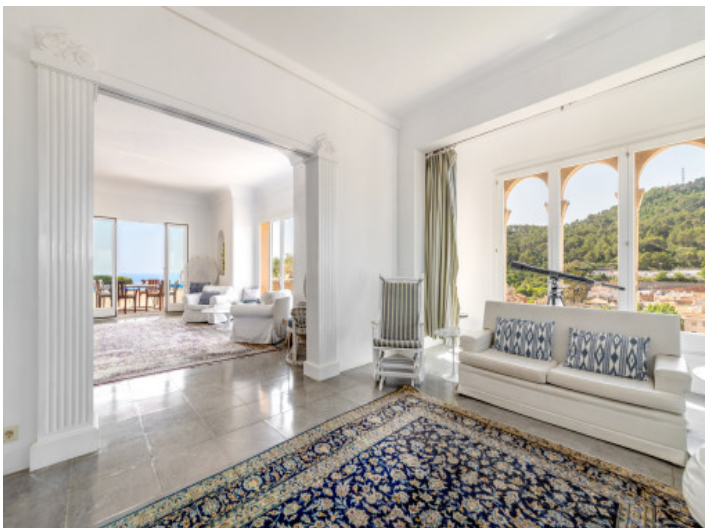
Very spacious living area