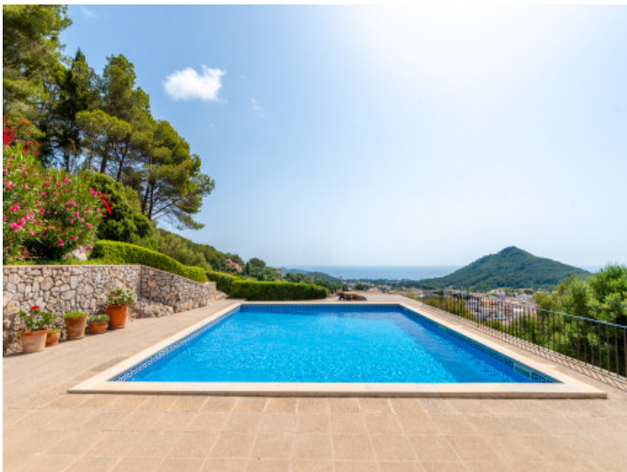
Fantastic pool area