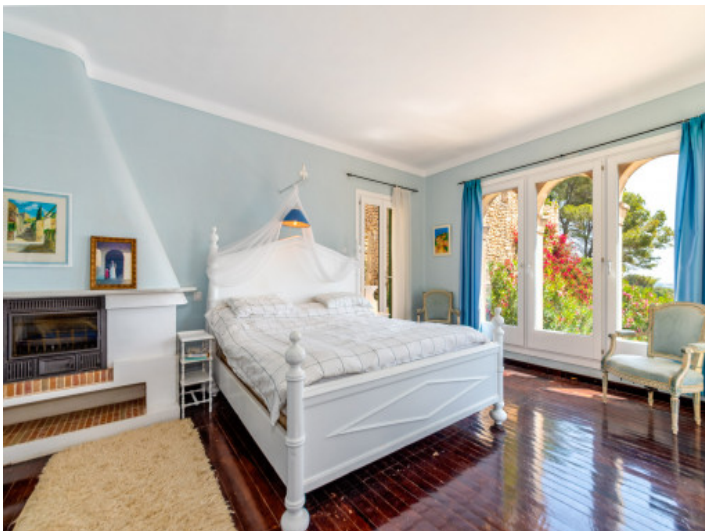
One of 8 bedrooms