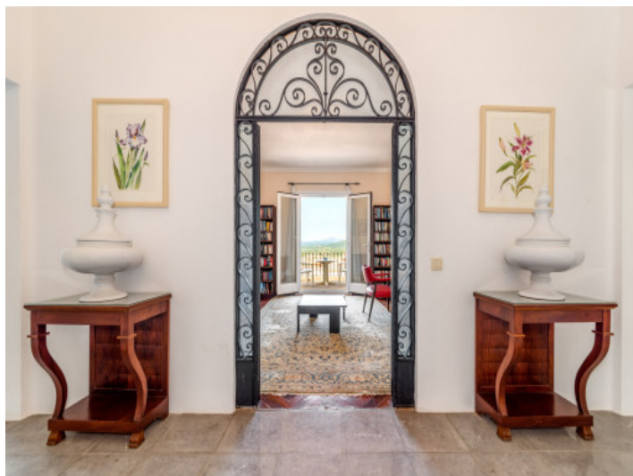
Beautiful entrance to the study