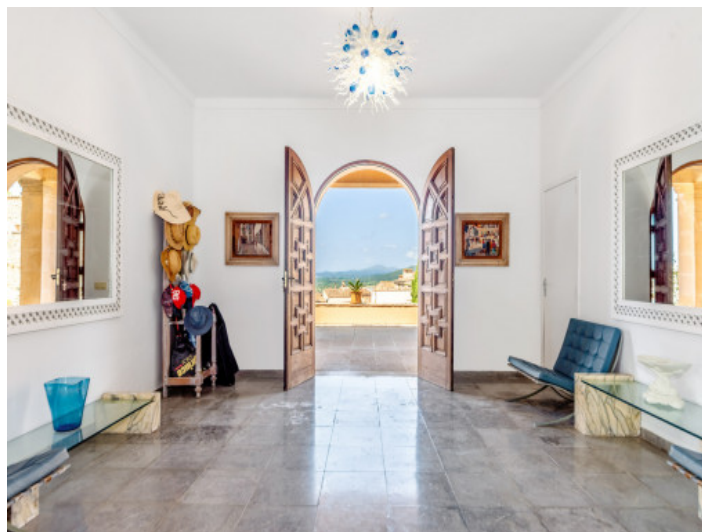
Lovely entrance hall