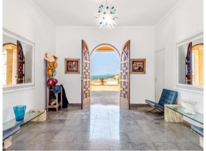
Lovely entrance hall