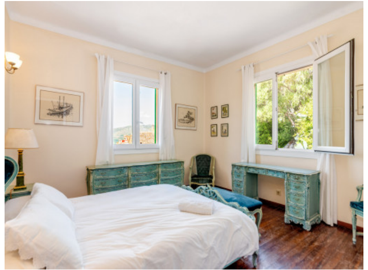
One of 8 bedrooms