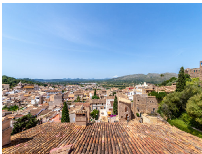
Views over the roof tops