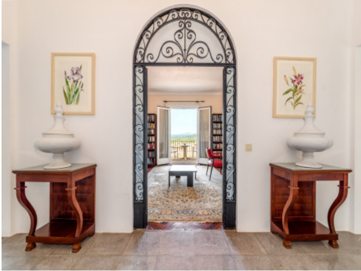
Beautiful entrance to the study