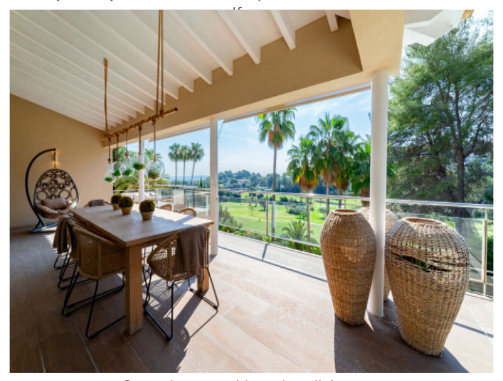
Covered terrace with outdoor dining area