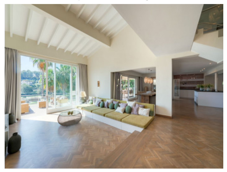
Large, light-flooded living area