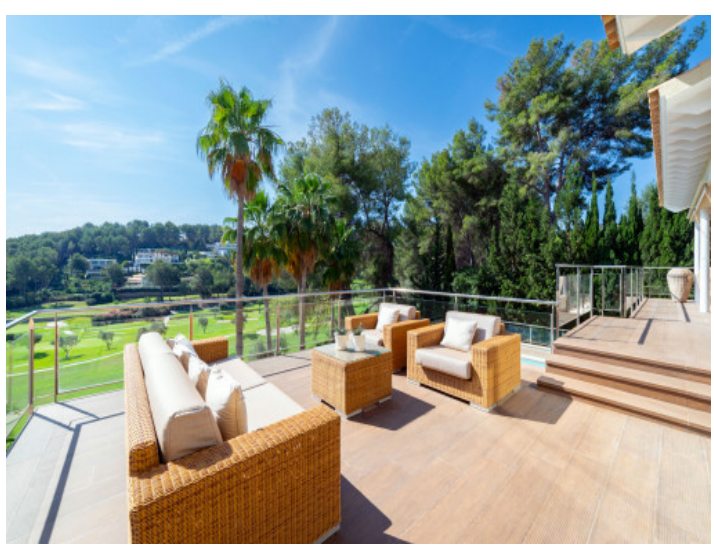
Sunny terrace with a stunning view