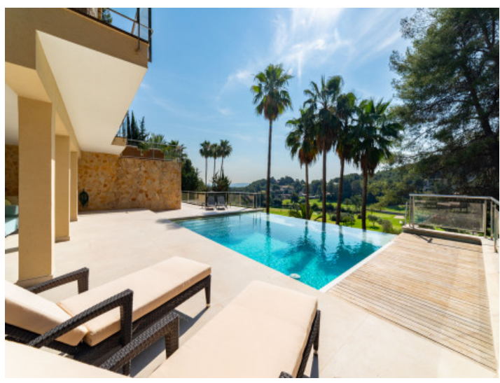
Family-friendly villa in Son Vida with pool and excellent views across the