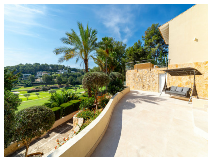
Sunny terrace overlooking the golf course