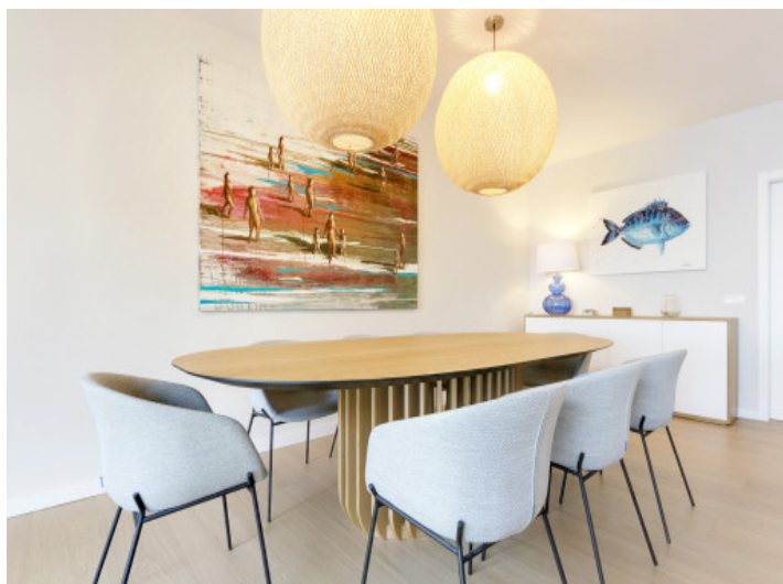
Modern dining area