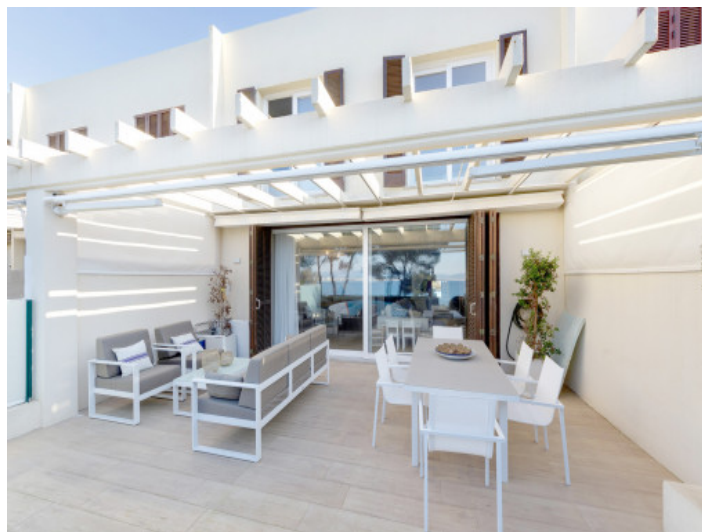
Fantastic sea view terrace