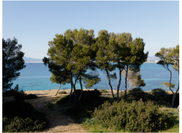
Stunning sea views

All information is correct to the best of our knowledge. Errors and prior sale excepted. This prospectus is purely for information purposes. Only the notarized deed of sale is legally binding.