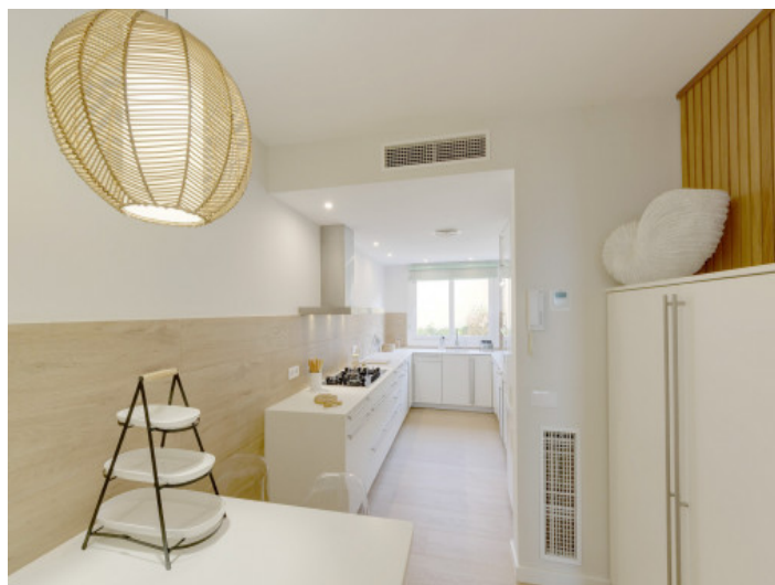
Kitchen with breakfast area

All information is correct to the best of our knowledge. Errors and prior sale excepted. This prospectus is purely for information purposes. Only the notarized deed of sale is legally binding.