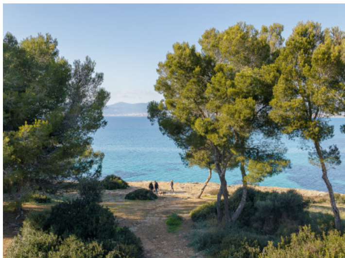
Located in first sea line