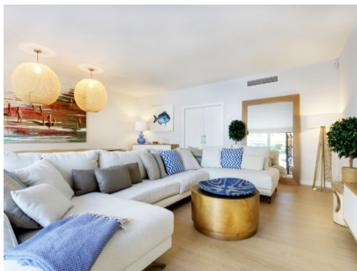
Comfortable living area