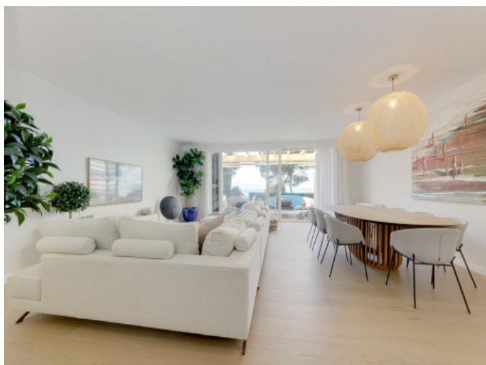
Living and dining area with terrace access