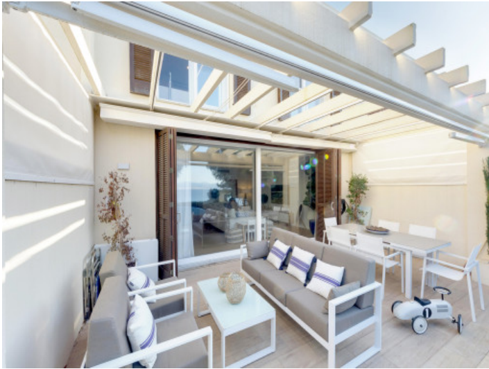
Lounge and dining terrace