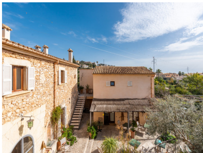
View over the wonderful terrace

All information is correct to the best of our knowledge. Errors and prior sale excepted. This prospectus is purely for information purposes. Only the notarized deed of sale is legally binding.