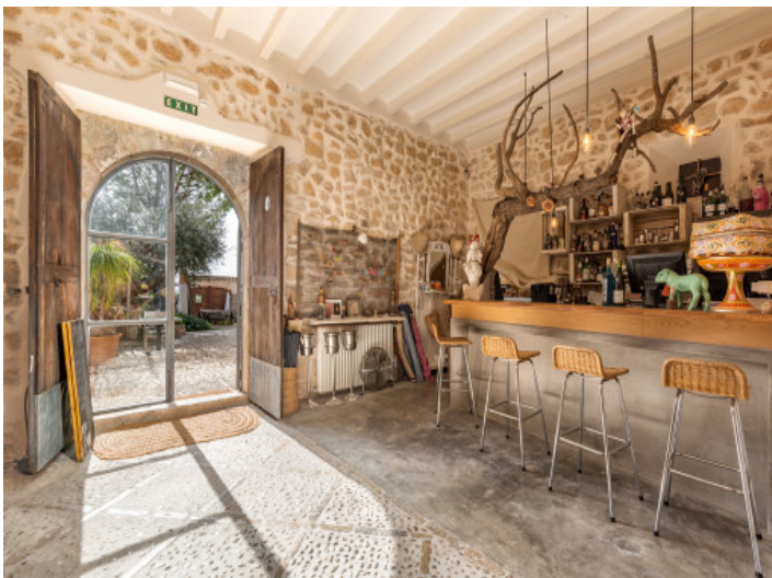
Entrance to the main house with bar area