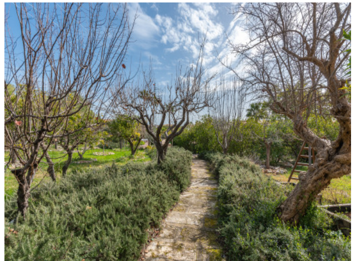
Path through the garden with fruit trees