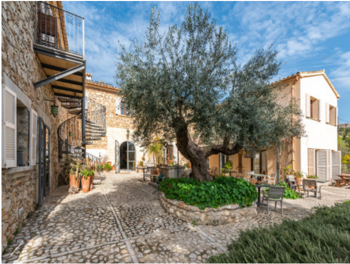
Finca and enchanting patio-like terrace