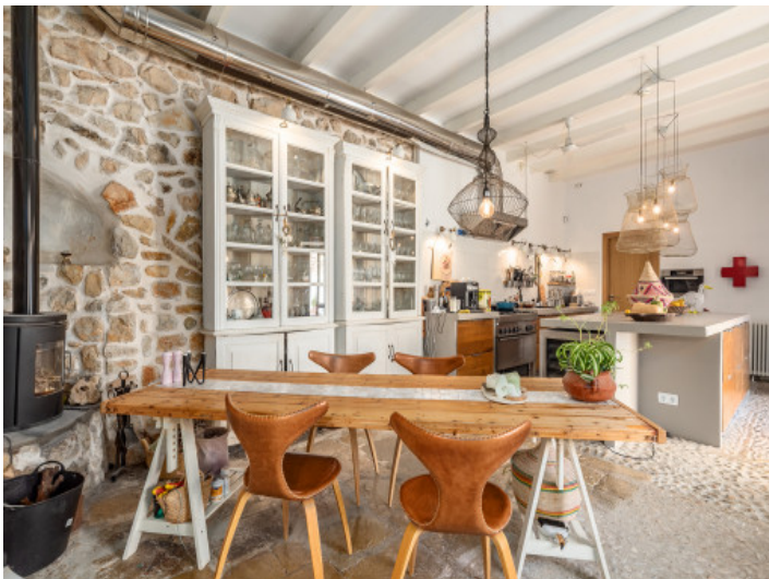
Dining table with fireplace and charcter