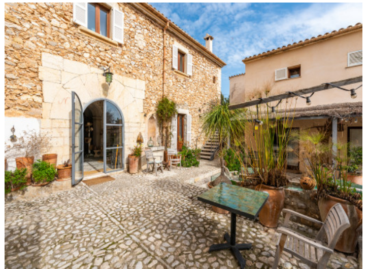
View of the building and entrance