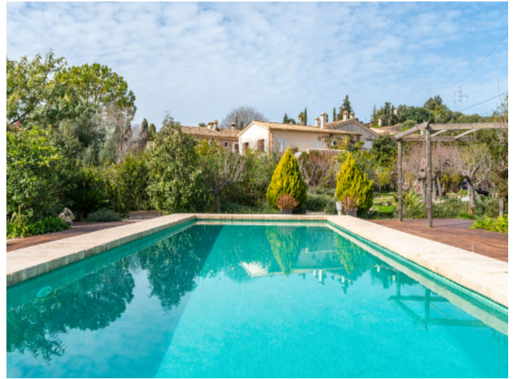
Beautifully located salt-water pool