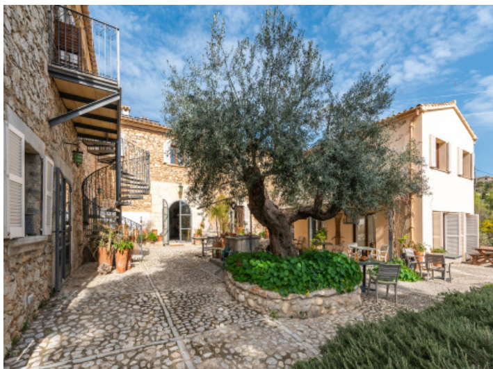
Finca and enchanting patio-like terrace