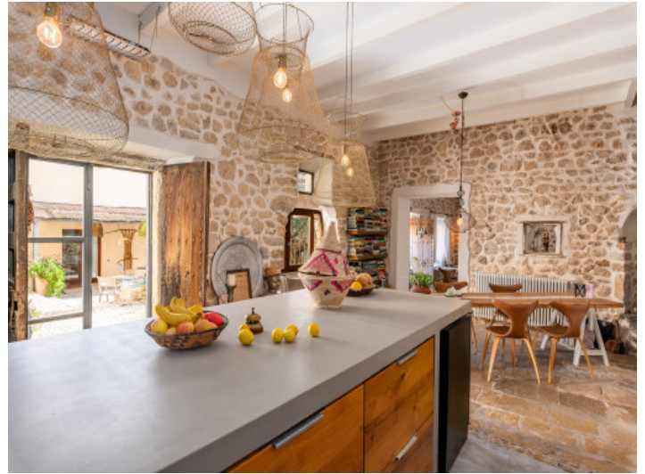
Open kitchen area with terrace access