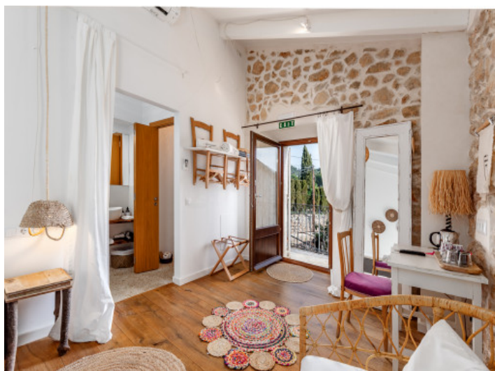
Bedroom with lots of charme