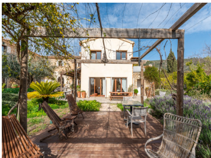
Further garden terrace