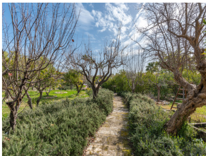
Path through the garden with fruit trees