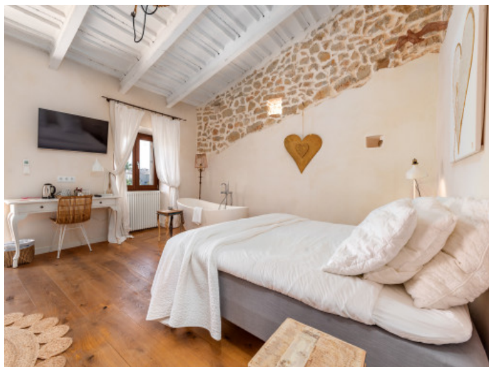
One of 8 bedrooms