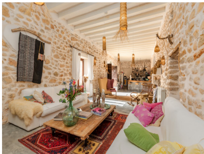
Large, open living area

All information is correct to the best of our knowledge. Errors and prior sale excepted. This prospectus is purely for information purposes. Only the notarized deed of sale is legally binding.