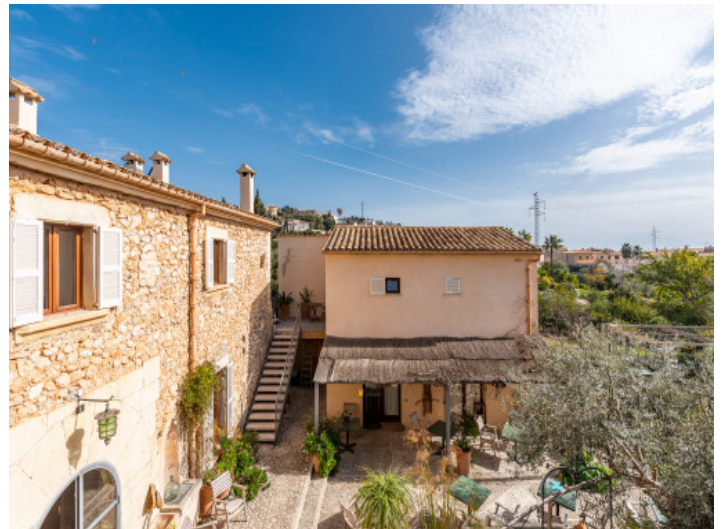
View over the wonderful terrace

All information is correct to the best of our knowledge. Errors and prior sale excepted. This prospectus is purely for information purposes. Only the notarized deed of sale is legally binding.