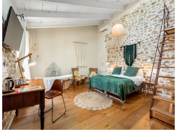
Bedroom with unique character