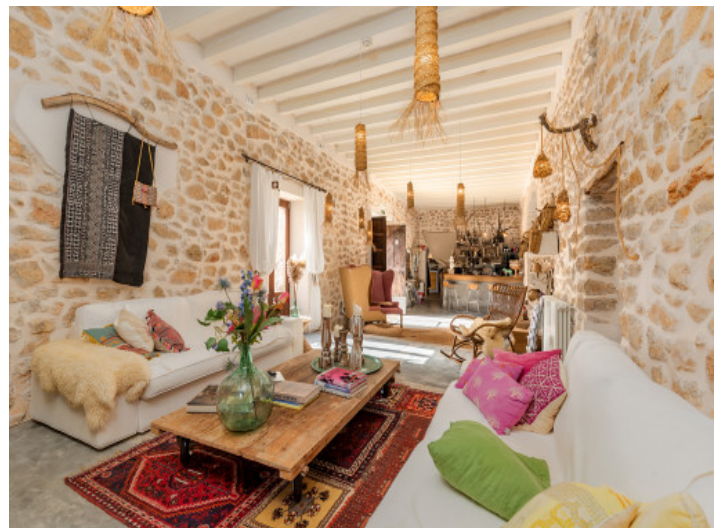
Large, open living area

All information is correct to the best of our knowledge. Errors and prior sale excepted. This prospectus is purely for information purposes. Only the notarized deed of sale is legally binding.