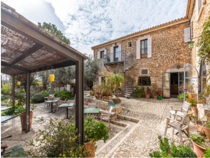
Enchantig front terrace