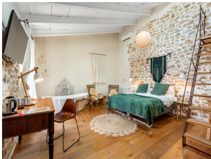
Bedroom with unique character