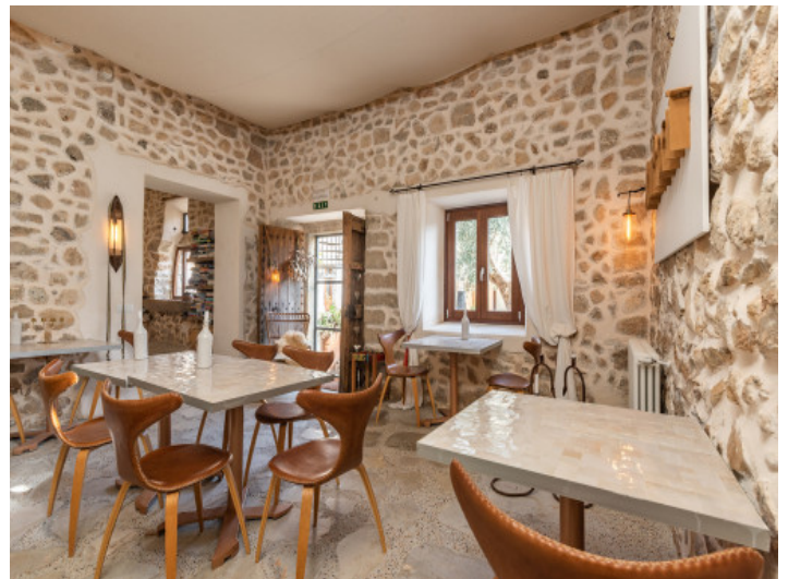
Separate spacious dining room