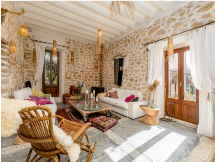
Comfortable living area with terrace access