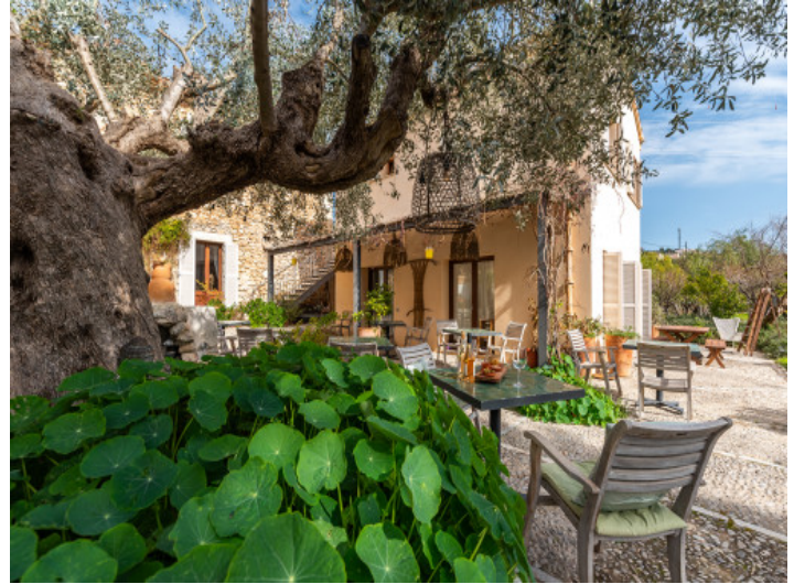
Perfect place to enjoy a drink