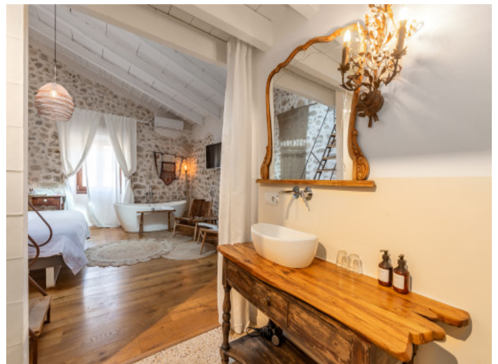
Fantastic en suite bathroom

All information is correct to the best of our knowledge. Errors and prior sale excepted. This prospectus is purely for information purposes. Only the notarized deed of sale is legally binding.