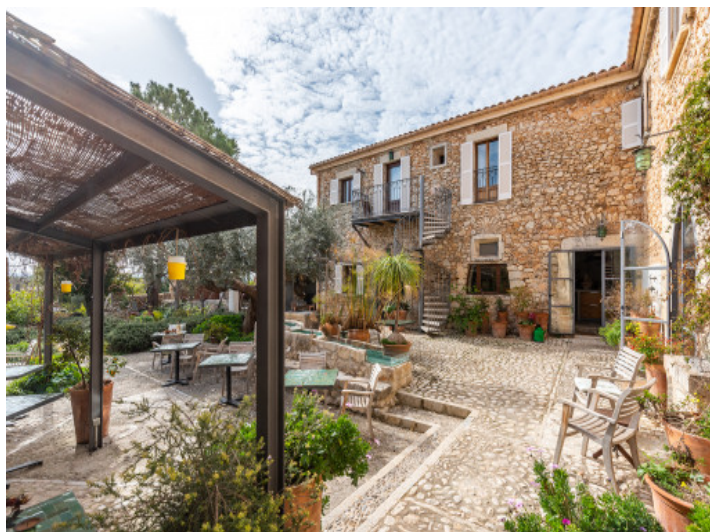
Enchantig front terrace