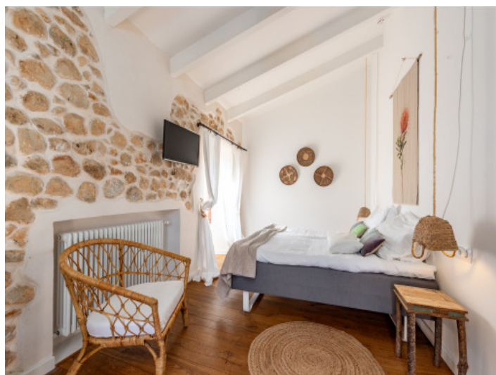
One of 8 bedrooms