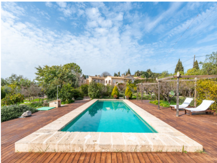
Large 12 x 4 metres pool and sun terrace