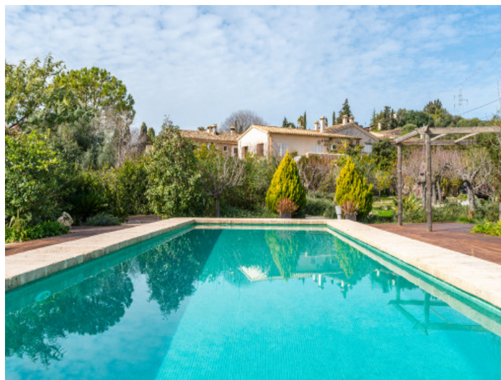
Beautifully located salt-water pool