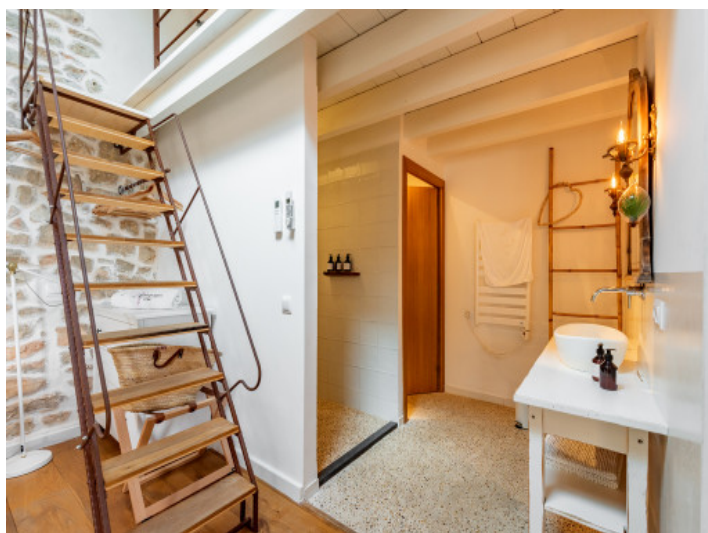
Open modern bathroom