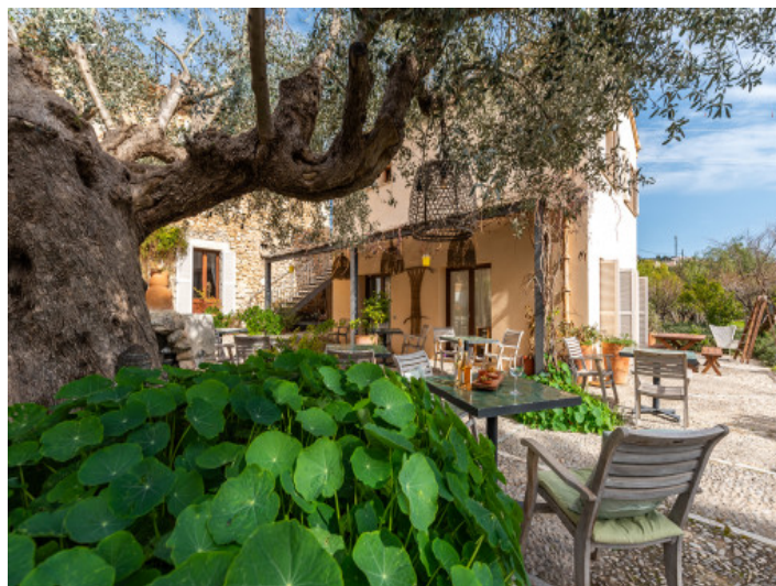
Perfect place to enjoy a drink