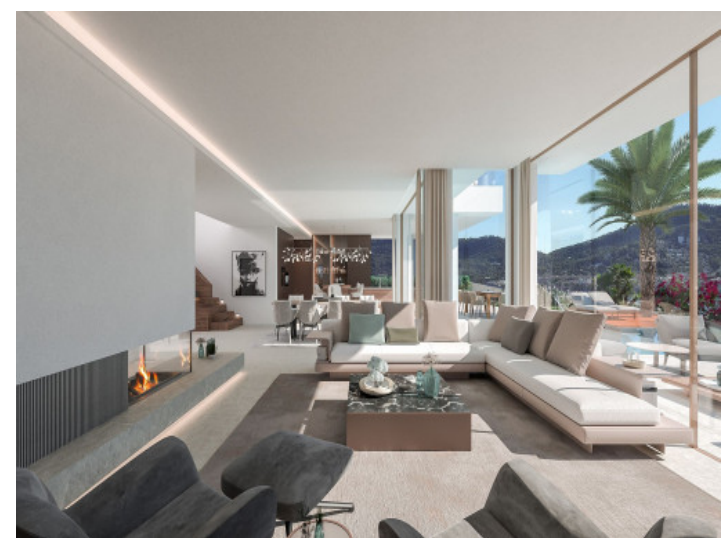
Lightflooded living area