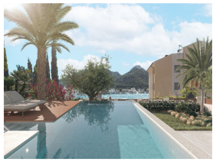
Infinity pool with harbour views