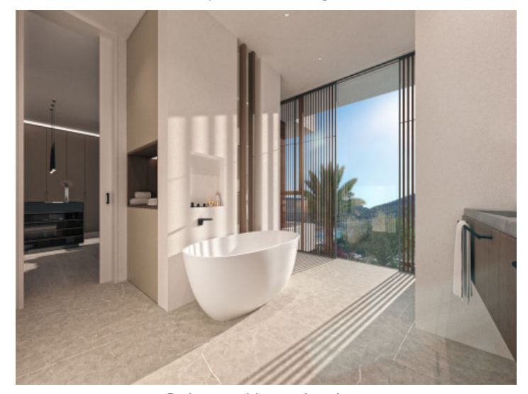
Bathroom with stunning views