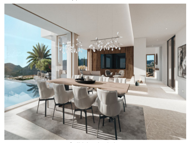
Stylish interior design