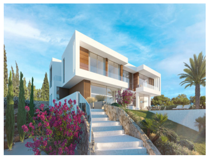
Exterior view of the villa

All information is correct to the best of our knowledge. Errors and prior sale excepted. This prospectus is purely for information purposes. Only the notarized deed of sale is legally binding.