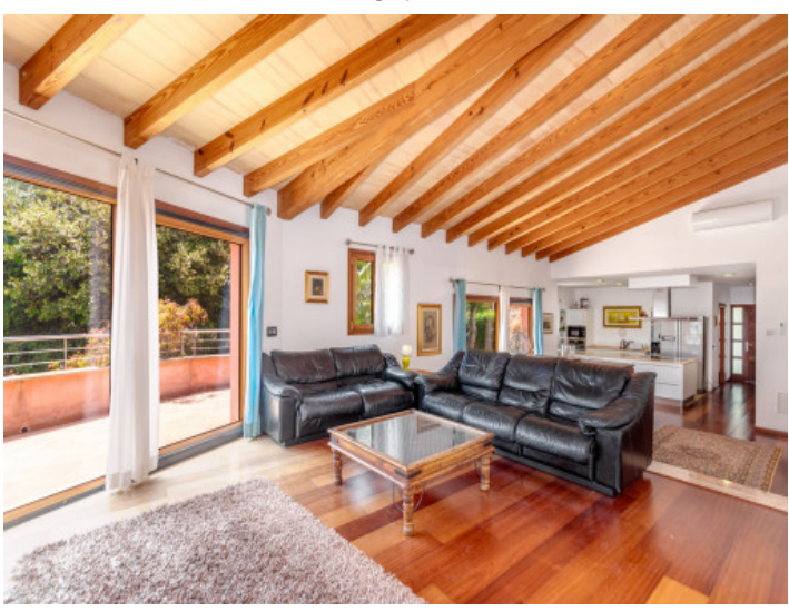
Comfortable living area