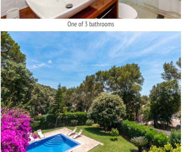
View to the garden and pool Facade All information is correct to the best of our knowledge. Errors and prior sale excepted. This prospectus is purely for information purposes. Only the notarized deed of sale is legally binding.