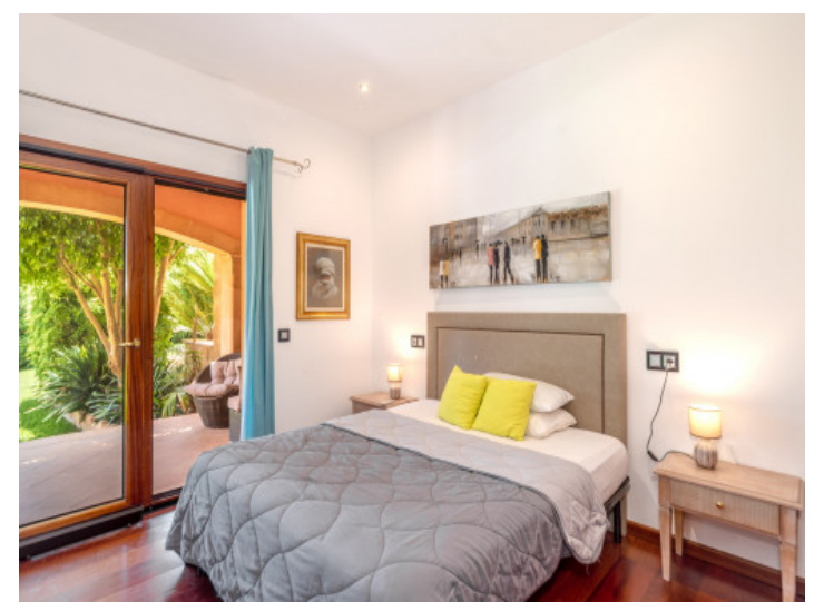
Bedroom on the groundfloor Bedroom All information is correct to the best of our knowledge. Errors and prior sale excepted. This prospectus is purely for information purposes. Only the notarized deed of sale is legally binding.

PORTA MALLORQUINA • THERESIENSTR.: 81, 80333 MUNICH TEL. +34 971 698 242 • INFO@PORTAMALLORQUINA.COM