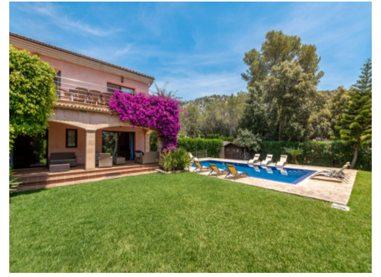
Very well mantained garden

PORTA MALLORQUINA® Your home. Our passion.