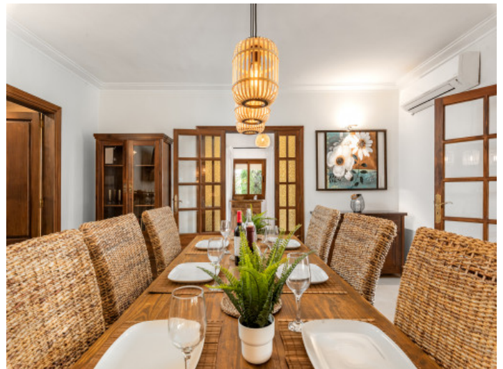
Dining area in the centre of the room