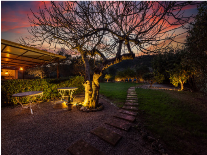
View into the garden