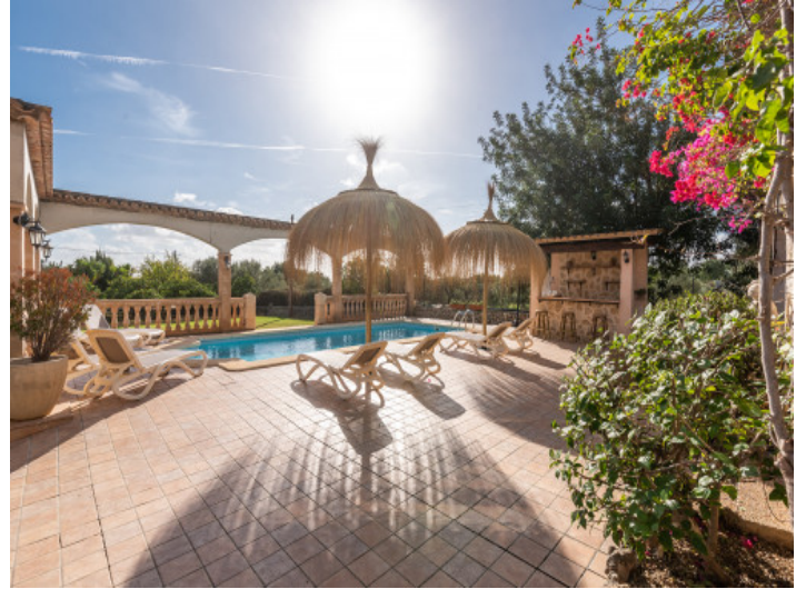
Lovely pool area