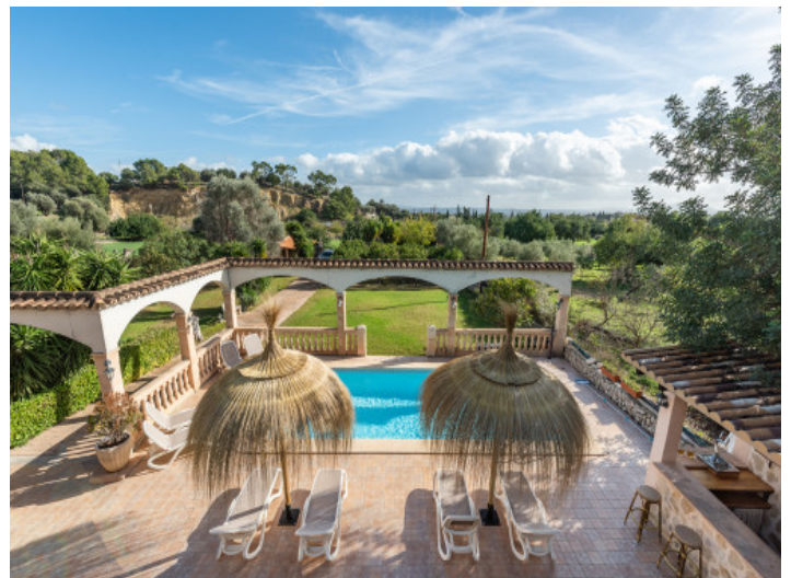
View over the garden

All information is correct to the best of our knowledge. Errors and prior sale excepted. This prospectus is purely for information purposes. Only the notarized deed of sale is legally binding.