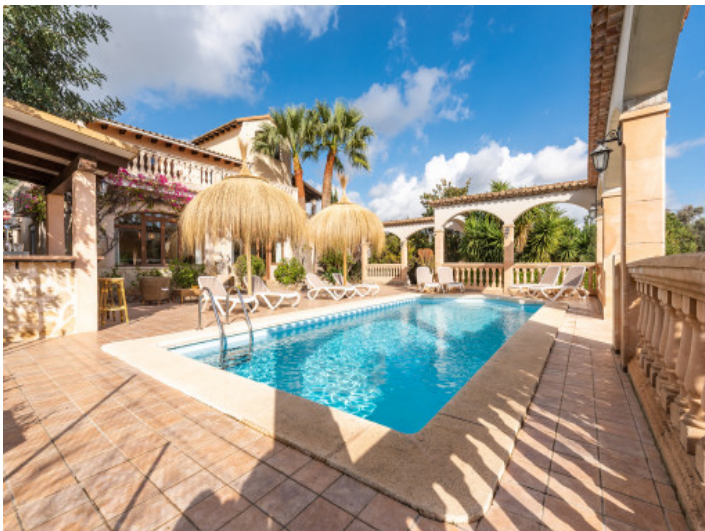
Wonderful, sunny pool area