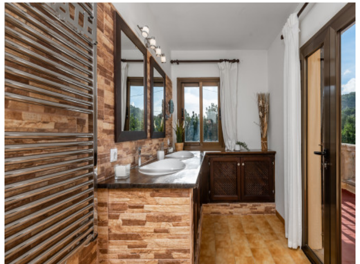
Bathroom with terrace access