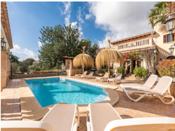
View from the pool to the house