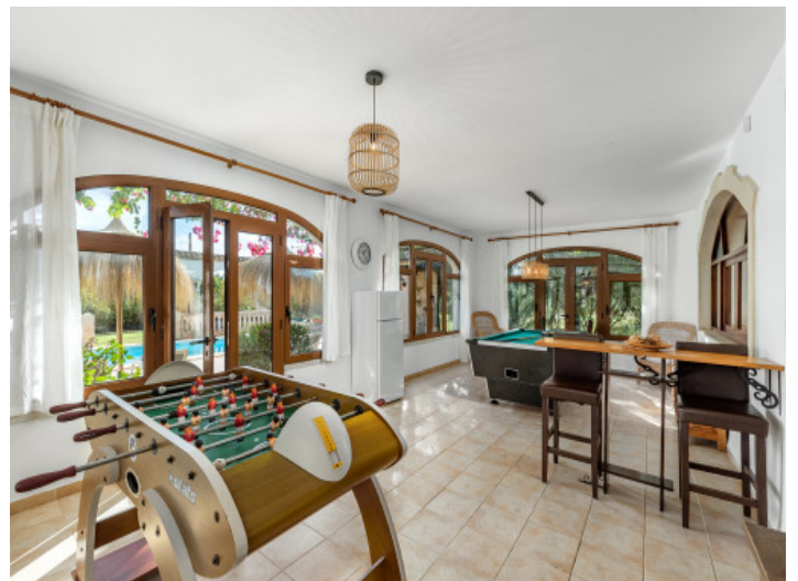
Wintergarden-like leisure room with terrace access

All information is correct to the best of our knowledge. Errors and prior sale excepted. This prospectus is purely for information purposes. Only the notarized deed of sale is legally binding.