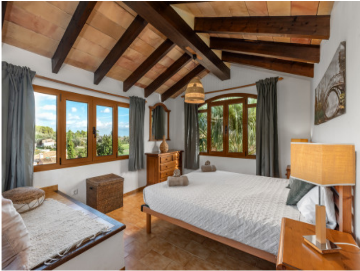
Cosy bedroom with wooden beams