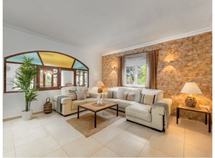
Living area with stone wall