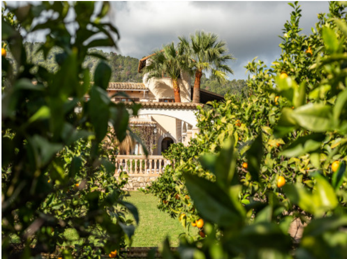
Garden and finca