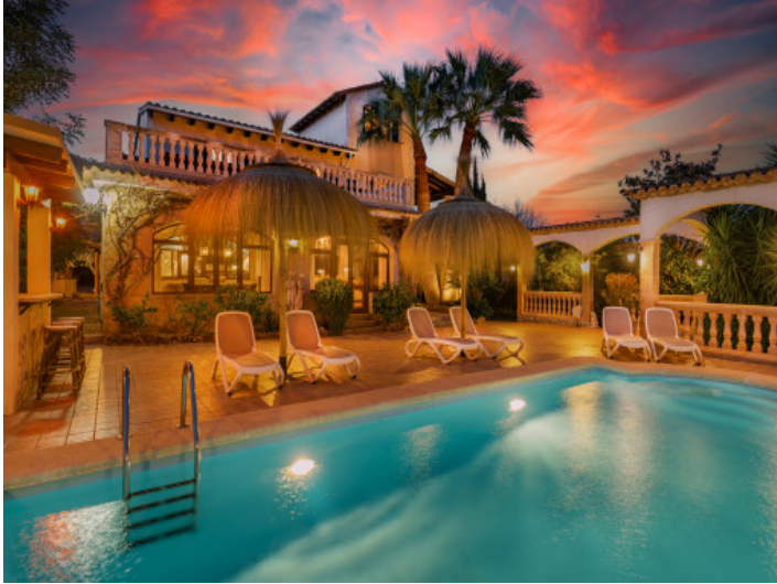
The pool area at night