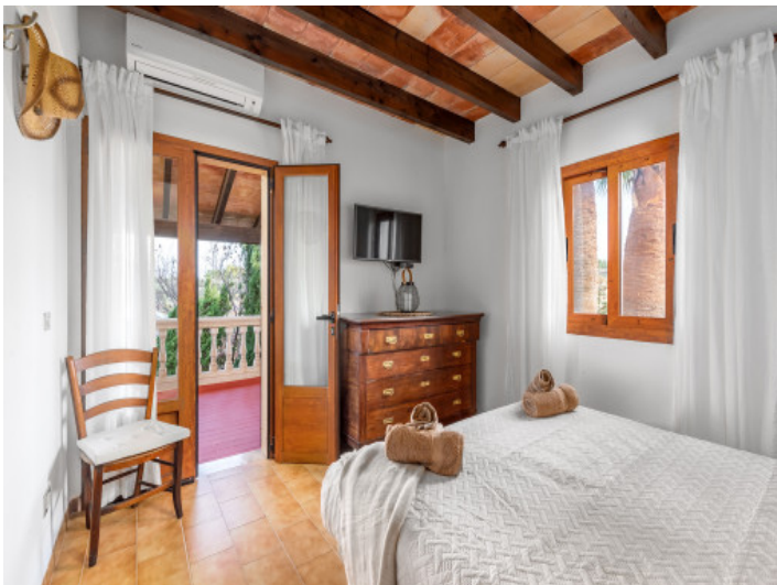
Bedroom with access to the upper terrace