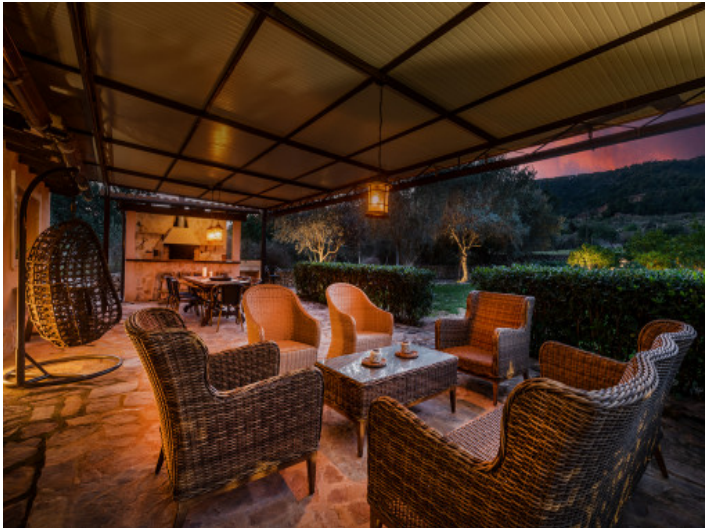
Terrace at night