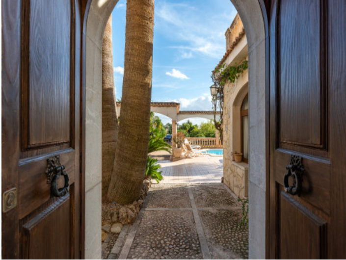
Entrance to the house