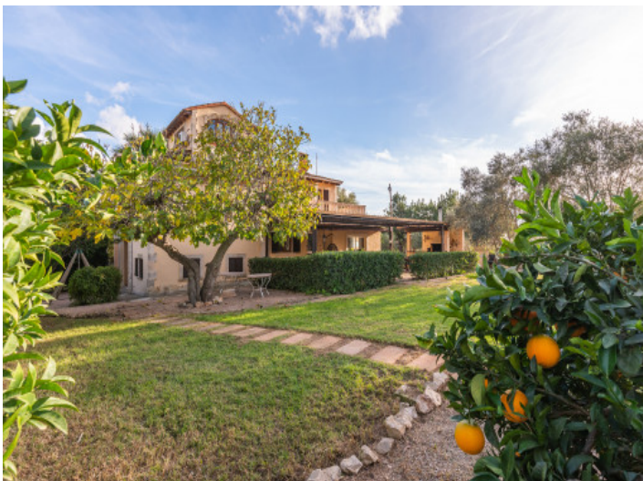
Garden with various plants and trees