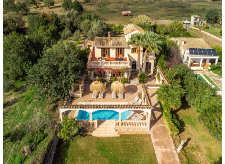
Dreamlike finca with holiday rental license in Biniamar, Selva