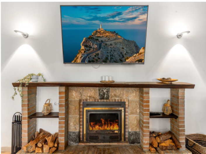
Cosy fireplace for winter days