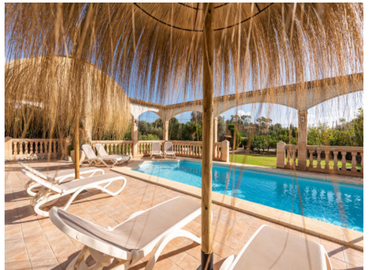
Pool oasis with garden views