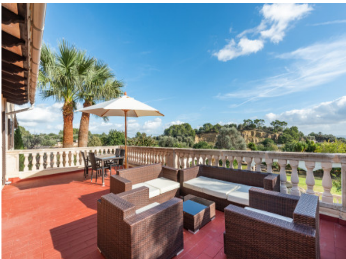
Upper terrace with a view