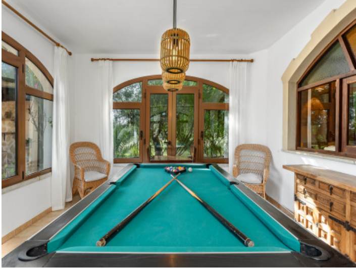
Fantastic billiard area