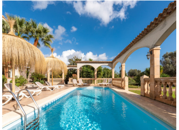
Dreamlike finca with holiday rental license in Biniamar, Selva