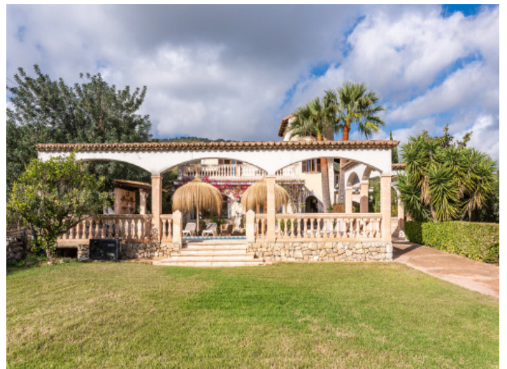
View from the garden

All information is correct to the best of our knowledge. Errors and prior sale excepted. This prospectus is purely for information purposes. Only the notarized deed of sale is legally binding.