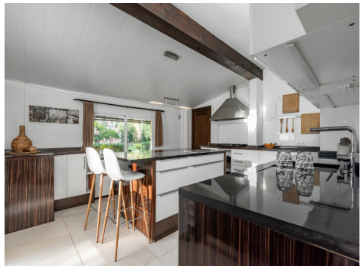
Large, modern kitchen

All information is correct to the best of our knowledge. Errors and prior sale excepted. This prospectus is purely for information purposes. Only the notarized deed of sale is legally binding.