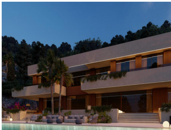
Exterior view by day