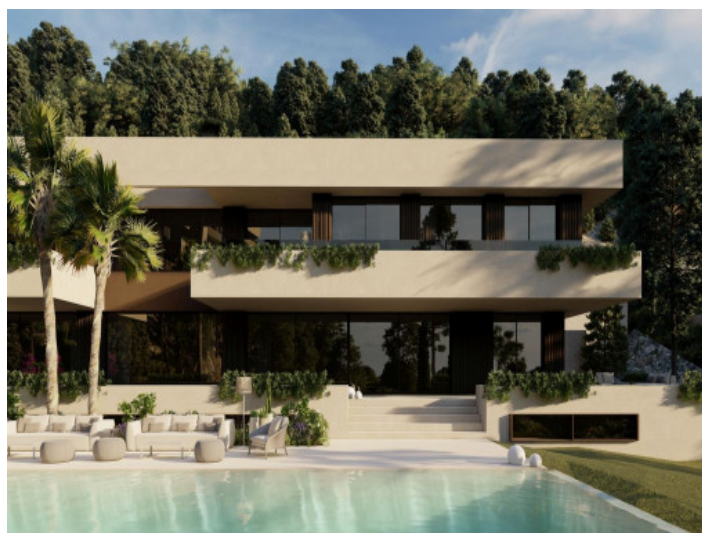
Exterior view during the day