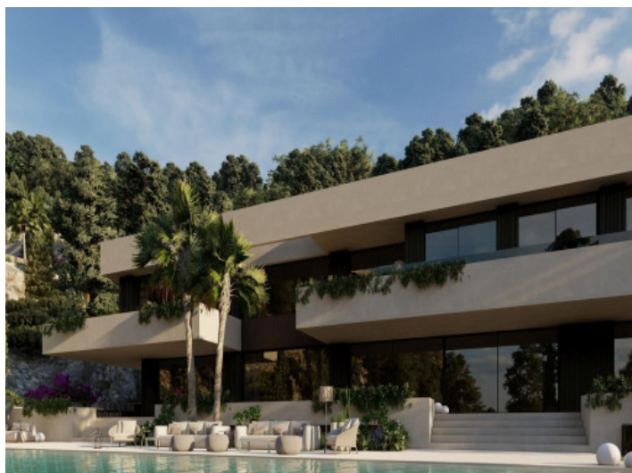
Exterior view during the day