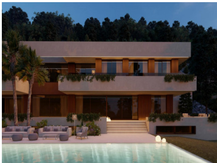
Exterior view by night