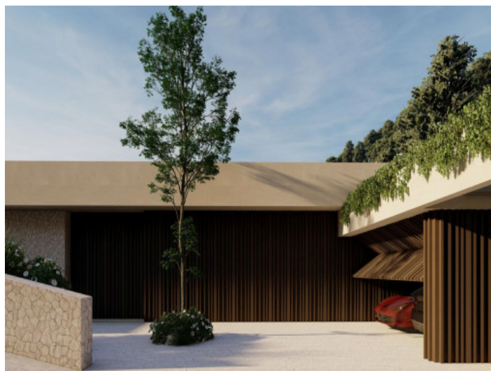
Access / Garage

All information is correct to the best of our knowledge. Errors and prior sale excepted. This prospectus is purely for information purposes. Only the notarized deed of sale is legally binding.