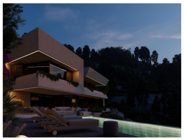
The villa and pool area by nigth