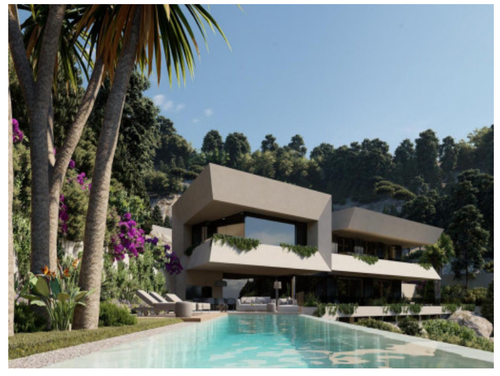
Exterior and pool area of the villa