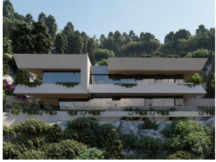
Impressive villa in the hills of Son Vida