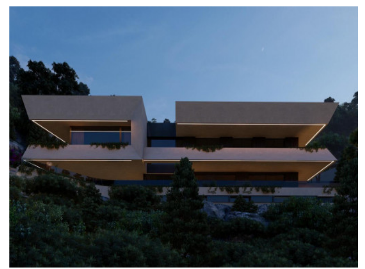
The villa by night Exterior view of the villa All information is correct to the best of our knowledge. Errors and prior sale excepted. This prospectus is purely for information purposes. Only the notarized deed of sale is legally binding.

PORTA MALLORQUINA • THERESIENSTR.: 81, 80333 MUNICH TEL. +34 971 698 242 • INFO@PORTAMALLORQUINA.COM