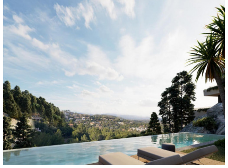
View from the pool area

PORTA MALLORQUINA® Your home. Our passion.