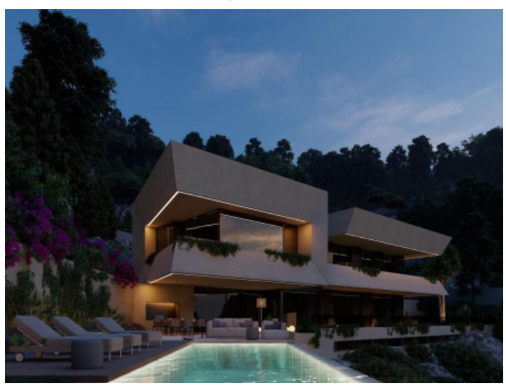
The villa by night