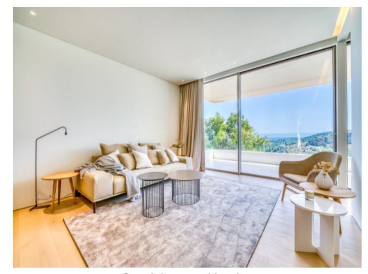
Cozy sitting area with a view