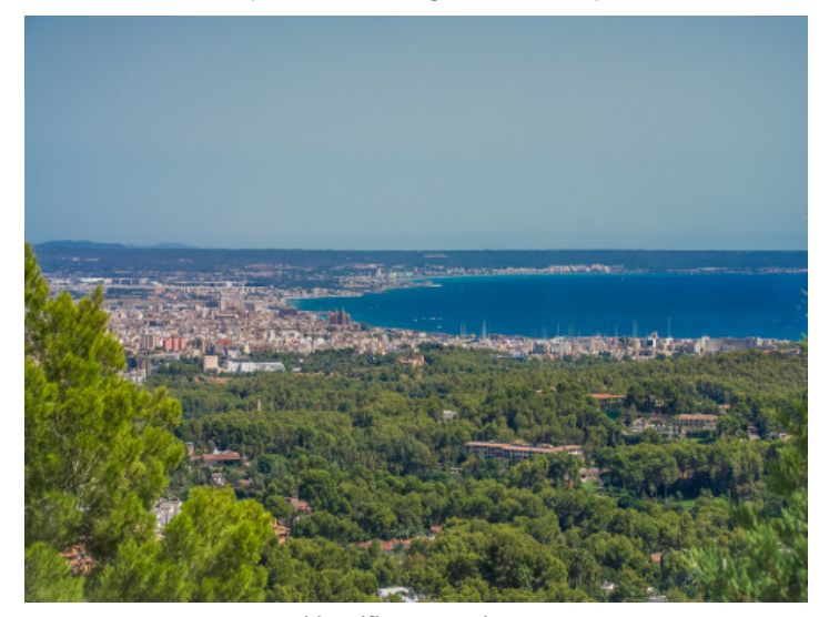
Magnificent sea views