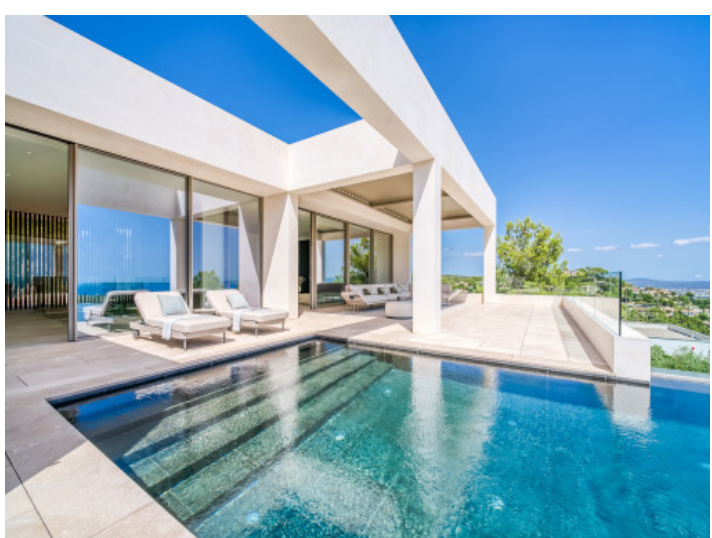
Splendid pool area