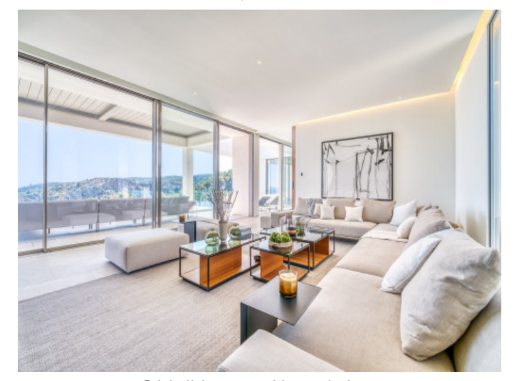
Bright living room with superb views