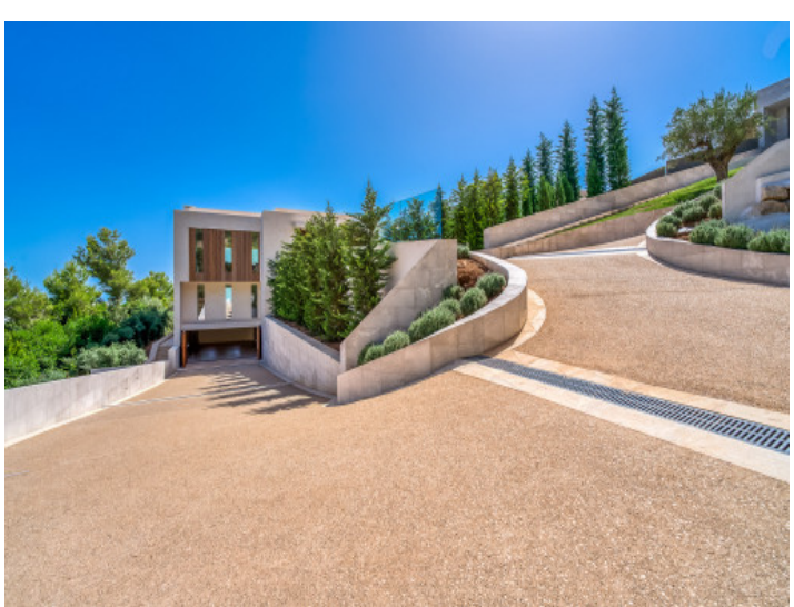
The driveway towards the garage