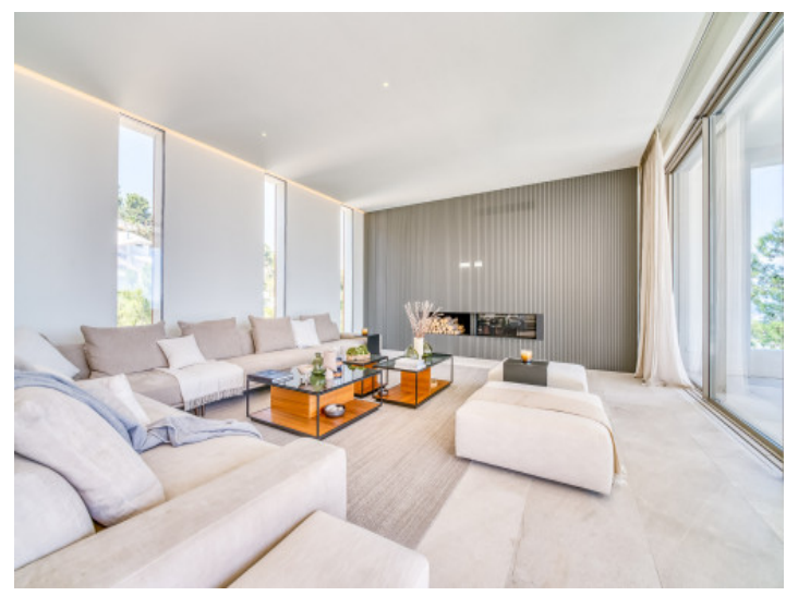
Beautiful living room