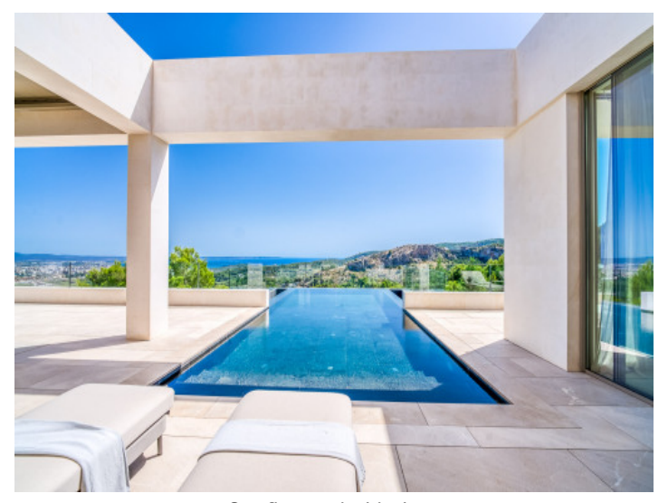
Overflow pool with views