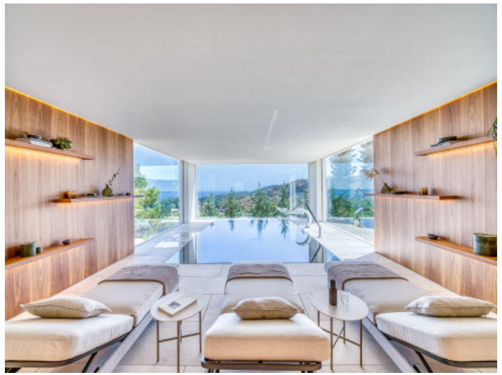
The Spa area with loungers and indoor pool