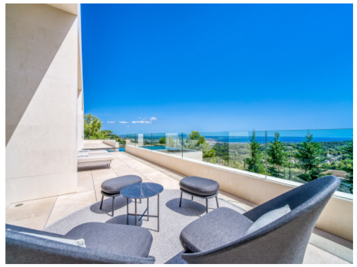
Spacious terrace with views