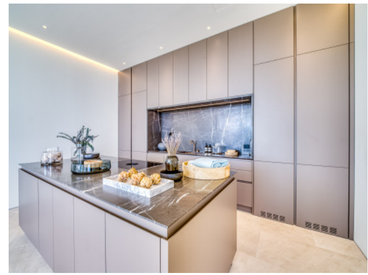
Fully equipped modern kitchen