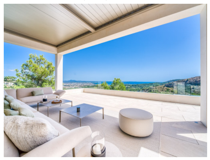
Large covered terrace with seating area