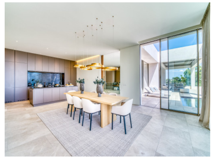
Open-plan dining area with kitchen