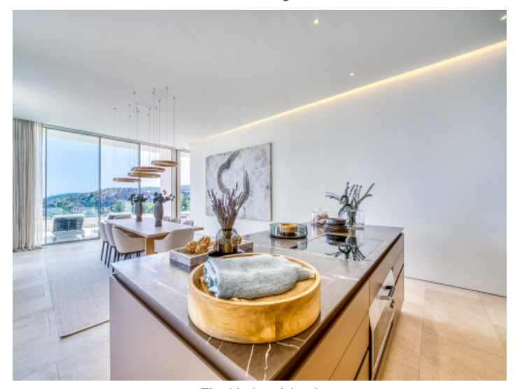
The kitchen island