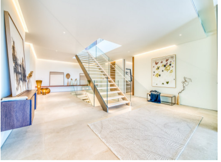
The modern staircase