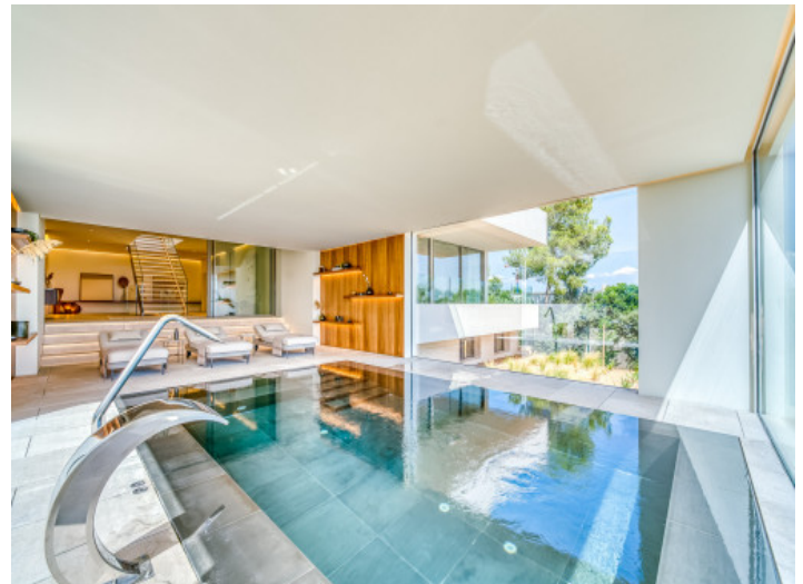
The Spa area