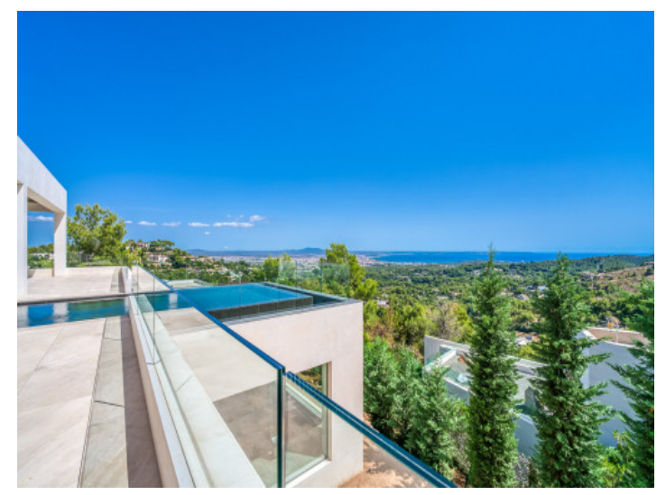
Sea and mountain views