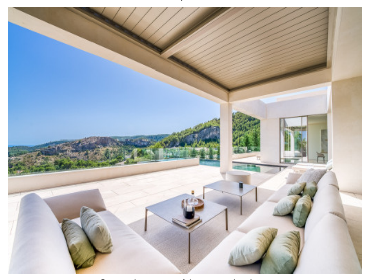
Covered terrace with mountain views