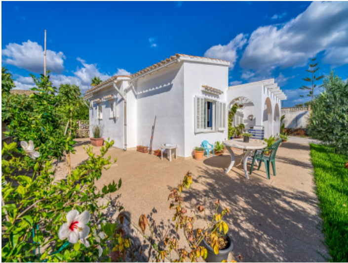
Large terrace surrounds the house