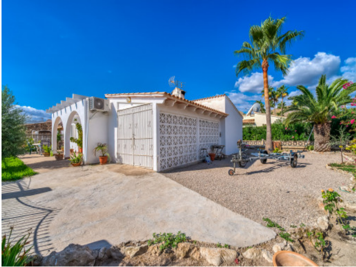
Spacious outdoor area