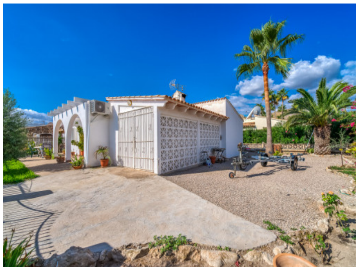
Spacious outdoor area