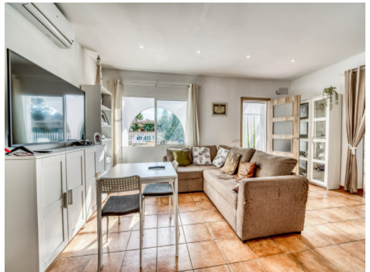
Entrance and living area