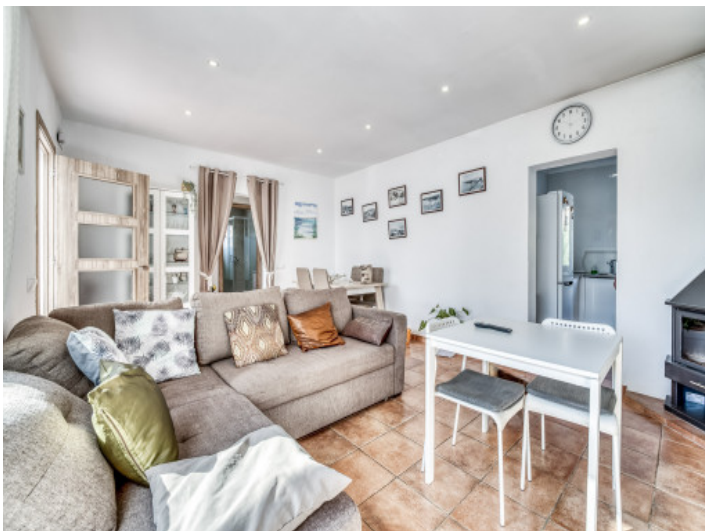
Bright living and dining area