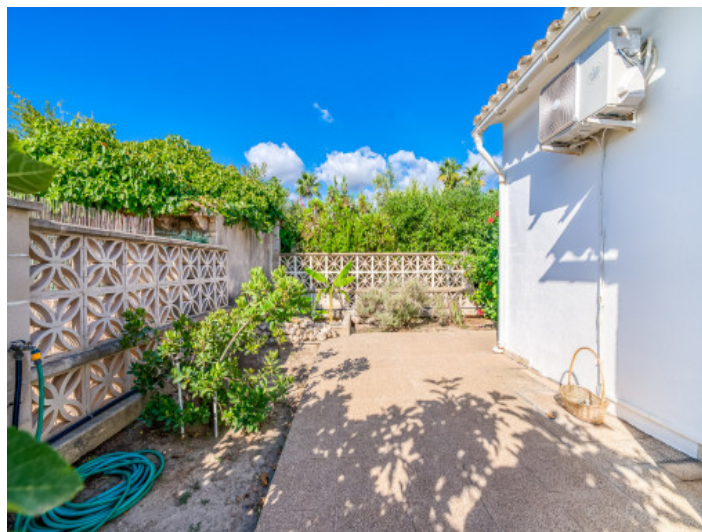
Terrace and small garden