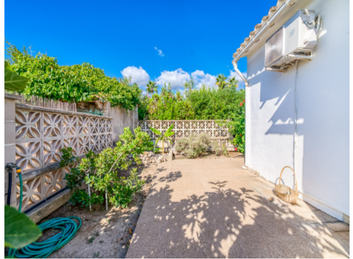
Terrace and small garden