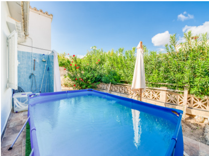
Terrace with pool and outdoor shower