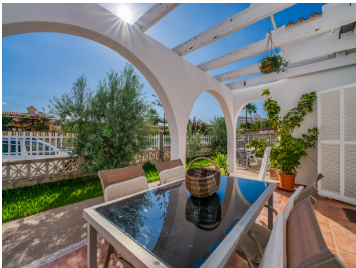
Front terrace with dining area