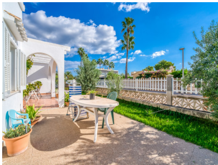
Beautiful front terrace