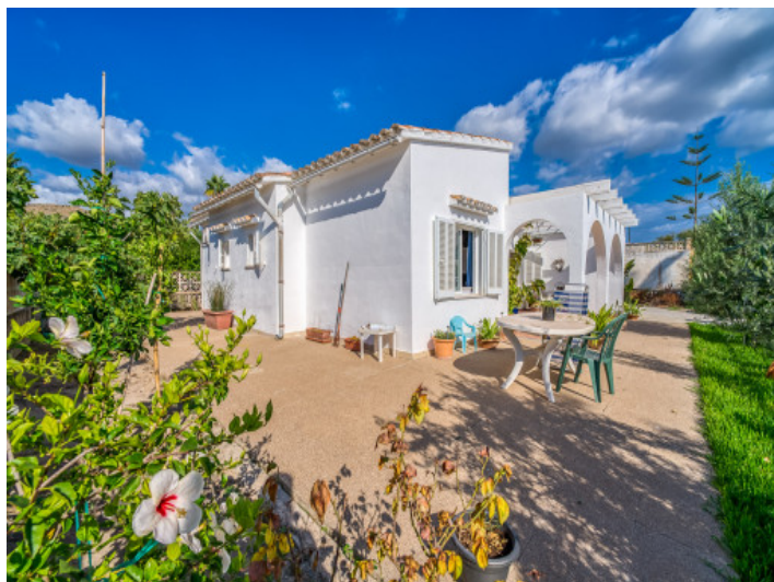
Large terrace surrounds the house