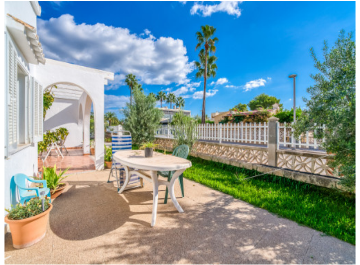
Beautiful front terrace