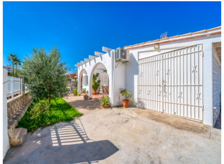
Access to the garage

All information is correct to the best of our knowledge. Errors and prior sale excepted. This prospectus is purely for information purposes. Only the notarized deed of sale is legally binding.